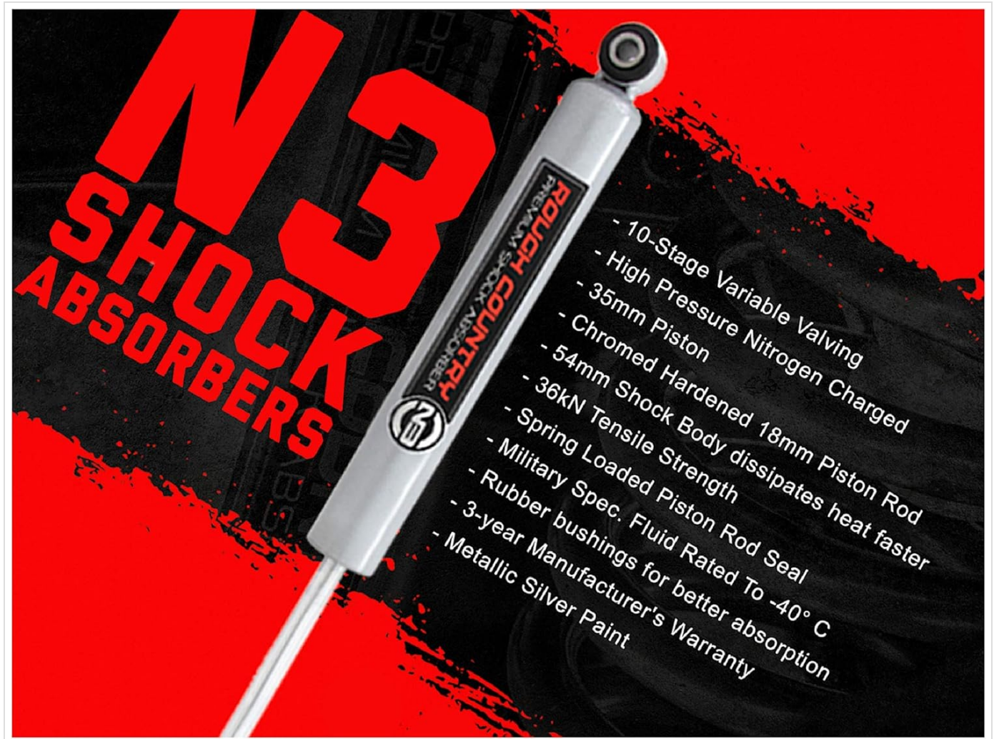
Figure 2: Detailed view of the Rough Country N3 Shock Absorber, highlighting its key features and construction specifications.