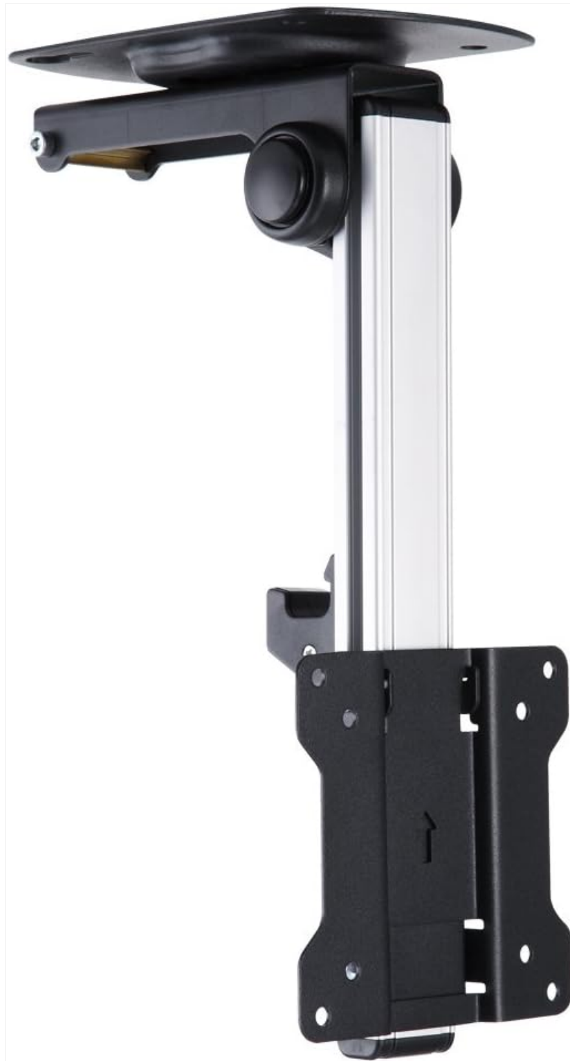
The PureMounts PM-SLOPE-23 TV ceiling mount in its folded position after assembly.