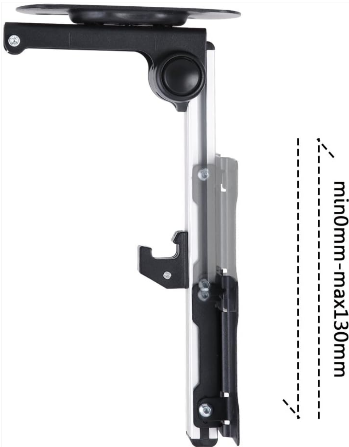
This image illustrates the minimum and maximum extension range of the mount, approximately 0mm to 130mm.