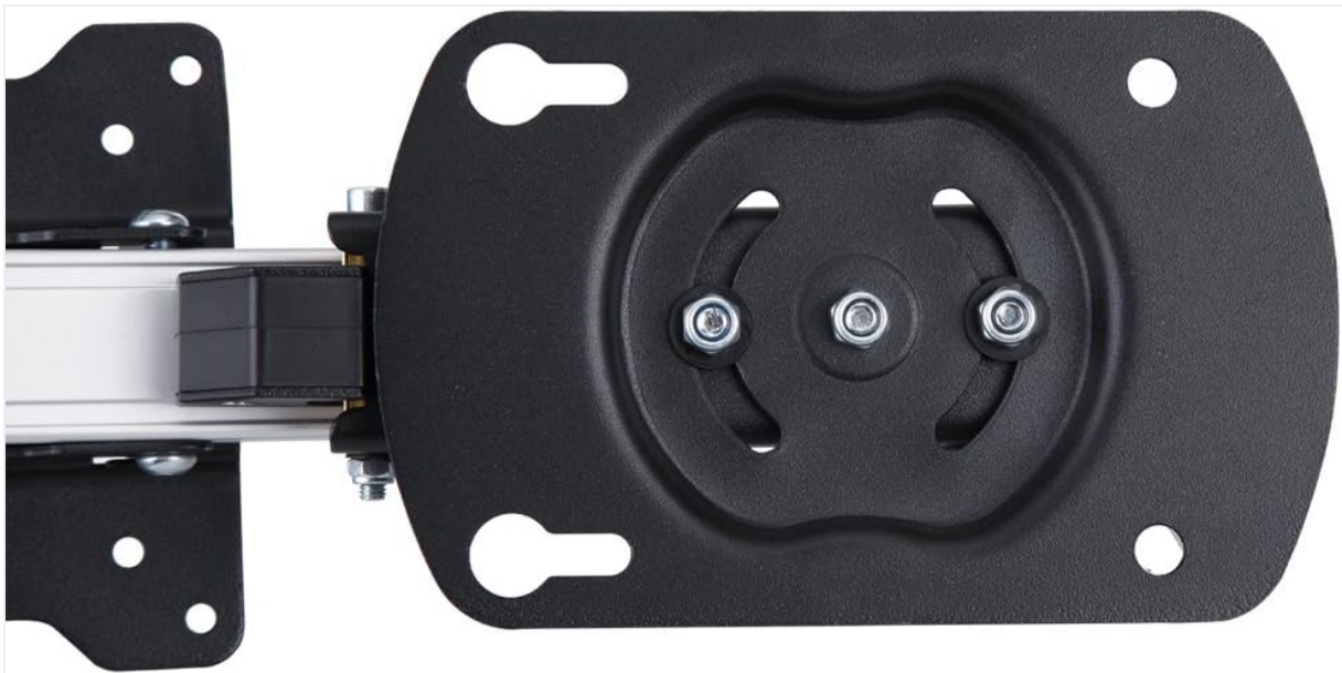
Close-up view of the ceiling mounting plate, showing attachment points.