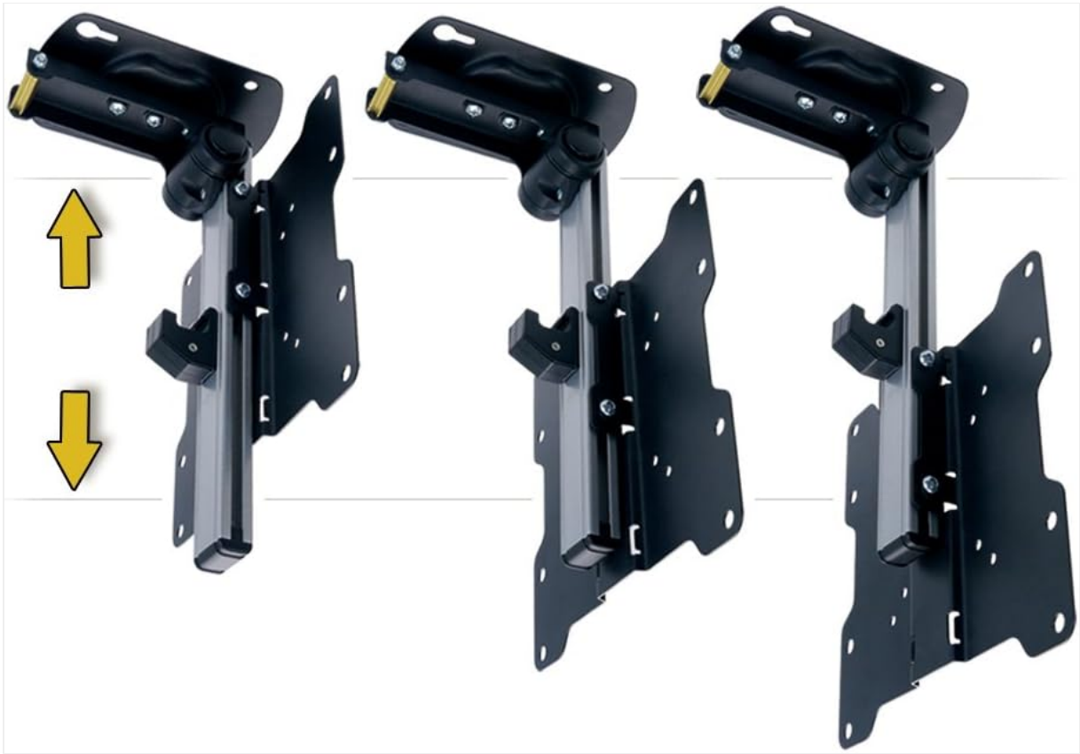
Demonstration of the height adjustment feature, showing the vertical movement of the VESA plate.