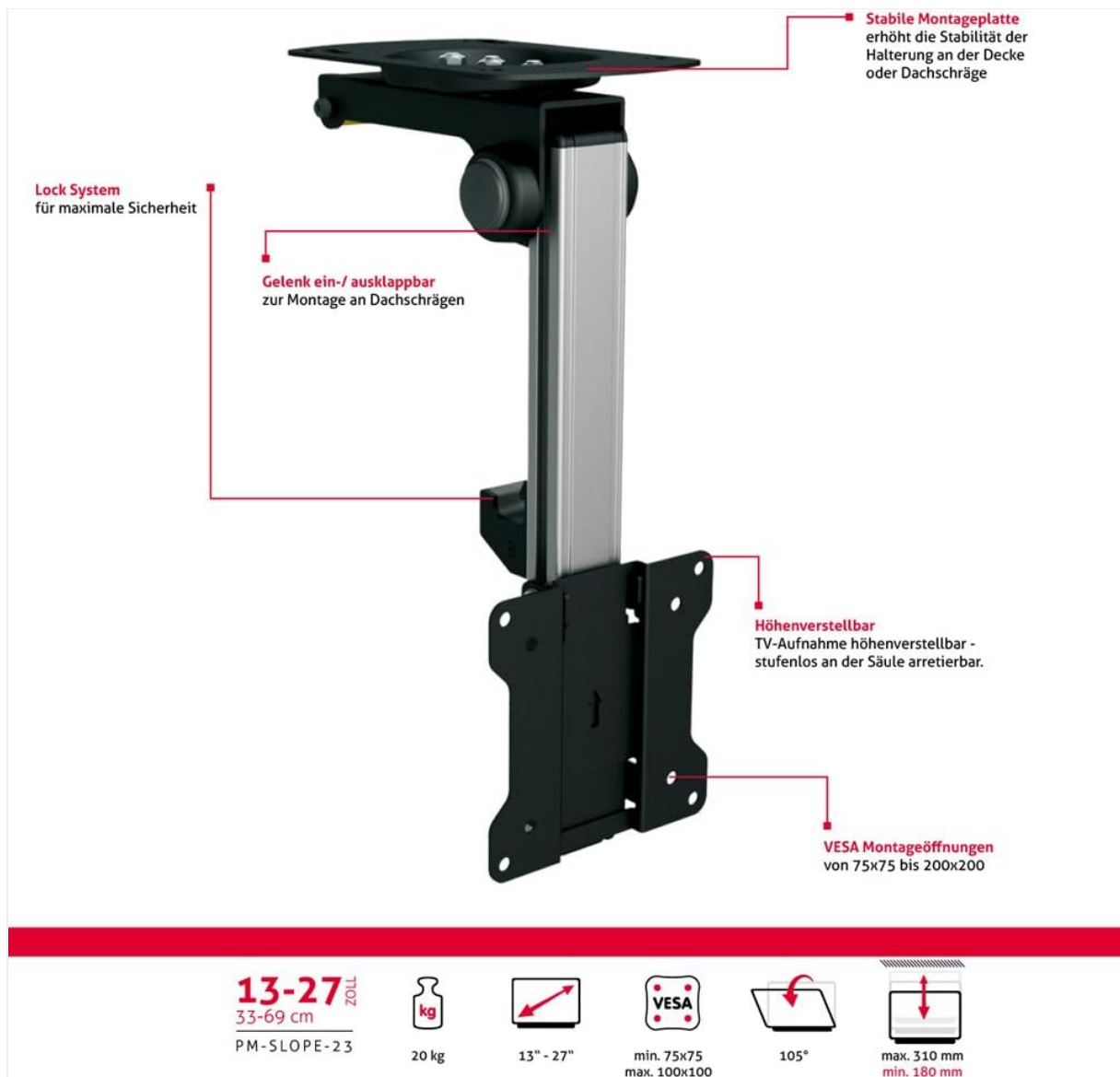
This diagram illustrates the various components and features of the PureMounts PM-SLOPE-23 mount, including the ceiling plate, adjustable arm, VESA plate, and locking mechanism.