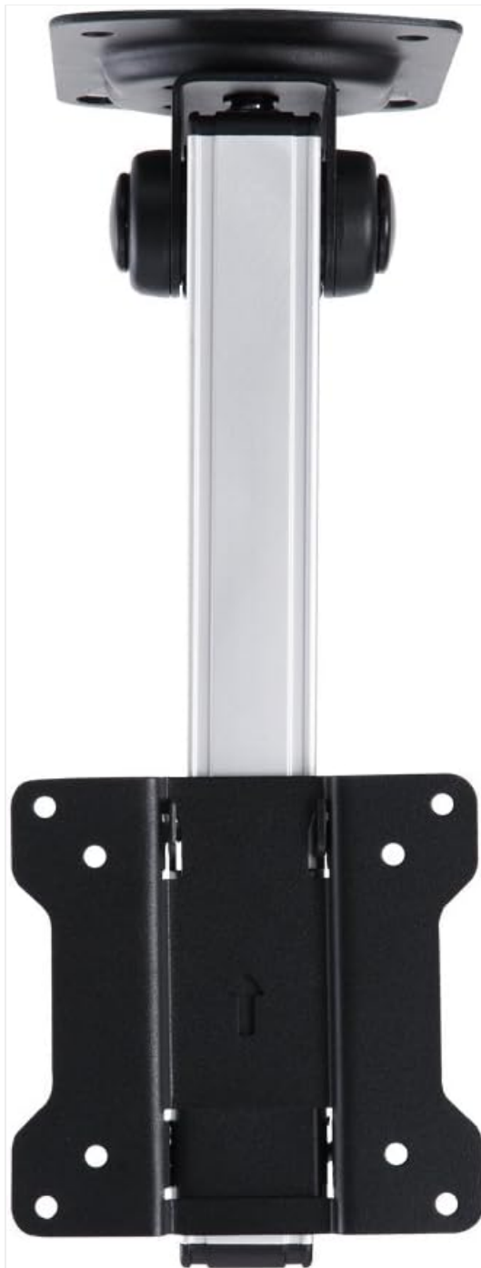
Front view of the mount, highlighting the VESA plate for TV attachment.