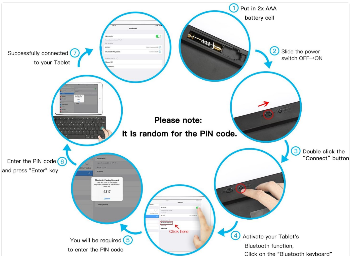
Image: Step-by-step visual guide for connecting the OMOTON Bluetooth Keyboard, from battery insertion to successful pairing.

Note: The PIN code is randomly generated for security. If pairing fails, try repeating the steps.