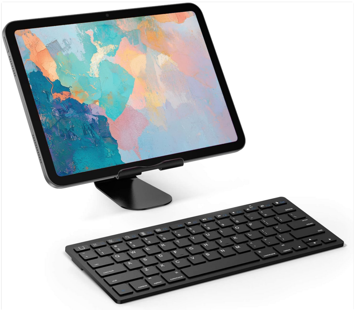
Image: The OMOTON Bluetooth Keyboard positioned in front of a tablet, demonstrating a typical usage scenario.