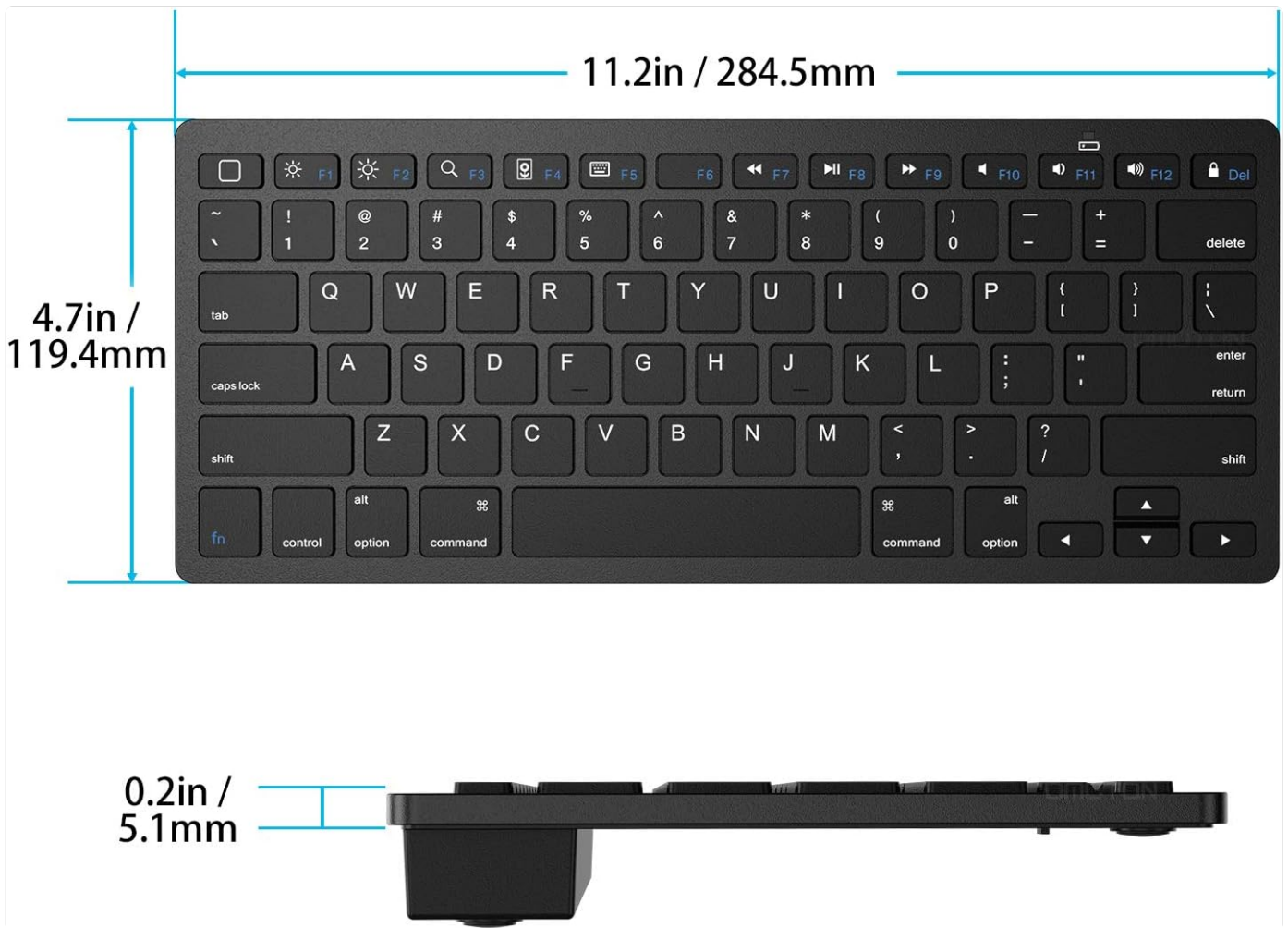
Image: Detailed dimensions of the OMOTON Bluetooth Keyboard, including length, width, and thickness.