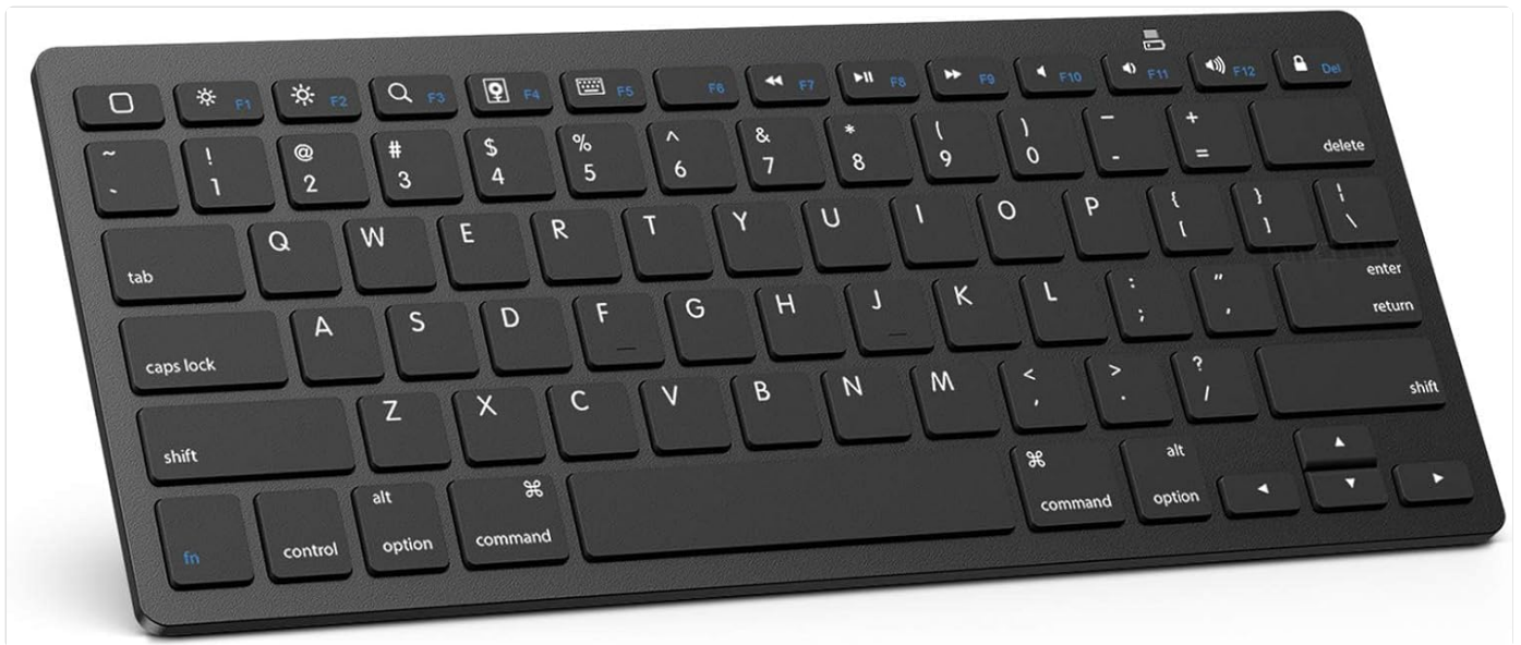
Image: OMOTON Bluetooth Keyboard, showcasing its slim design and full QWERTY layout.

This manual provides comprehensive instructions for the setup, operation, maintenance, and troubleshooting of your OMOTON Bluetooth Keyboard. Designed for seamless connectivity, this keyboard offers a convenient and efficient typing experience across various Bluetooth-enabled devices.