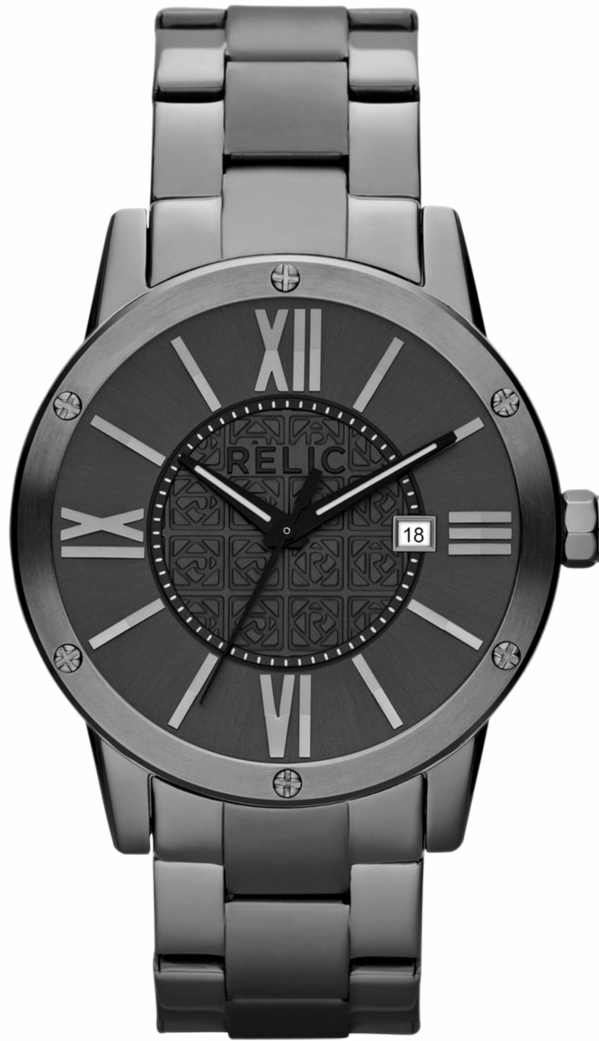
Image: Front view of the RELIC Payton Bracelet Men's Gunmetal Watch.