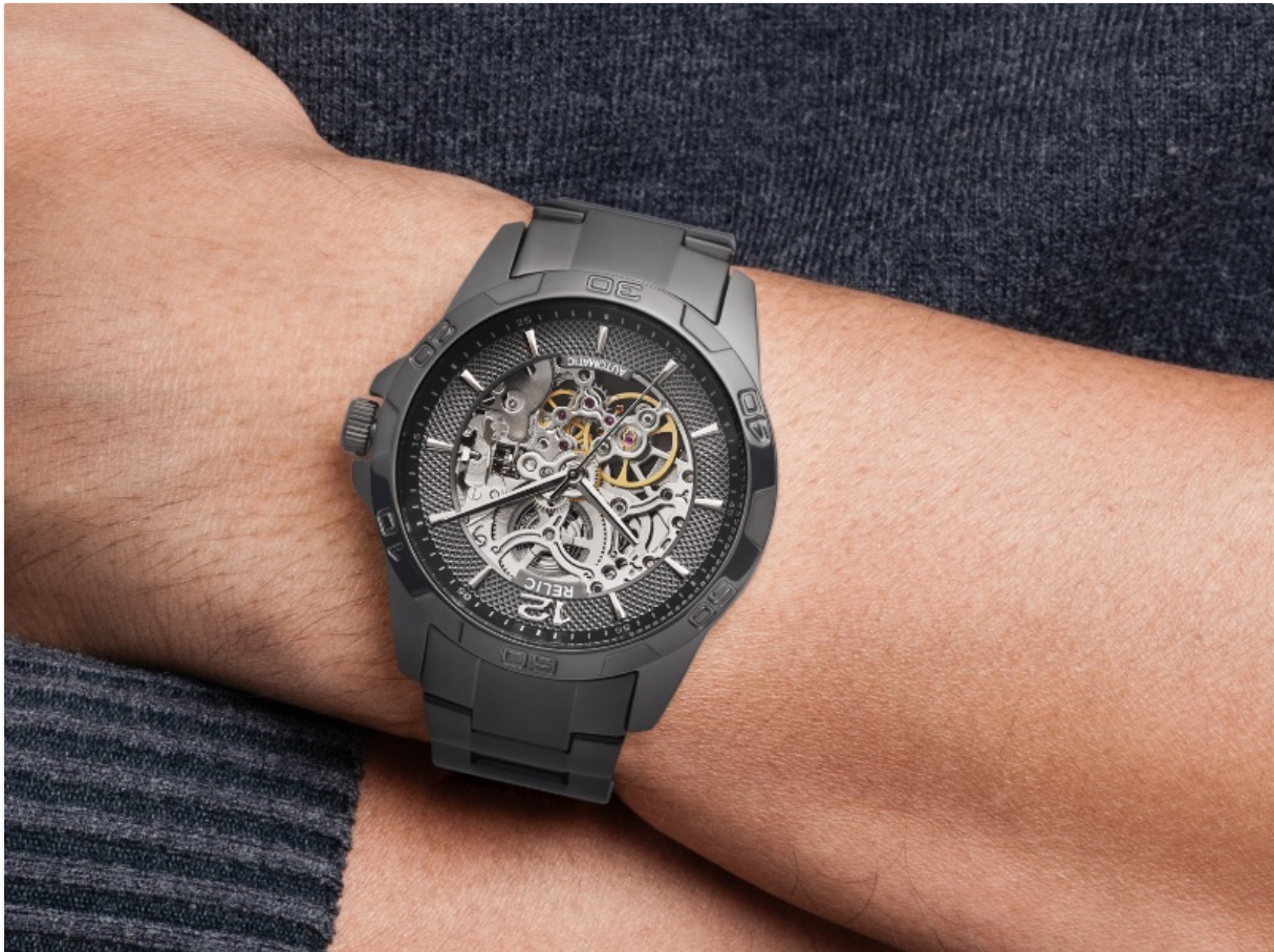
Image: Men's Watch Case Size Guide for reference.

The stainless steel bracelet may require adjustment for a comfortable fit. This typically involves removing or adding links. It is recommended to have this adjustment performed by a qualified jeweler or watch technician to prevent damage to the bracelet or clasp.