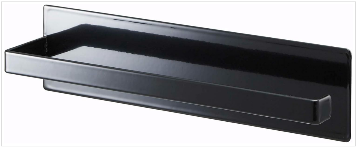
Image: The YAMAZAKI 7128 Magnetic Kitchen Paper Holder in black, demonstrating its sleek design and magnetic attachment to a refrigerator side.