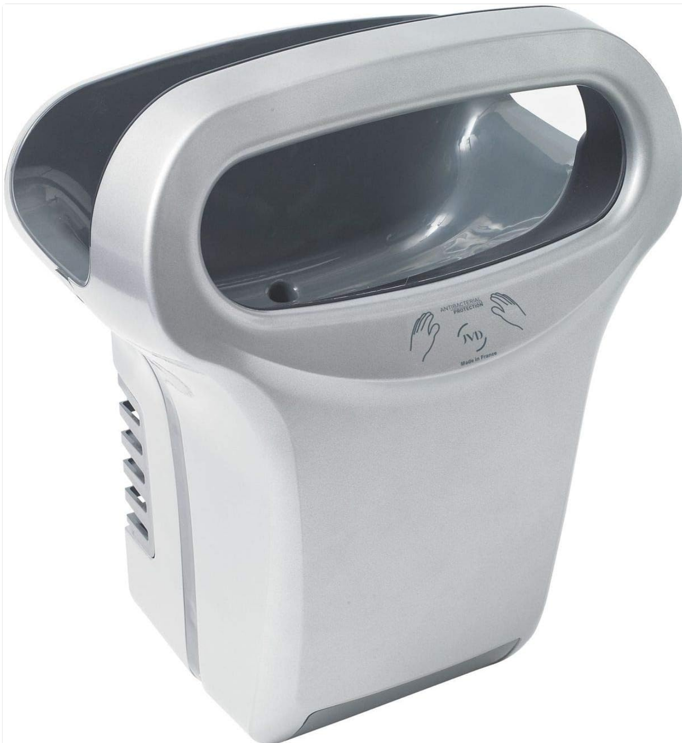
Figure 5.1: The hand dryer showing the sensor area, indicated by hand symbols, where users should place their hands for activation.