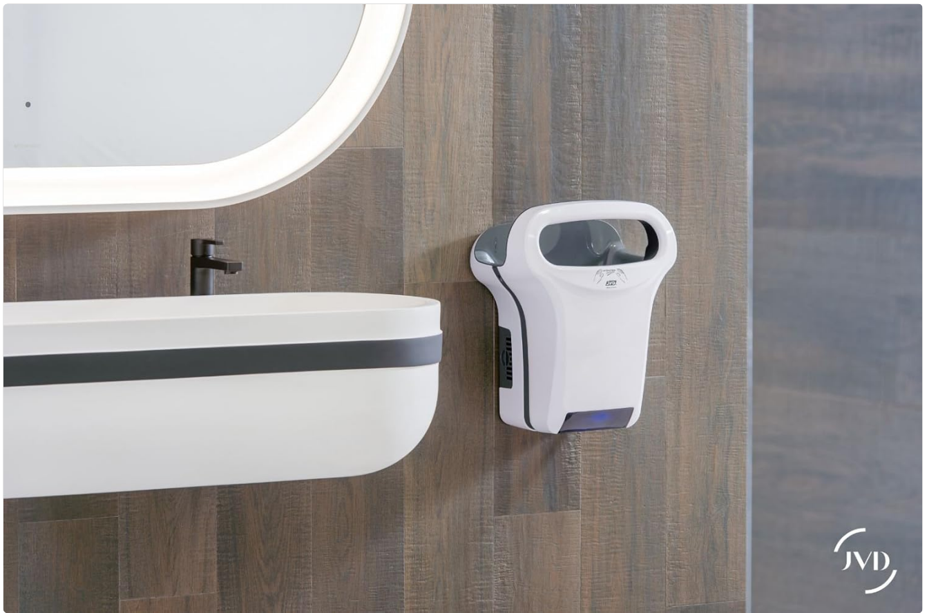
Figure 8.1: The JVD Expair Hand Dryer seamlessly integrated into a modern public restroom environment.