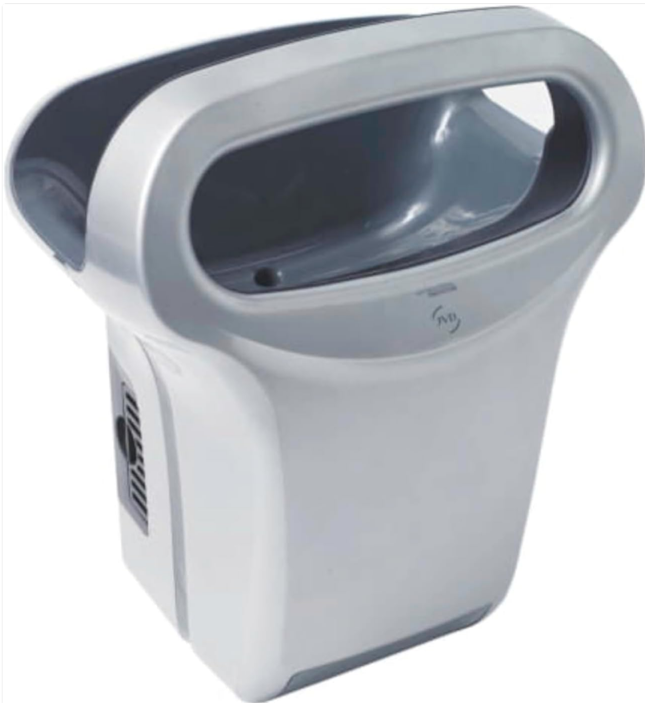
Figure 1.1: Front view of the JVD Expair Hand Dryer, showcasing its sleek design and grey finish.