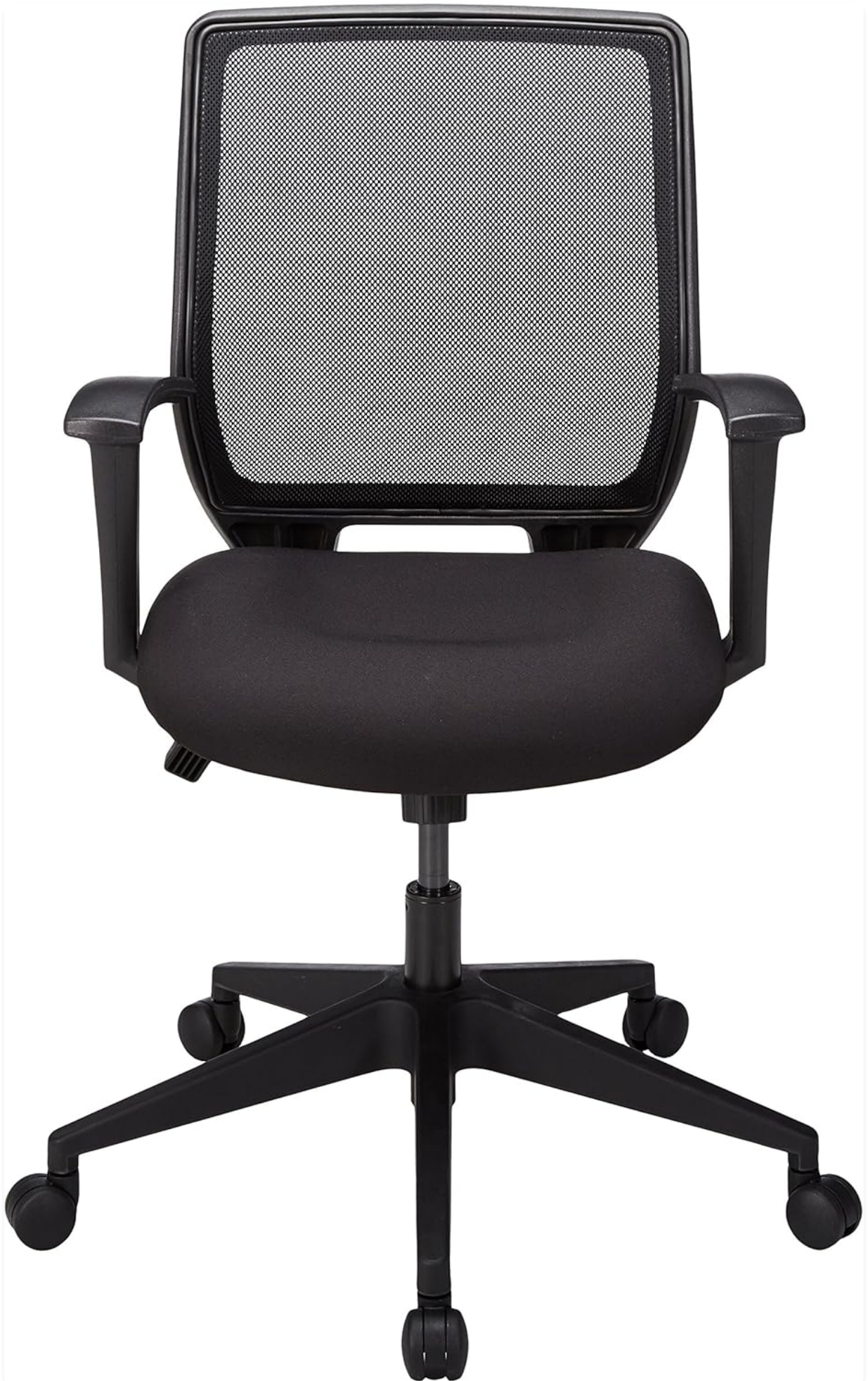
Image: Front view of the Lorell LLR84868 Executive Mid-Back Work Chair. The chair features a black mesh back, a black upholstered contoured seat, fixed armrests, and a five-star base with casters.