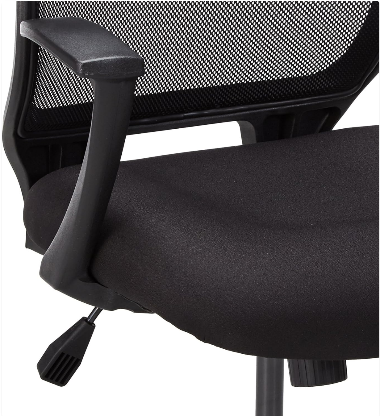
Image: Close-up view of the chair's seat, fixed armrest, and the adjustment lever located beneath the seat for height and tilt control.

Your Lorell LLR84868 chair offers several adjustment features to customize your seating experience: