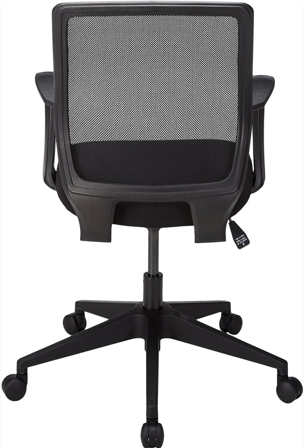
Image: Back view of the Lorell LLR84868 Executive Mid-Back Work Chair, highlighting the breathable mesh backrest and