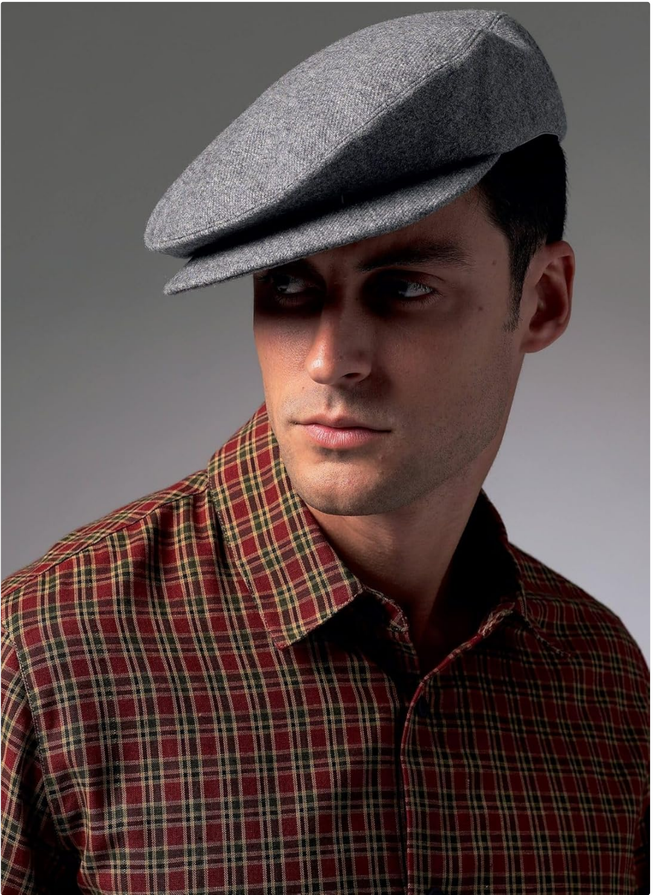
Image: A man wearing Hat Style A, a grey flat cap, viewed from the front.