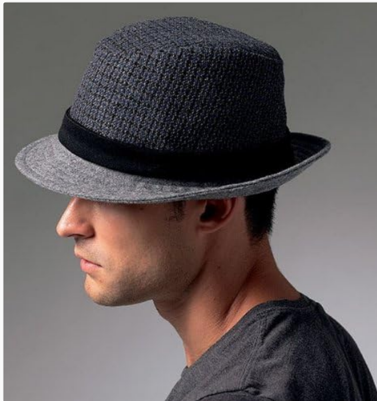
Image: A man wearing Hat Style E, a grey textured hat with a black band and lighter grey brim.

This hat features a contrast brim and a contrast band, offering a distinct visual appeal. This style requires Sew-In Interfacing.