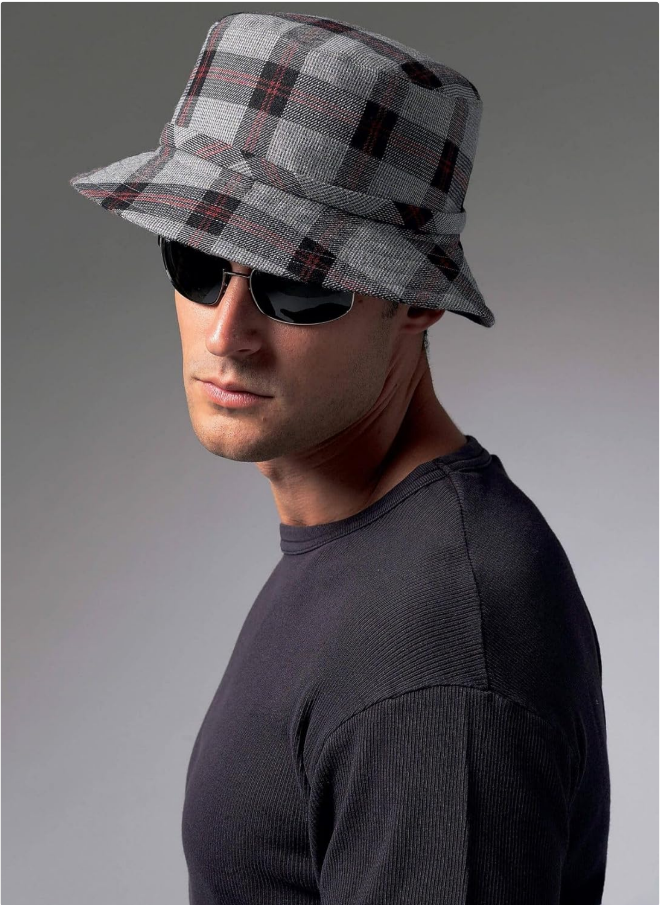
Image: A man wearing Hat Style C, a plaid bucket hat, viewed from the side.