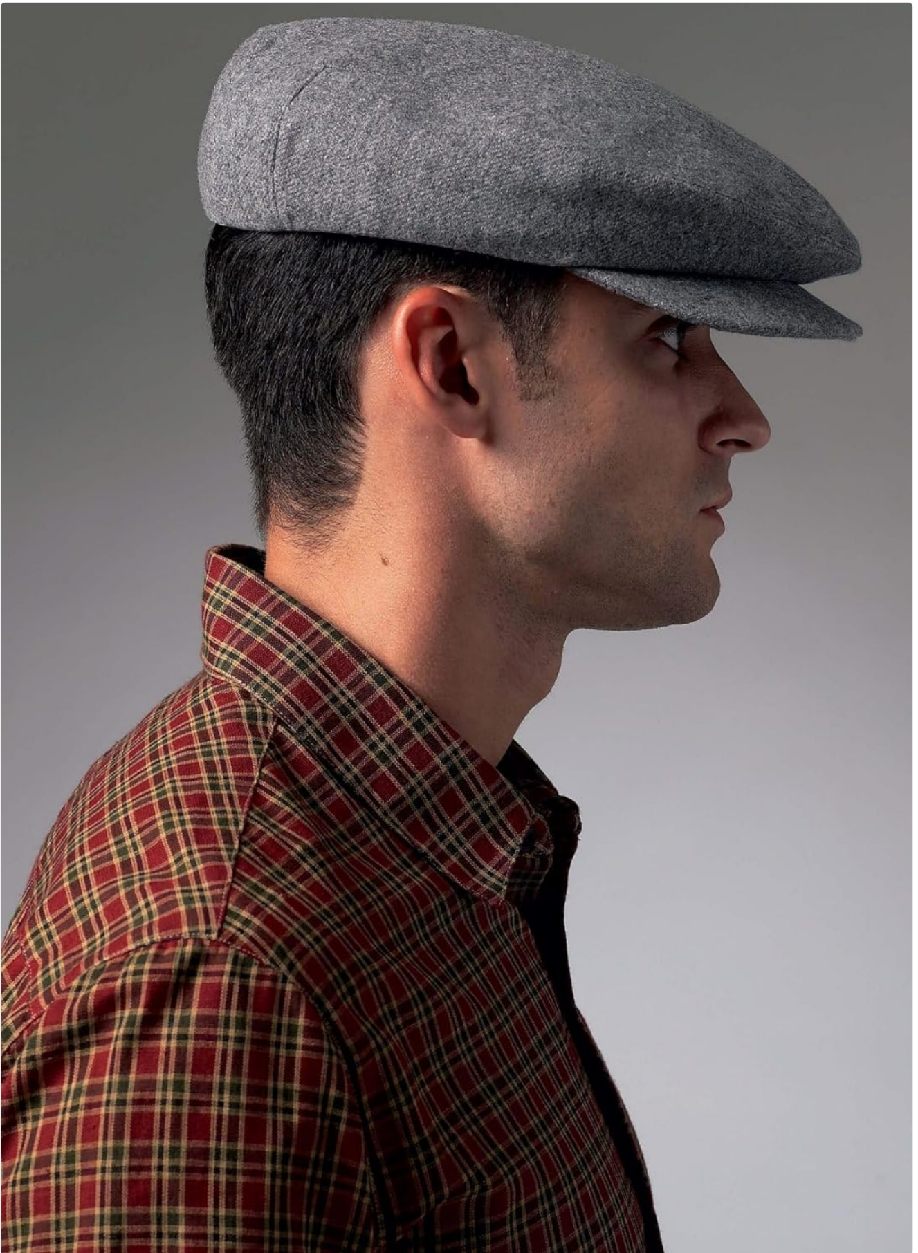
Image: A man wearing Hat Style A, a grey flat cap, viewed from the side.