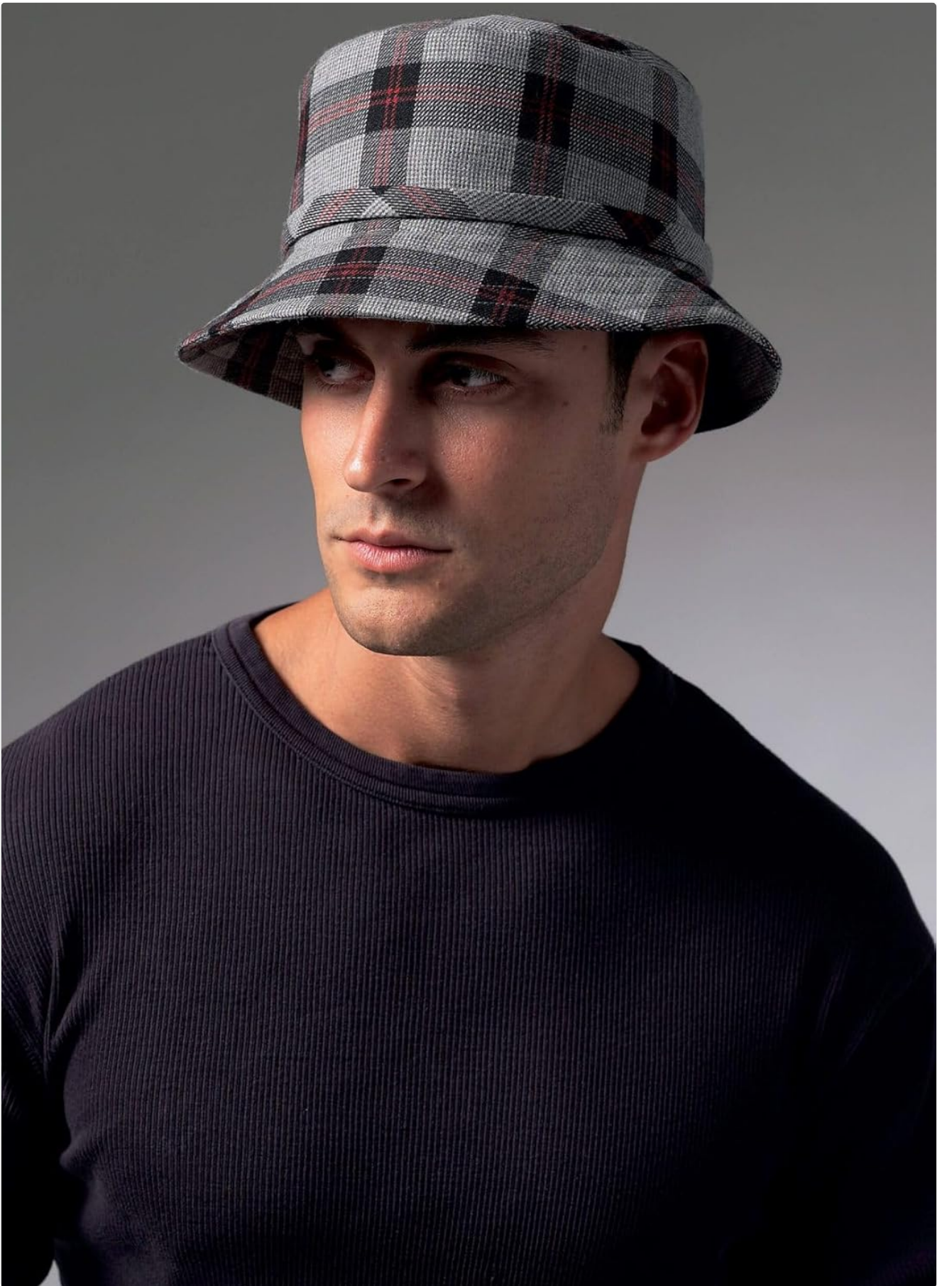
Image: A man wearing Hat Style C, a plaid bucket hat, viewed from the front.