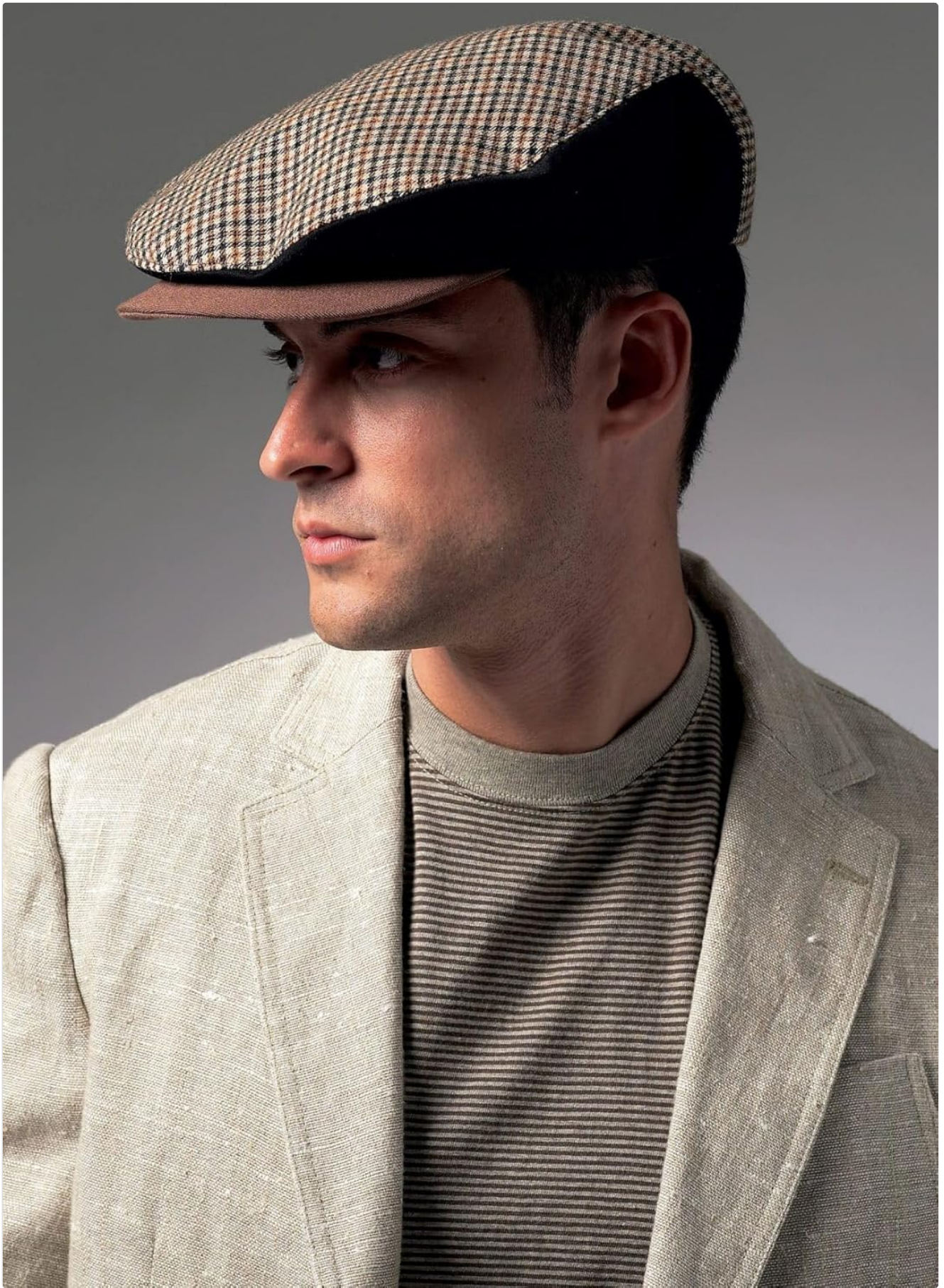
Image: A man wearing Hat Style B, a plaid and solid brown flat cap, viewed from the front.