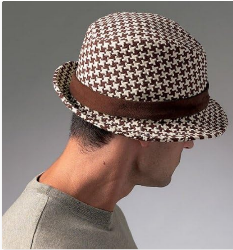
Image: A man wearing Hat Style D, a brown and white houndstooth patterned hat with a brown band.