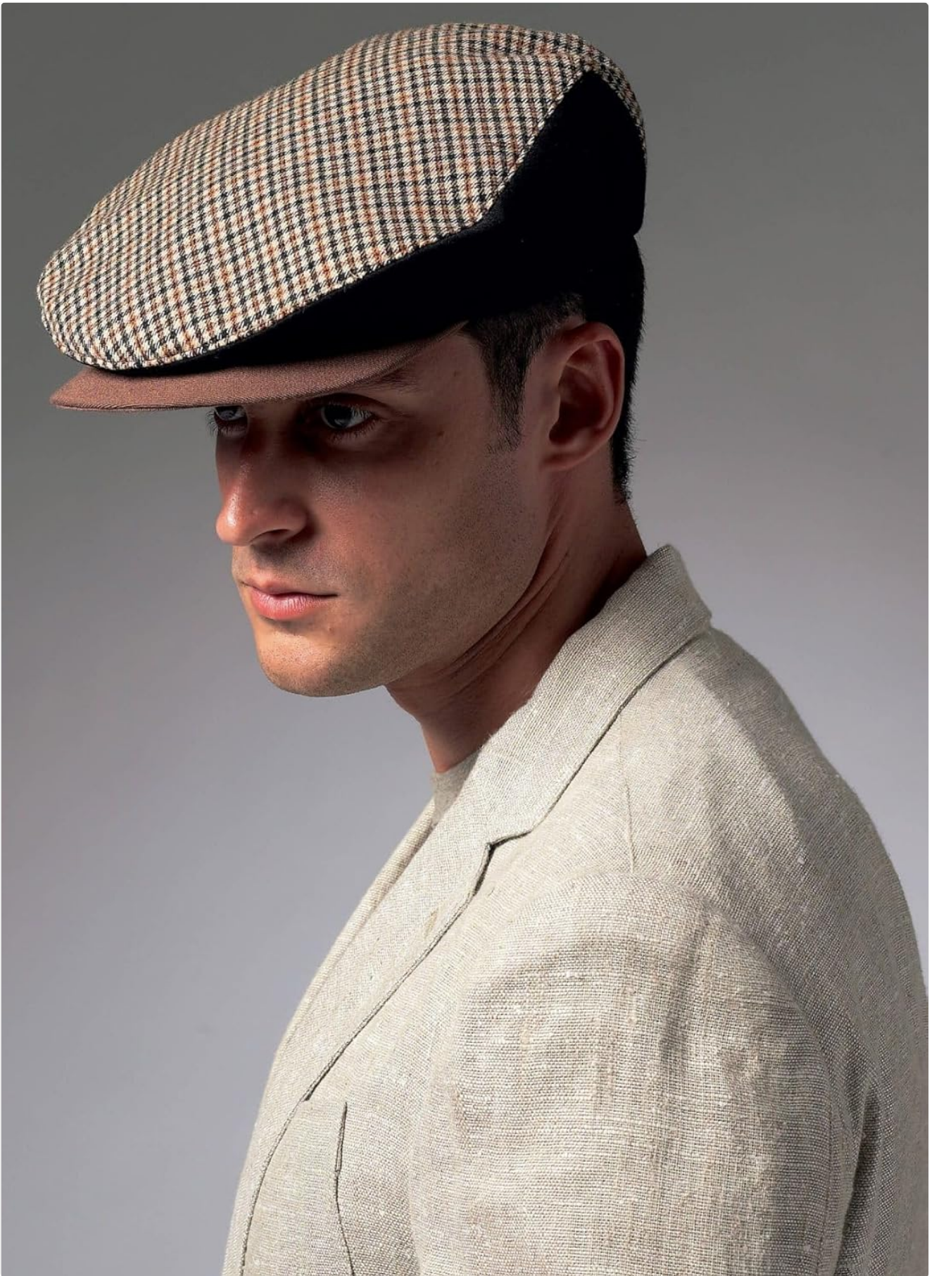
Image: A man wearing Hat Style B, a plaid and solid brown flat cap, viewed from the side.