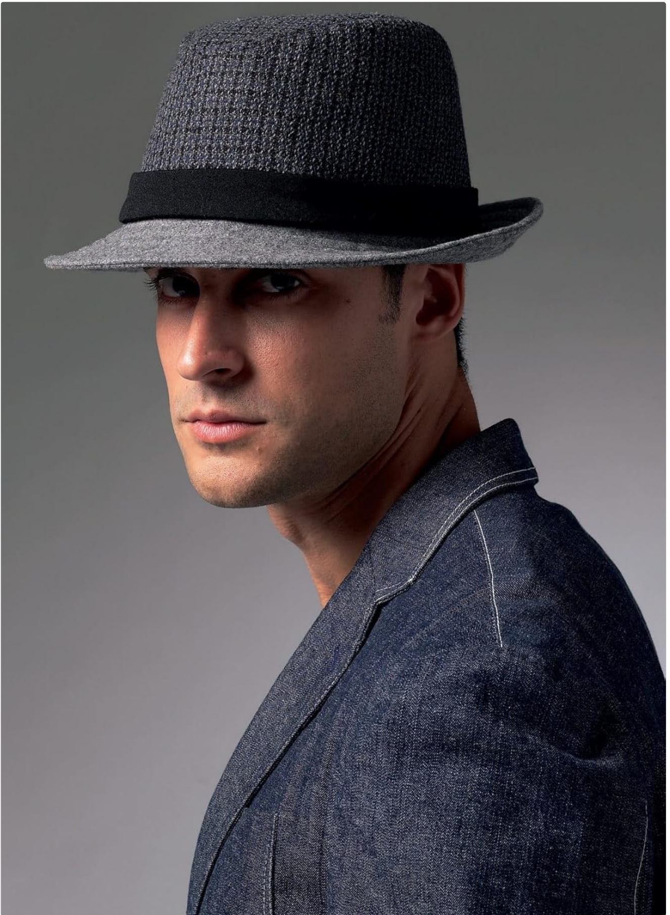
Image: A man wearing Hat Style E, a grey textured hat with a black band and lighter grey brim, viewed from the front.