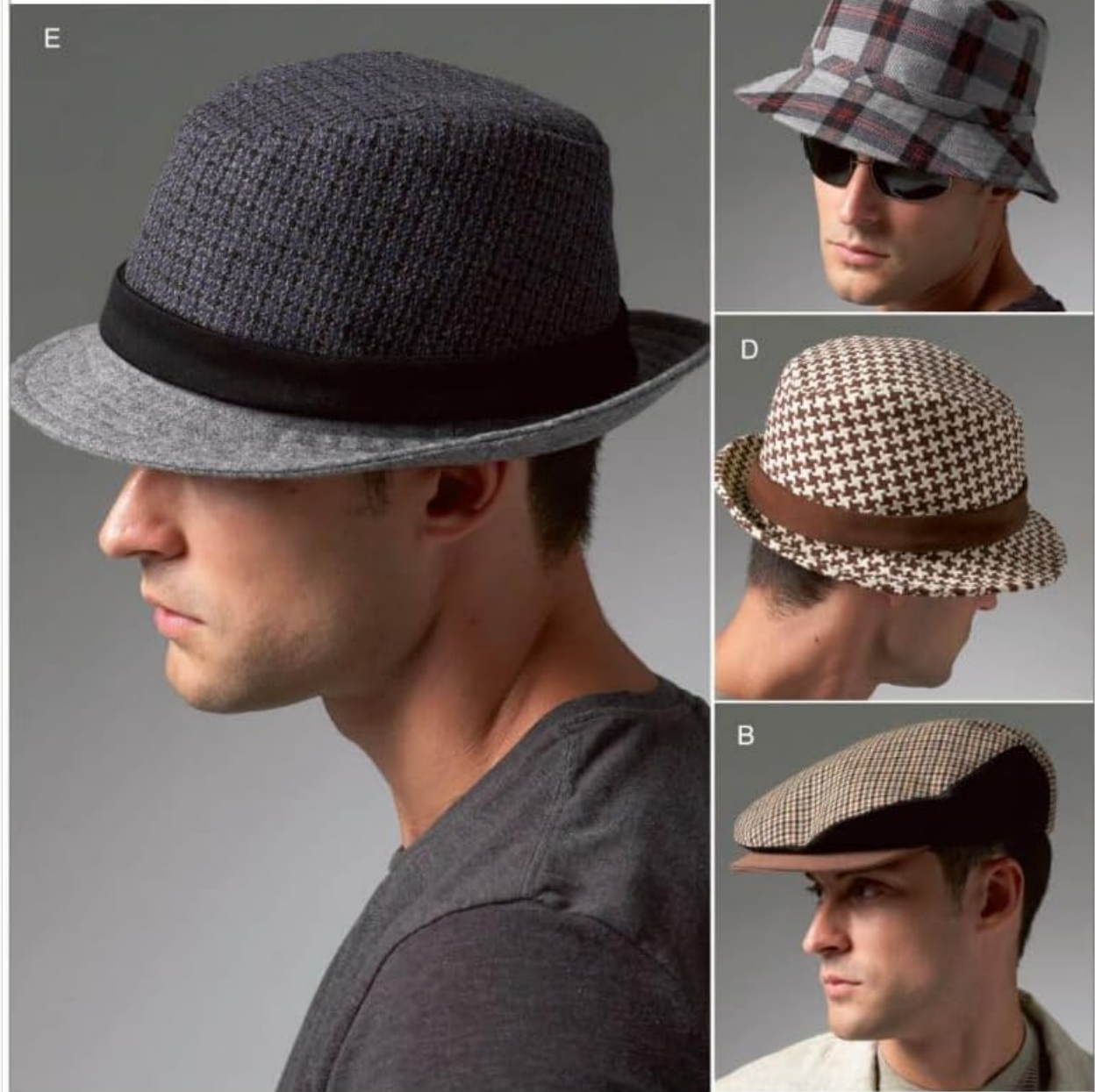
Image: Front of the Vogue Patterns V8869 envelope, displaying the five men's hat styles (A, B, C, D, E) that can be created with this sewing template.