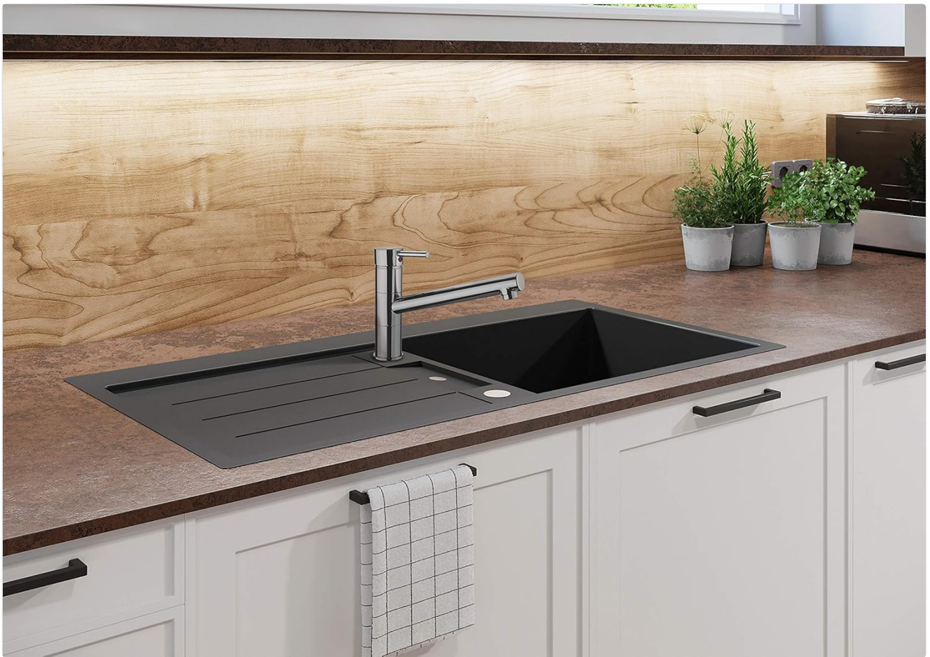
Image: The CORNAT ZELINA SLM faucet installed in a modern kitchen setting, demonstrating its functional design.