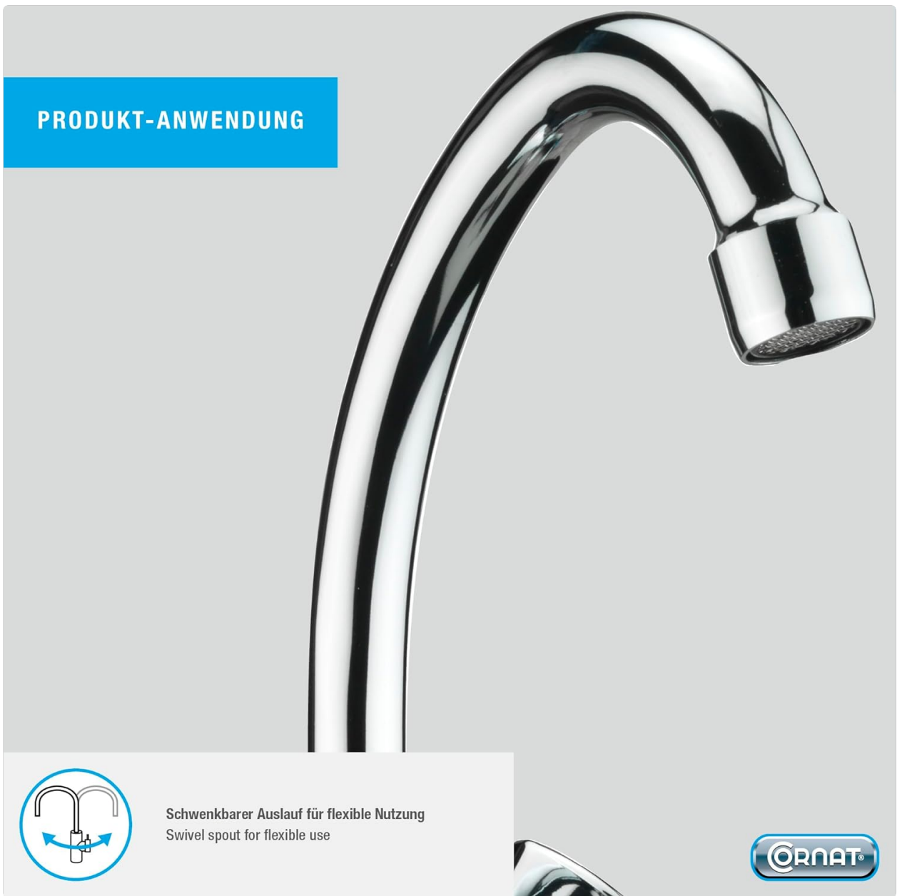
Figure 4: Close-up of the swivel spout, highlighting its flexible use.