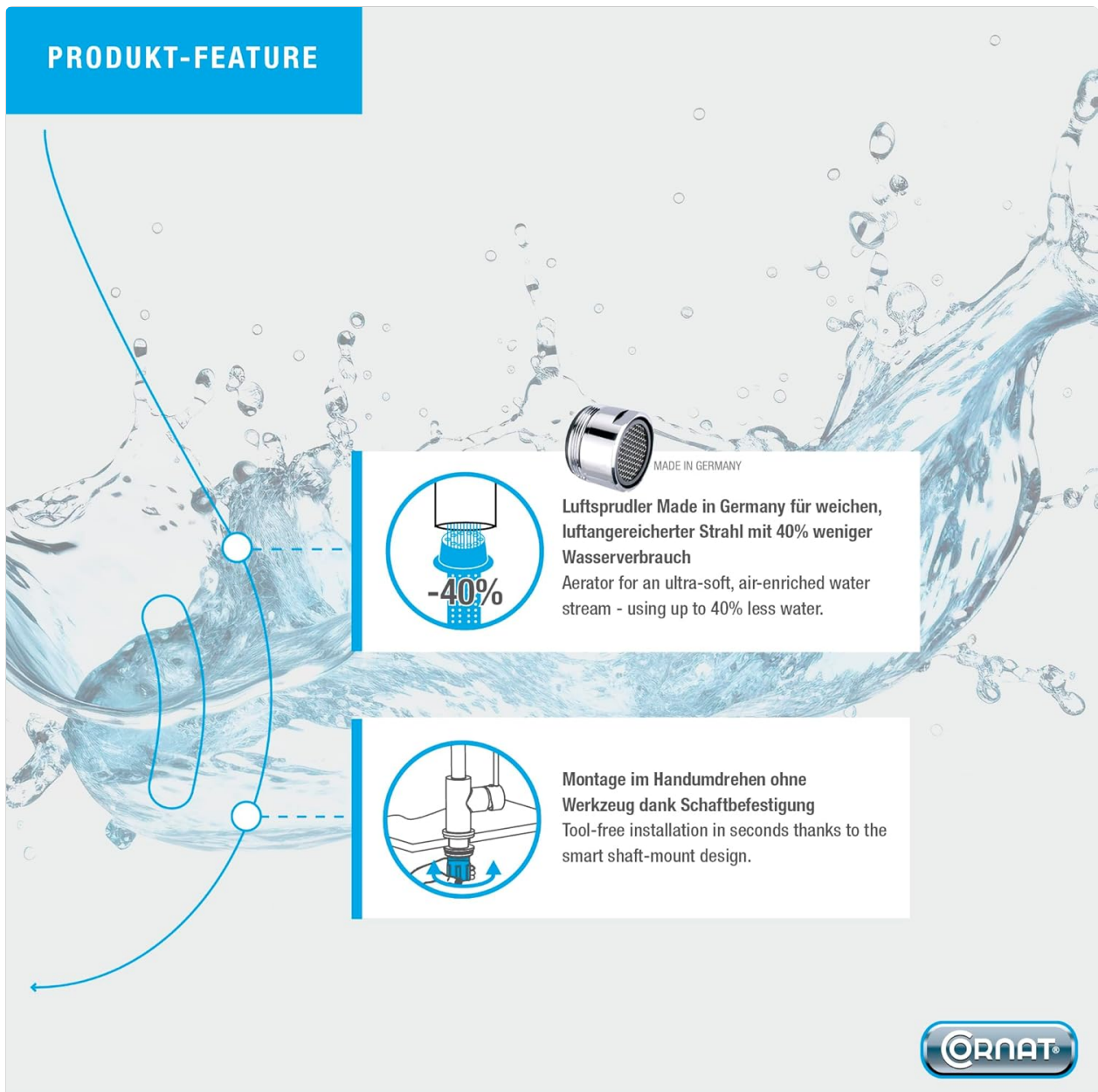
Figure 3: Diagram illustrating the aerator and smart-mount installation feature.