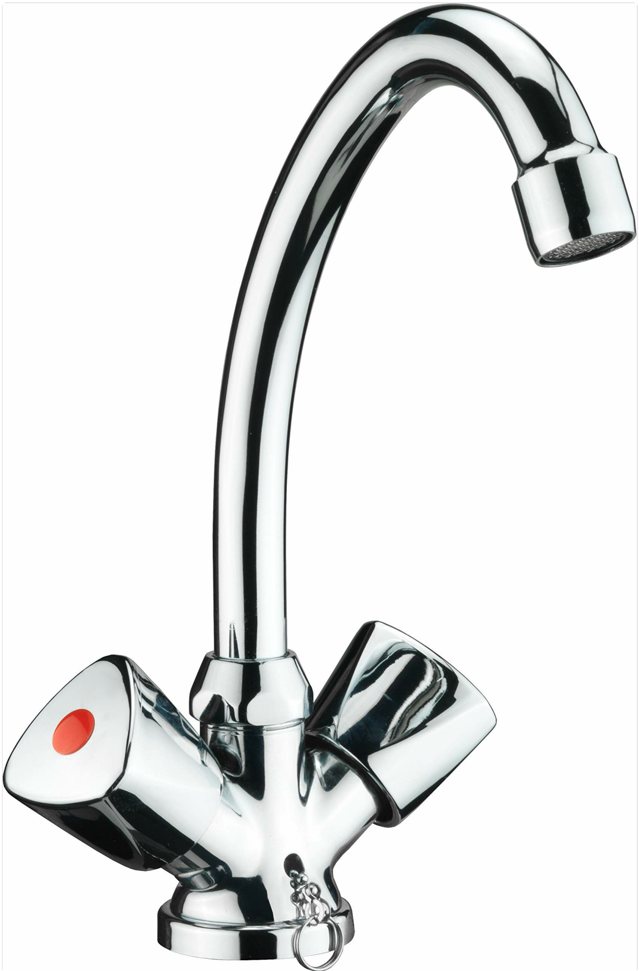
Figure 1: CORNAT LI113 Lisa 2-Grip Washbasin Mixer, overall view.