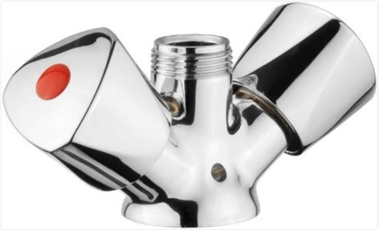
Figure 5: Product dimensions (in mm) for the CORNAT LI113 washbasin mixer.