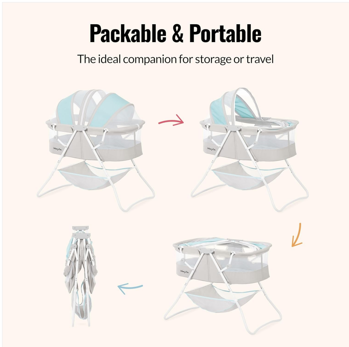
Figure 2: Visual guide for folding the bassinet for portability.

Description: This image illustrates the step-by-step process of folding the Karley Bassinet. It shows the bassinet in its open state, then partially folded, and finally in its compact, folded configuration, highlighting its packable and portable design.