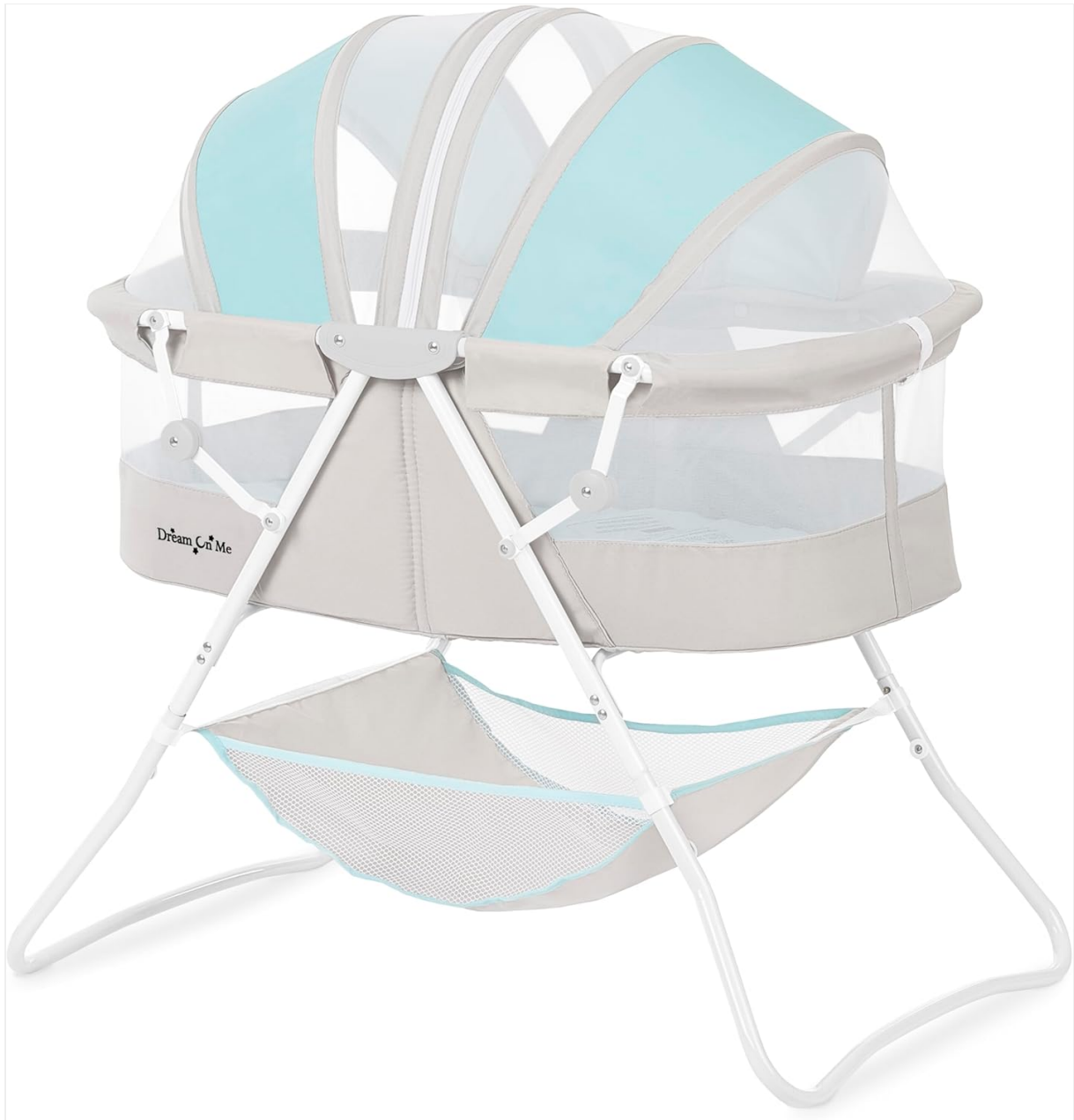
Figure 1: Fully assembled Dream On Me Karley Bassinet.

Description: This image shows the Dream On Me Karley Bassinet in its fully assembled state. The bassinet features a light grey fabric body with a blue and grey adjustable double canopy. It has a white aluminum frame and a mesh storage basket underneath. The overall design is lightweight and portable.