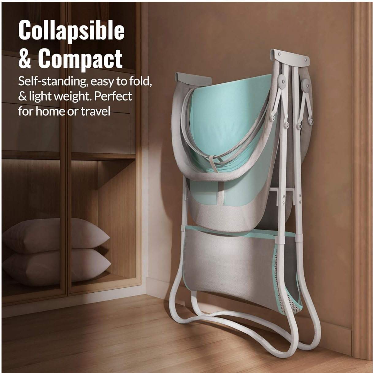
Figure 3: The bassinet in its compact, self-standing folded position.

Self-standing, easy to fold, & light weight. Perfect for home or travel