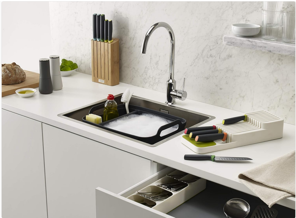
Image 3: The Wash & Drain Dish Tub positioned within a kitchen sink for use.