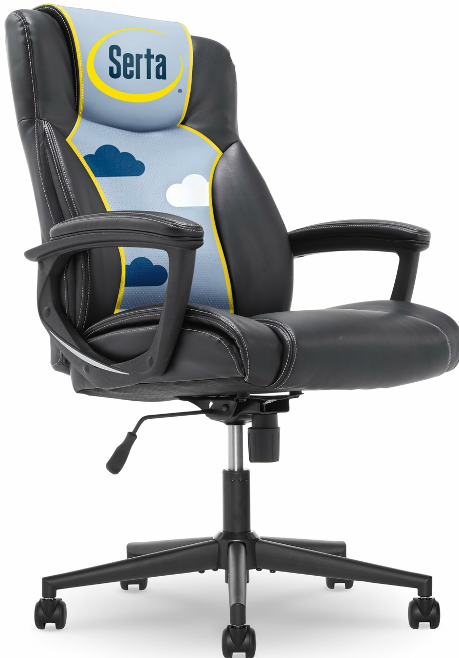
Figure 1: Serta Connor Executive Office Chair, front view.