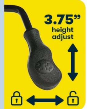
Figure 3: Overview of chair adjustment mechanisms.