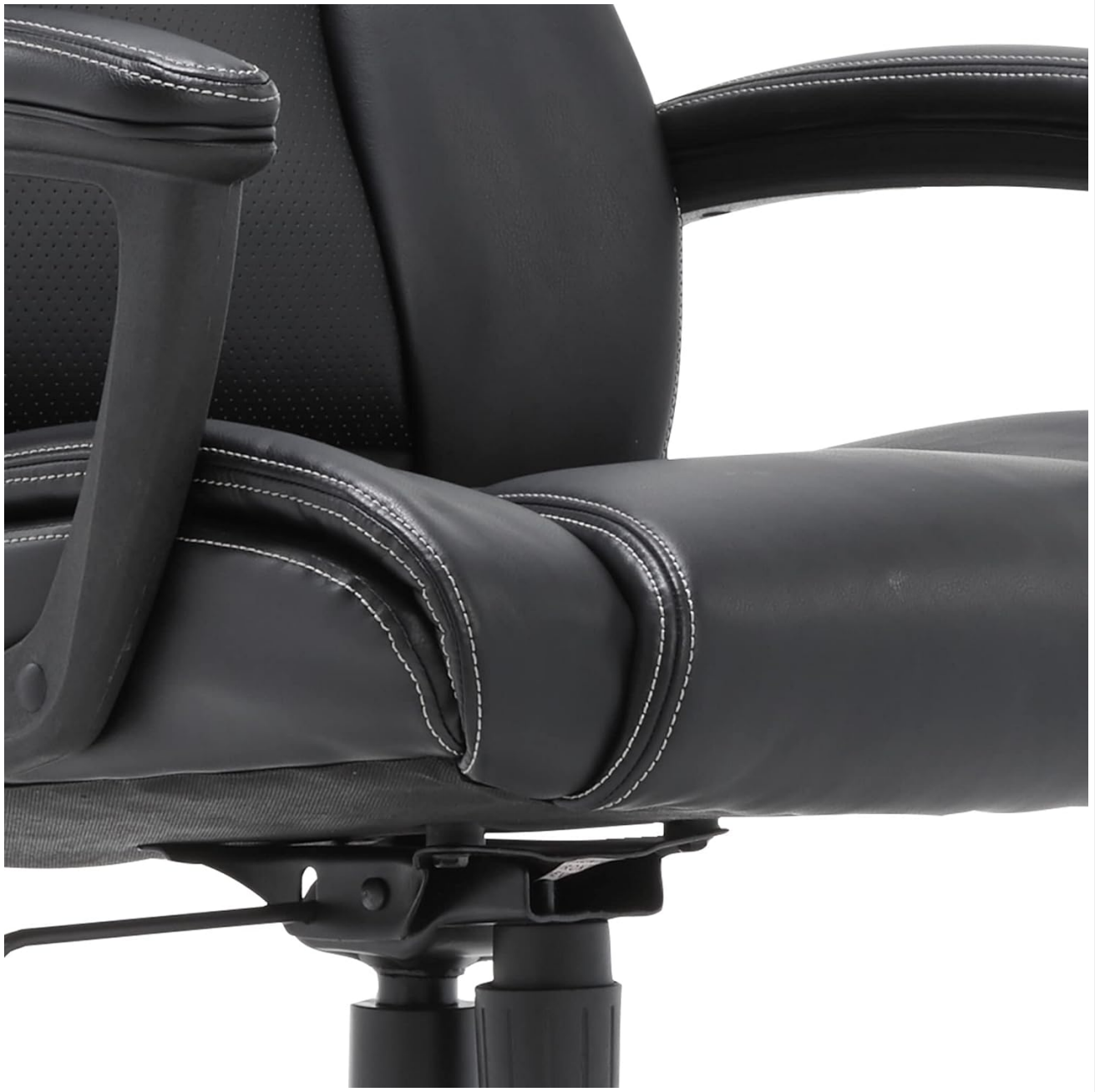
Figure 5: Tilt tension adjustment knob.