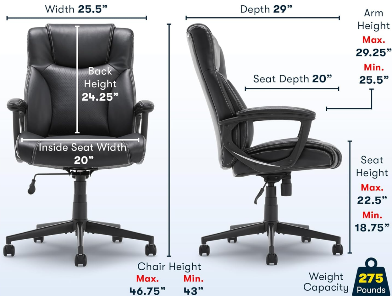
Figure 6: Detailed product dimensions.