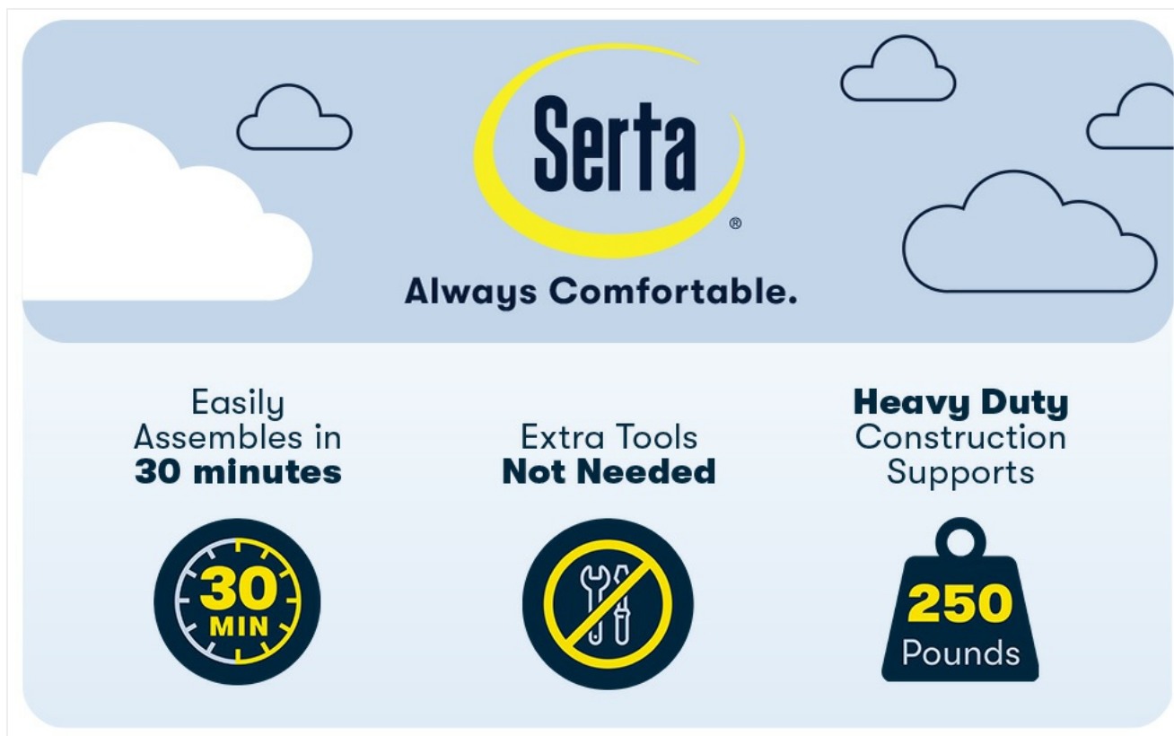
Figure 2: Assembly overview, highlighting ease of assembly and weight capacity.