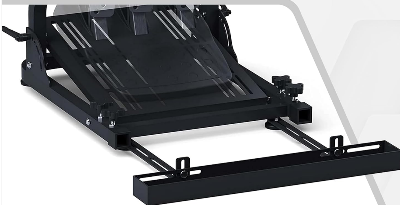
Image: Visual representation of the stand's adjustable components, such as the wheel bridge, left/right mountable shifter, and included chair link.

Realizzato in acciaio resistente, questo supporto elimina la flessione durante il gioco e rimane saldamente in posizione anche durante le gare più intense.