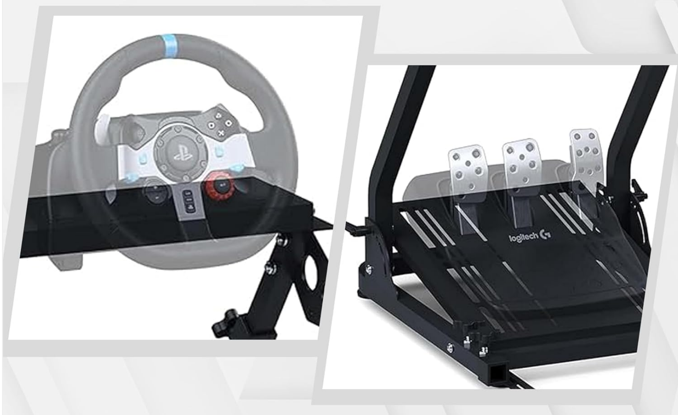
Image: Detail showing the mounting points for a racing wheel and pedals, highlighting broad compatibility.

Compatibile con tutti i principali volanti e pedali, inclusi Logitech G29/G920, Thrustmaster T300/TMX, Fanatec CSL/DD e altro ancora.