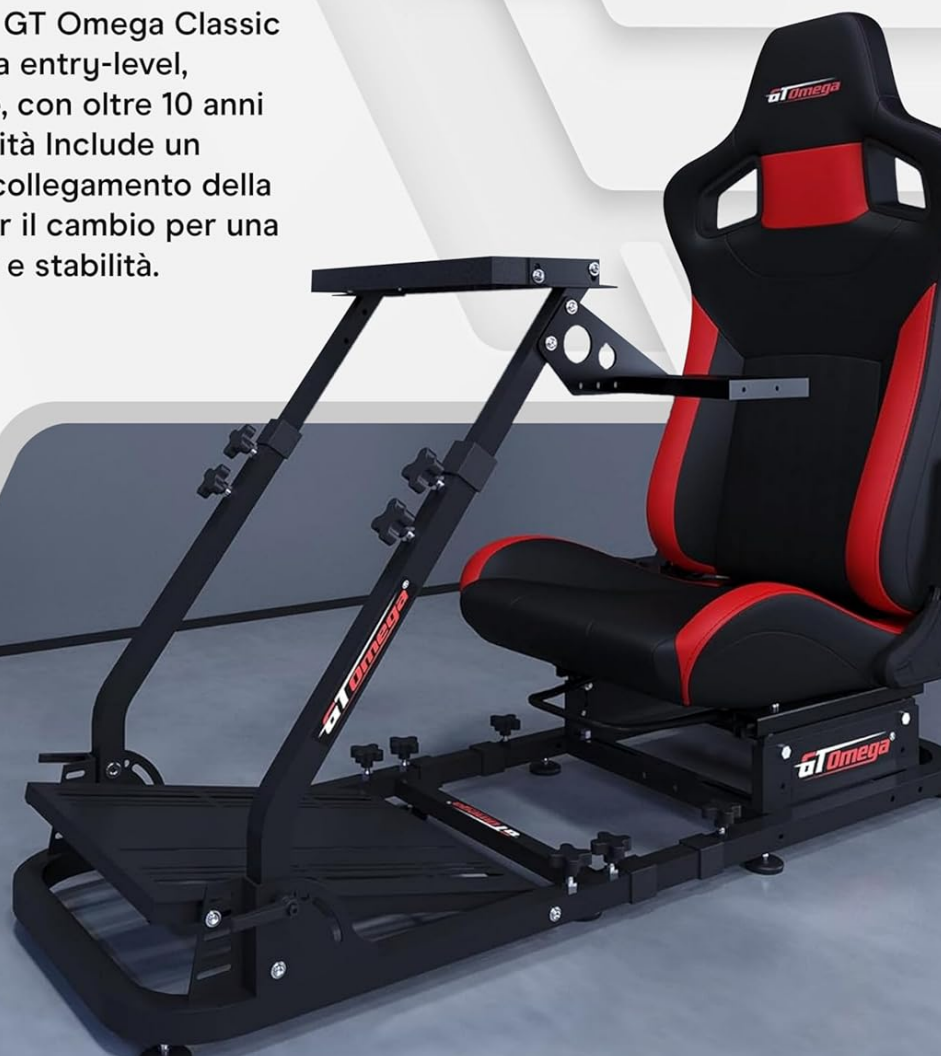
Image: The GT OMEGA Classic Steering Wheel Stand with the included chair link, designed to prevent chair movement during use.

Il supporto per volante GT Omega Classic è un simulatore di guida entry-level, resistente e pieghevole, con oltre 10 anni di comprovata affidabilità. Include un attacco gratuito per il collegamento della sedia e un supporto per il cambio per una maggiore compatibilità e stabilità.