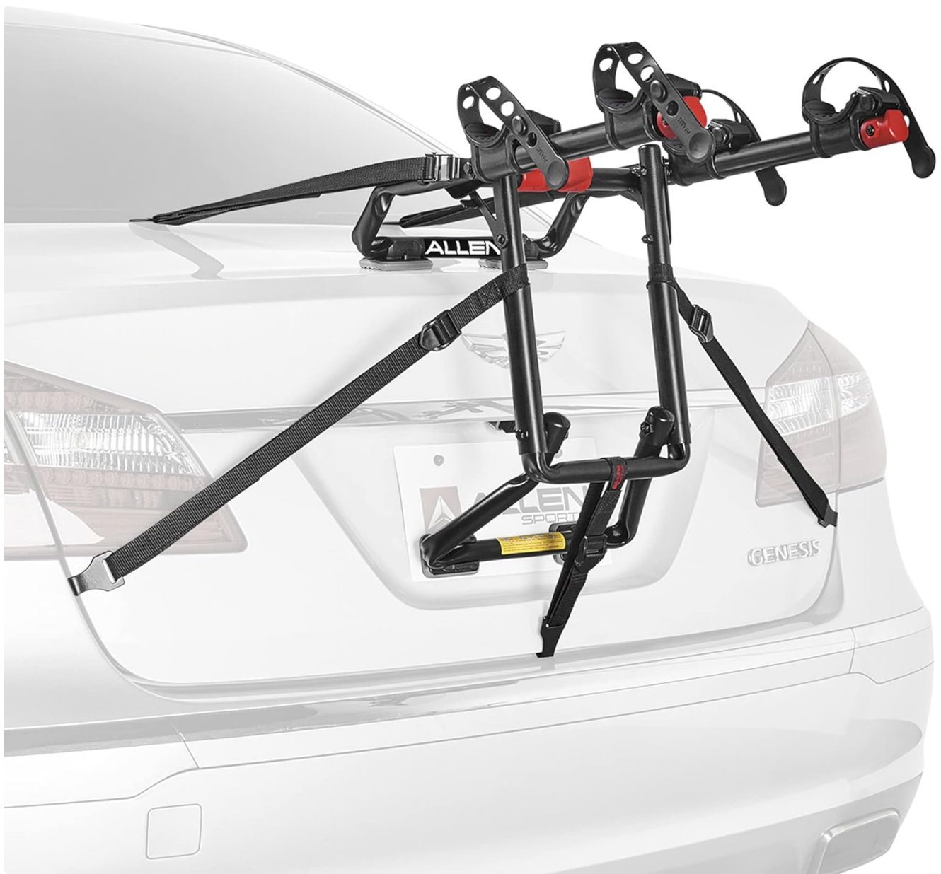
Image: Allen Sports Premier 2-Bike Trunk Rack securely mounted on the trunk of a white sedan, ready for bicycle transport.