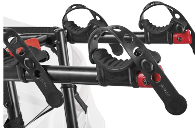
Close-up of bike frame secured by cradles.