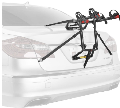
Rack mounted on vehicle, side view.