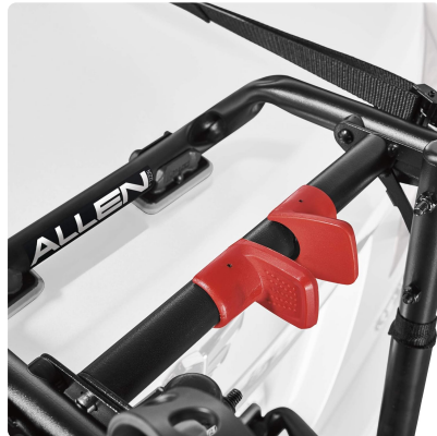
Close-up of rack's protective pads.