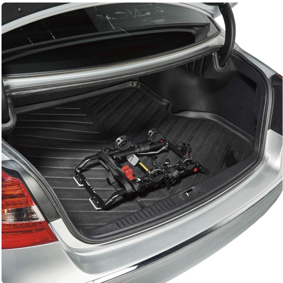
Rack folded for compact storage in a car trunk.