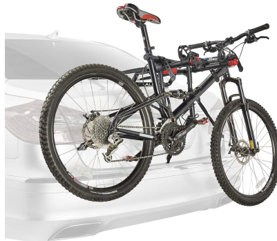
Mountain bike loaded on the rack.