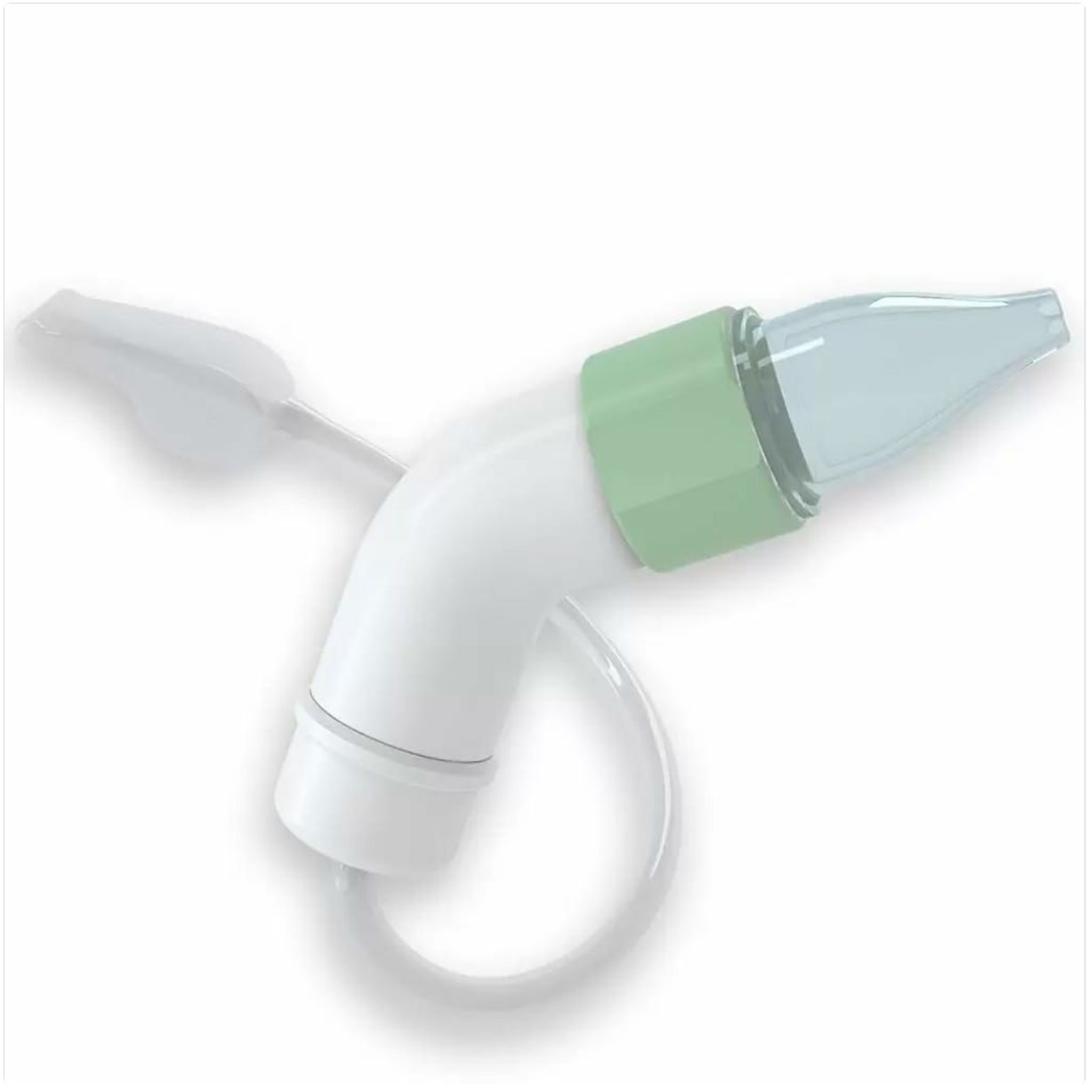
Image 1.1: The Chicco Phisio Clean Nasal Aspirator, designed for gentle nasal clearing.