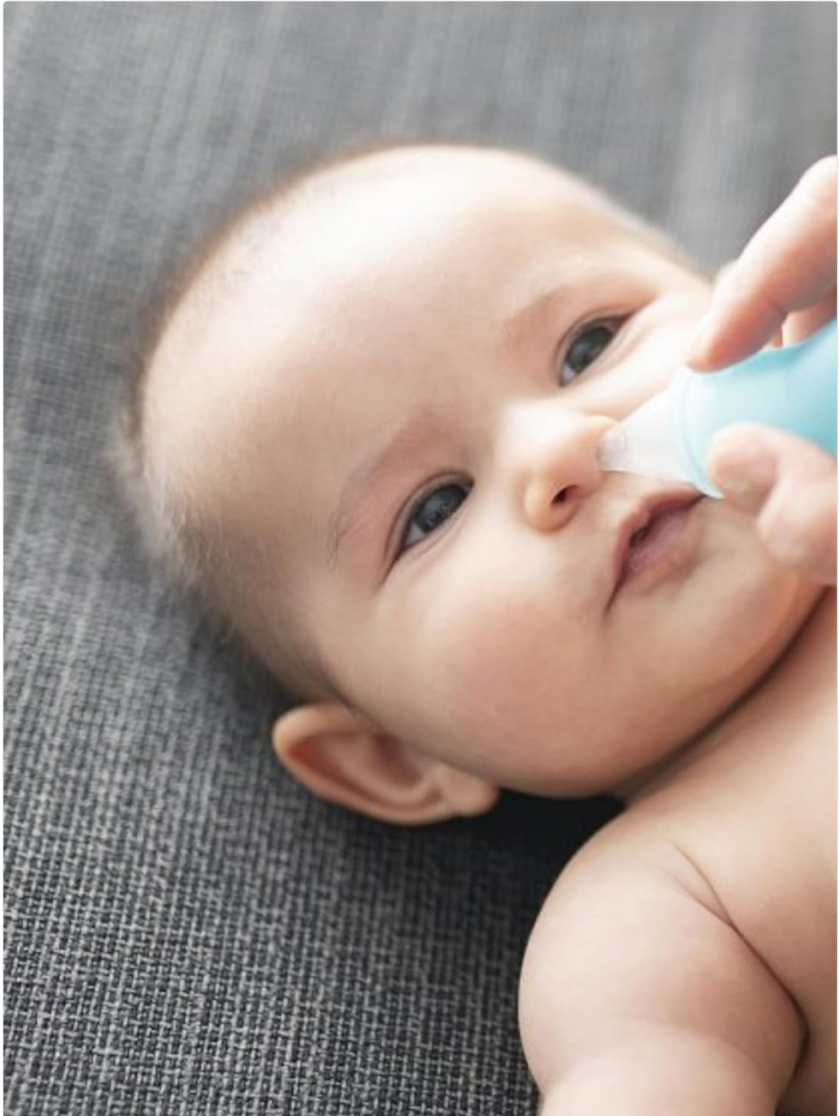
Image 5.1: Illustration of a parent using the nasal aspirator on an infant.