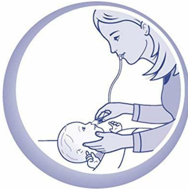
Image 5.2: A close-up view of the aspirator being used on a baby's nostril.