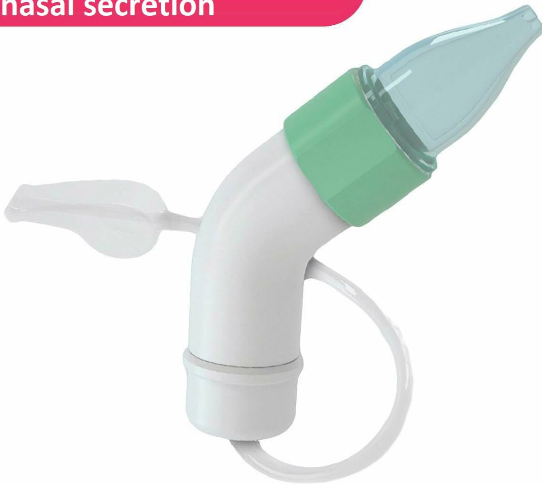
Image 1.2: The aspirator's function in eliminating excess nasal secretion.