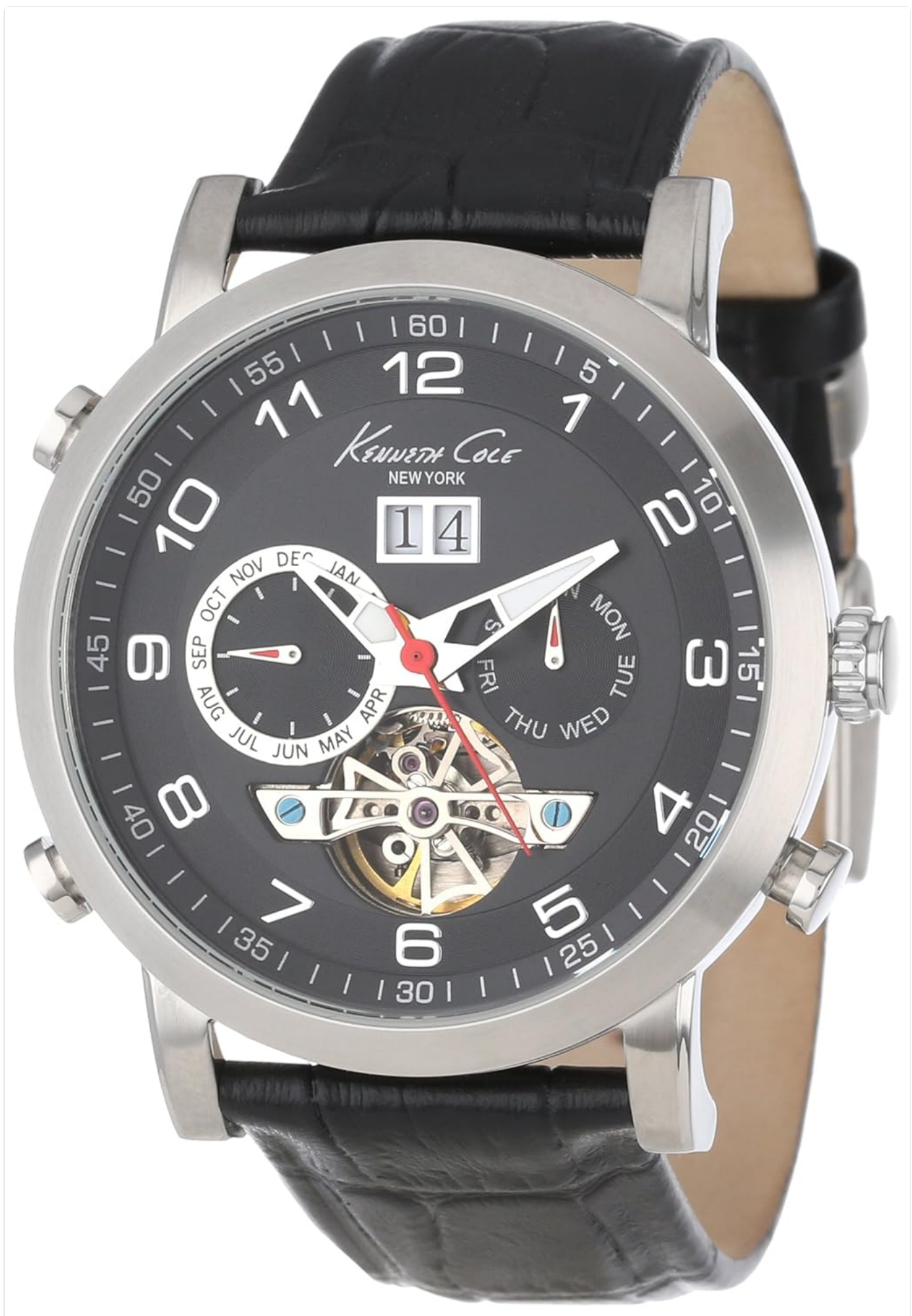
Figure 1: Front view of the Kenneth Cole Dress Sport Analog Black Dial Men's Watch KC1930, showcasing its black dial, silver-tone case,