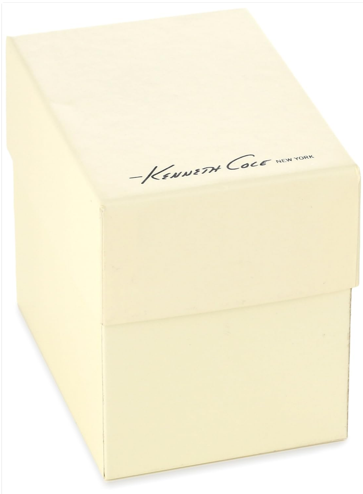
Figure 3: The Kenneth Cole watch packaging box, suitable for storage.