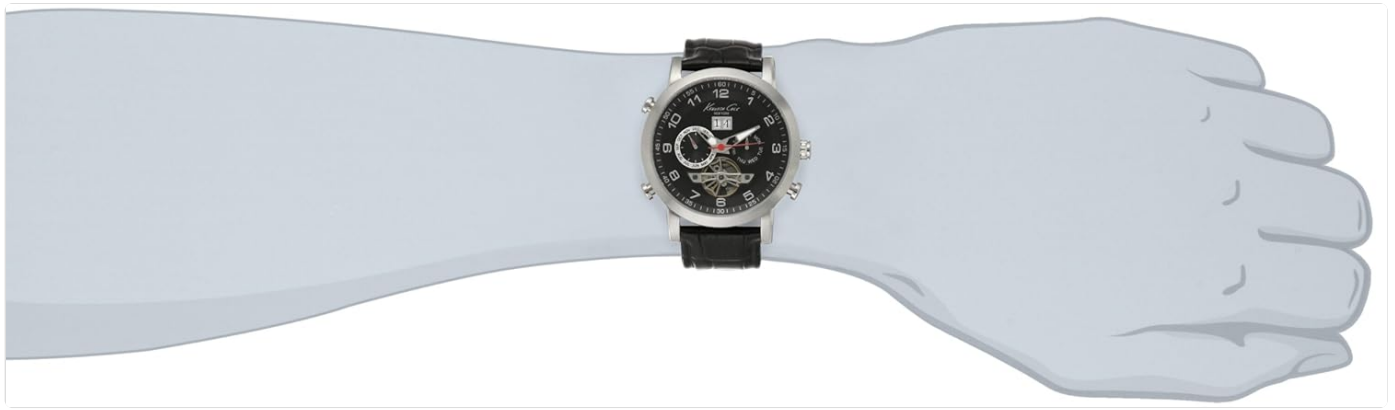
Figure 2: The Kenneth Cole watch displayed on a wrist, illustrating its size and fit.