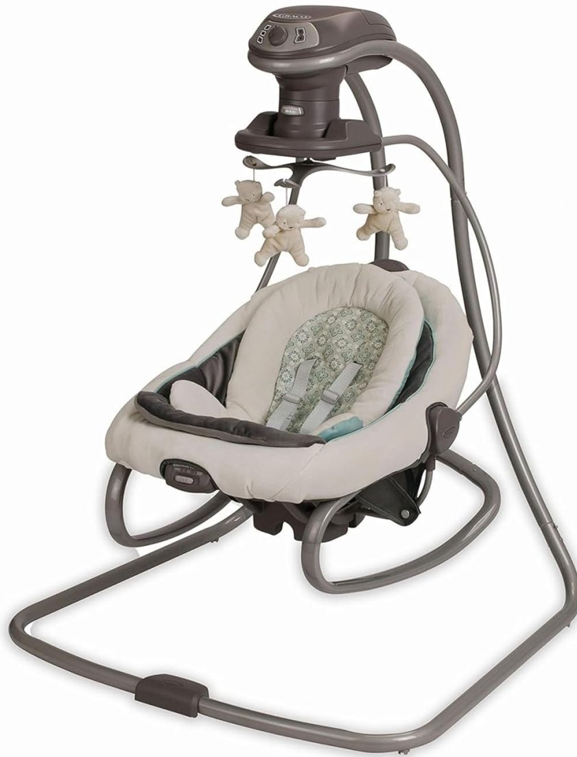
Figure 1: Overview of the Graco DuetSoothe Swing and Rocker.