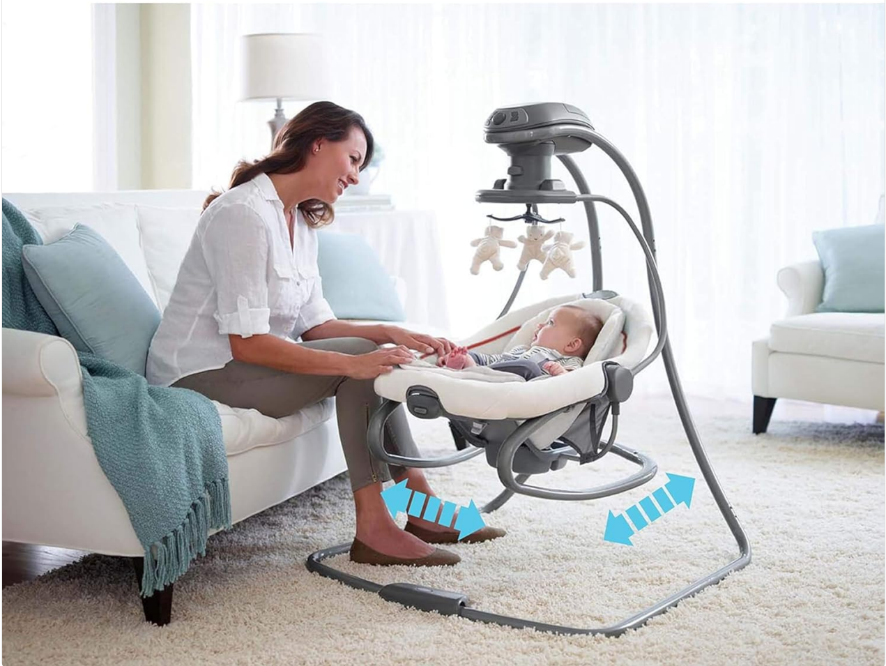
Figure 3: Illustrating the multi-directional swinging capability.