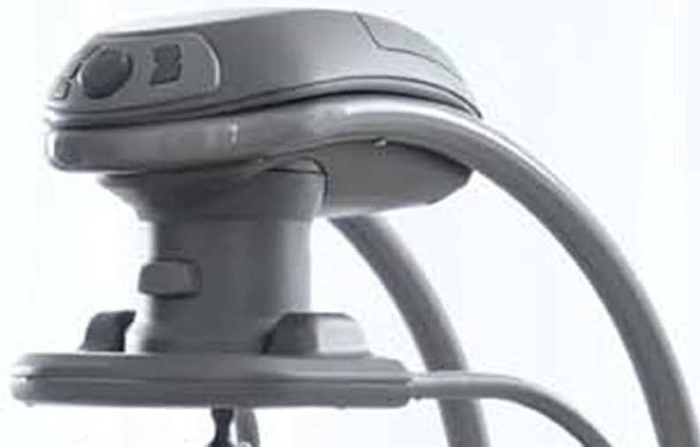
Figure 4: Overview of available soothing settings.