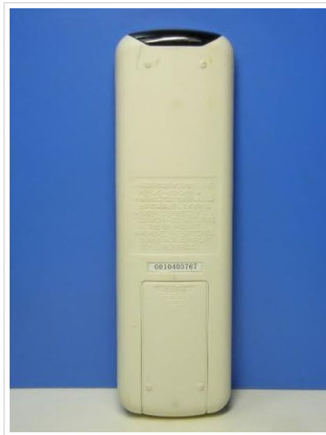
Figure 1: Back view of the remote control, highlighting the battery compartment.

Note: If the remote control is not used for an extended period, remove the batteries to prevent leakage and damage.