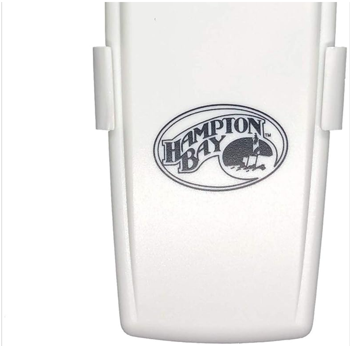
Figure 1: Hampton Bay UC7078T Remote Control with its distinct button layout.