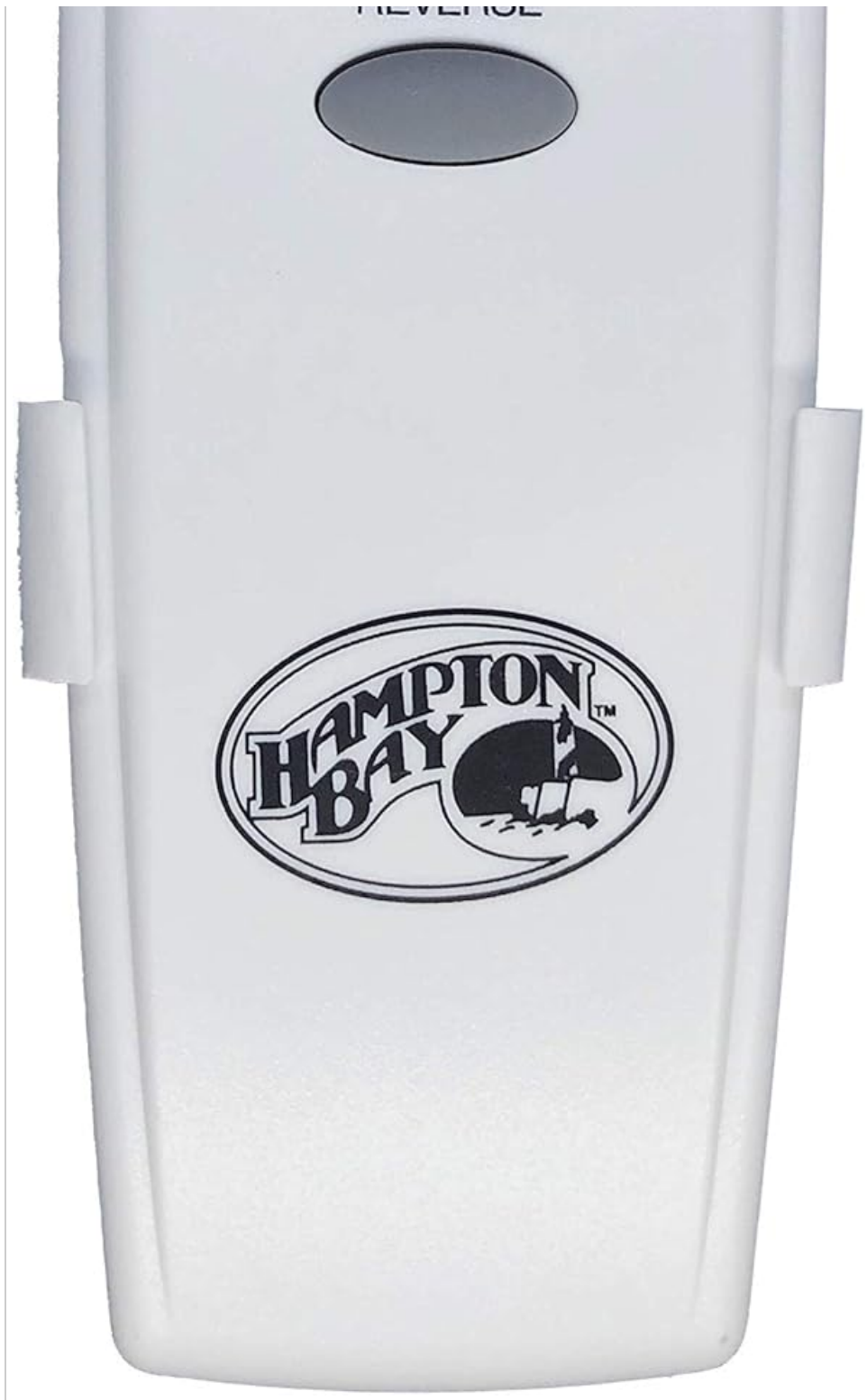
Figure 2: Hampton Bay UC7078T Remote Control securely placed in its included wall holder.

Your browser does not support the video tag.