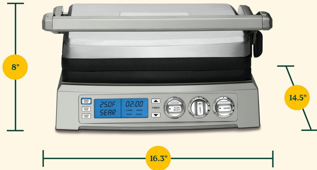
Figure 8.1: Product dimensions of the Griddler Elite.