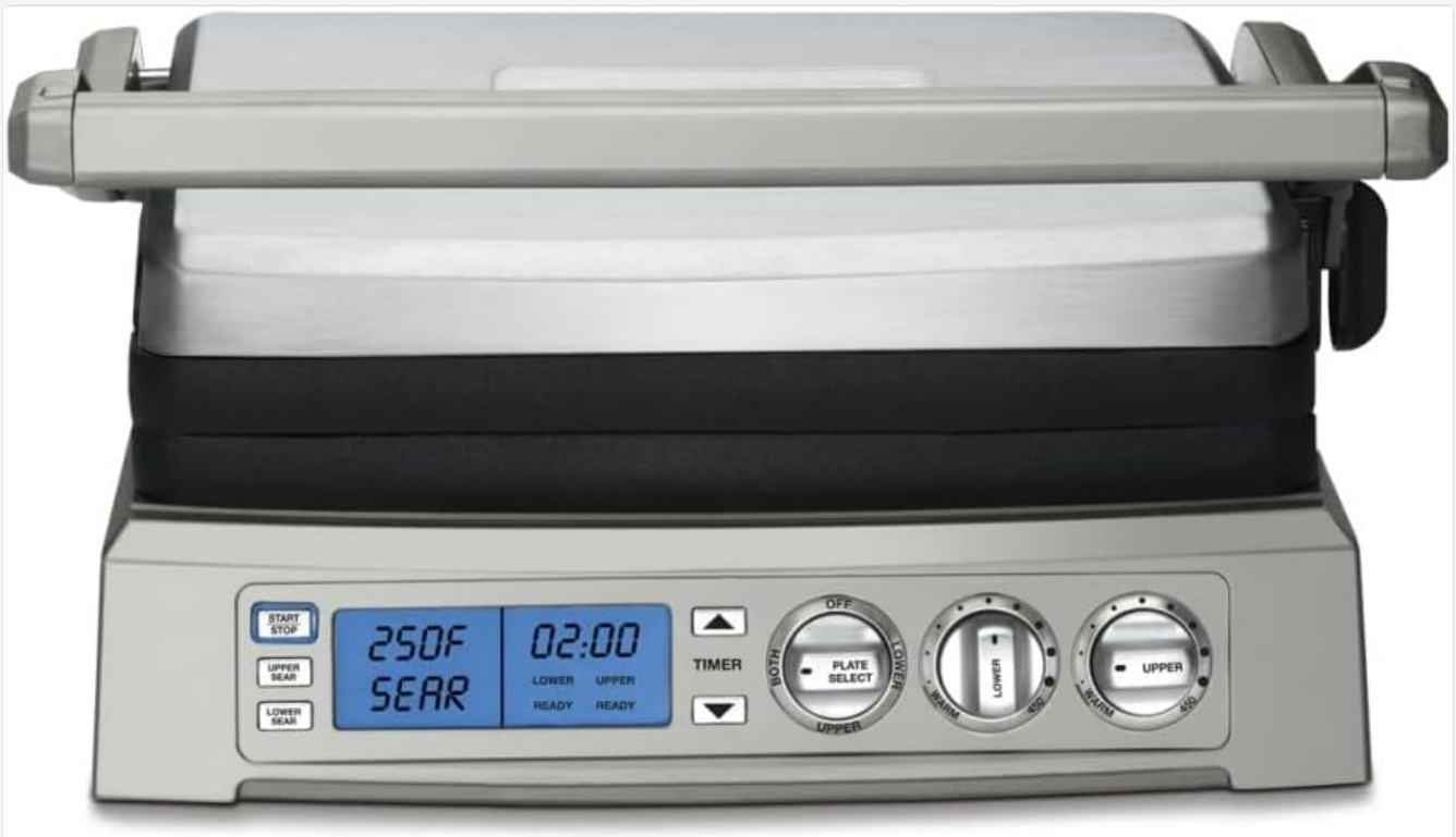
Figure 1.1: Cuisinart GR-300WSP1 Elite Griddler in closed position.

The Cuisinart GR-300WSP1 Elite Griddler is a versatile electric indoor grill designed to offer multiple cooking functions in one compact appliance. This manual provides detailed instructions for safe operation, maintenance, and troubleshooting to ensure optimal performance and longevity of your Griddler.