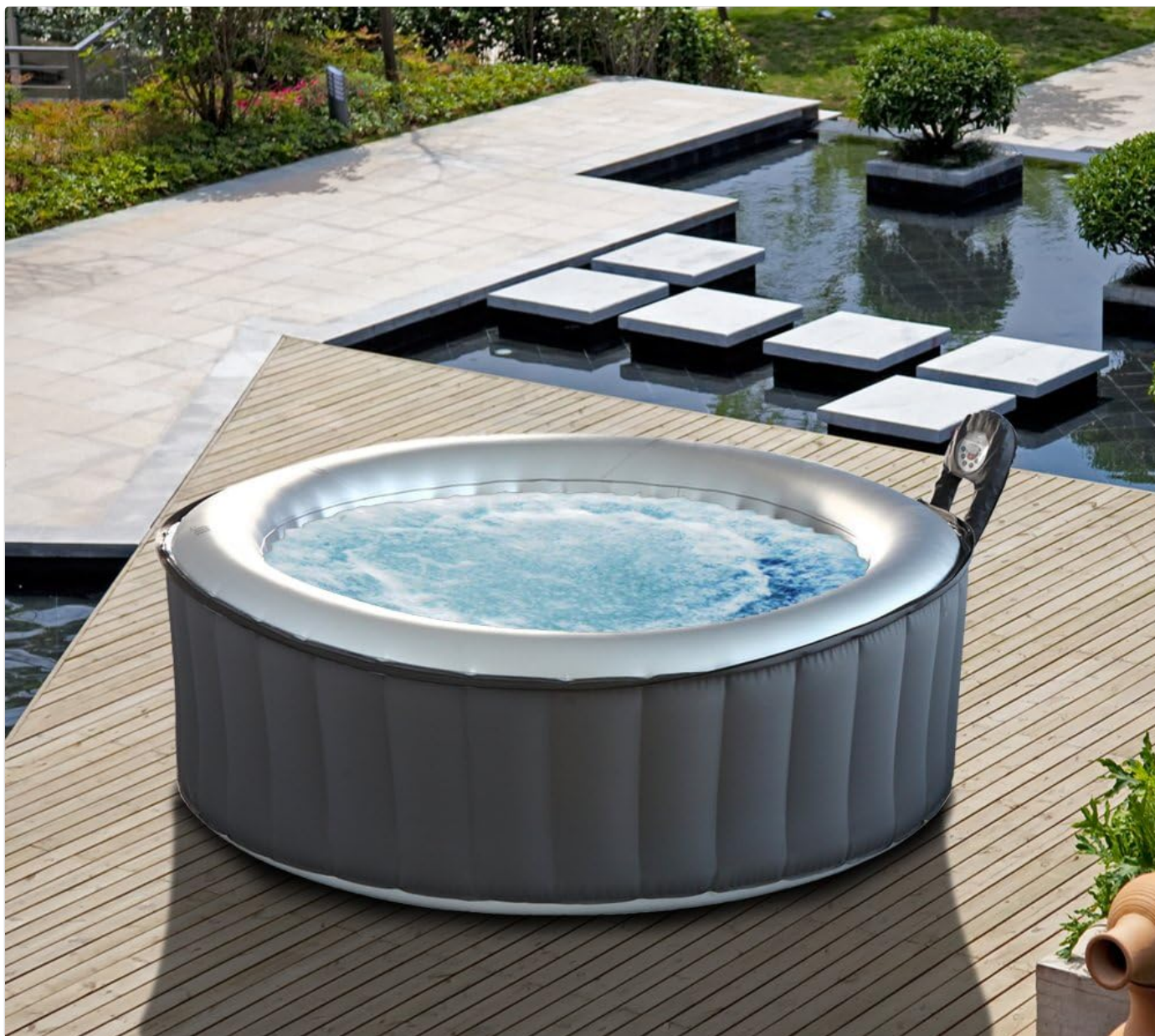
Image: The MSpa B-110 Silver Cloud Hot Tub in operation, filled with water and generating bubbles, positioned on an outdoor deck.