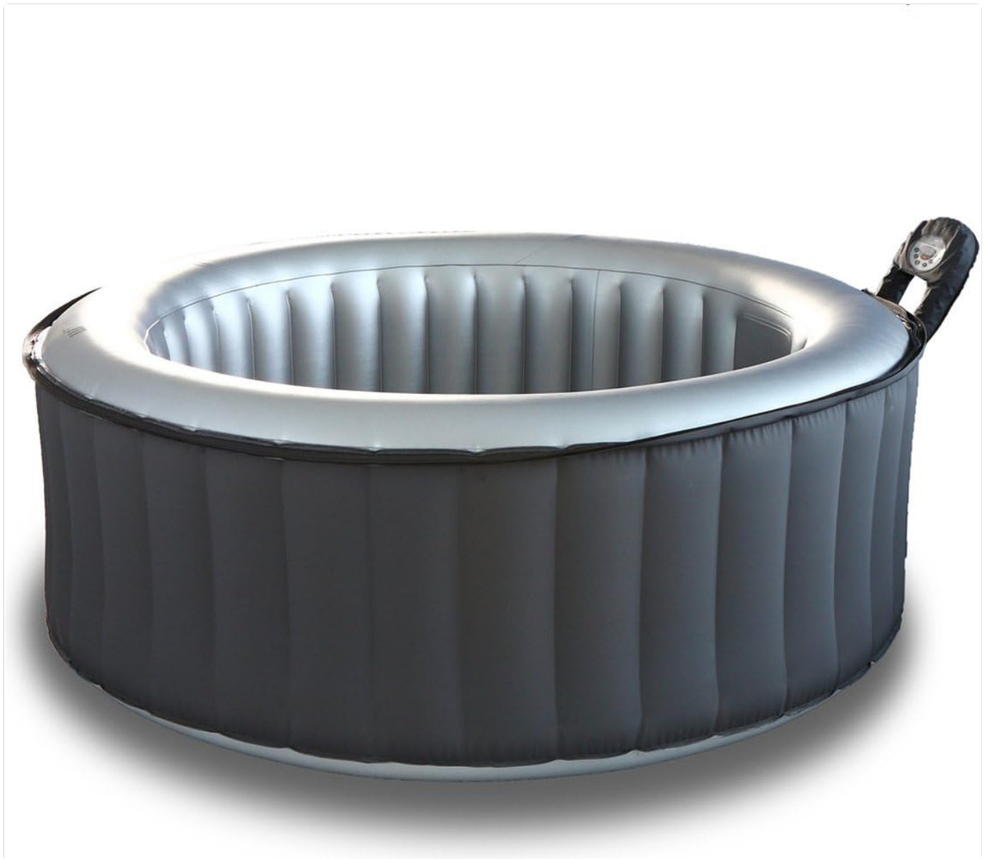
Image: The MSpa B-110 Silver Cloud Hot Tub, shown inflated and empty, illustrating its form factor before filling.