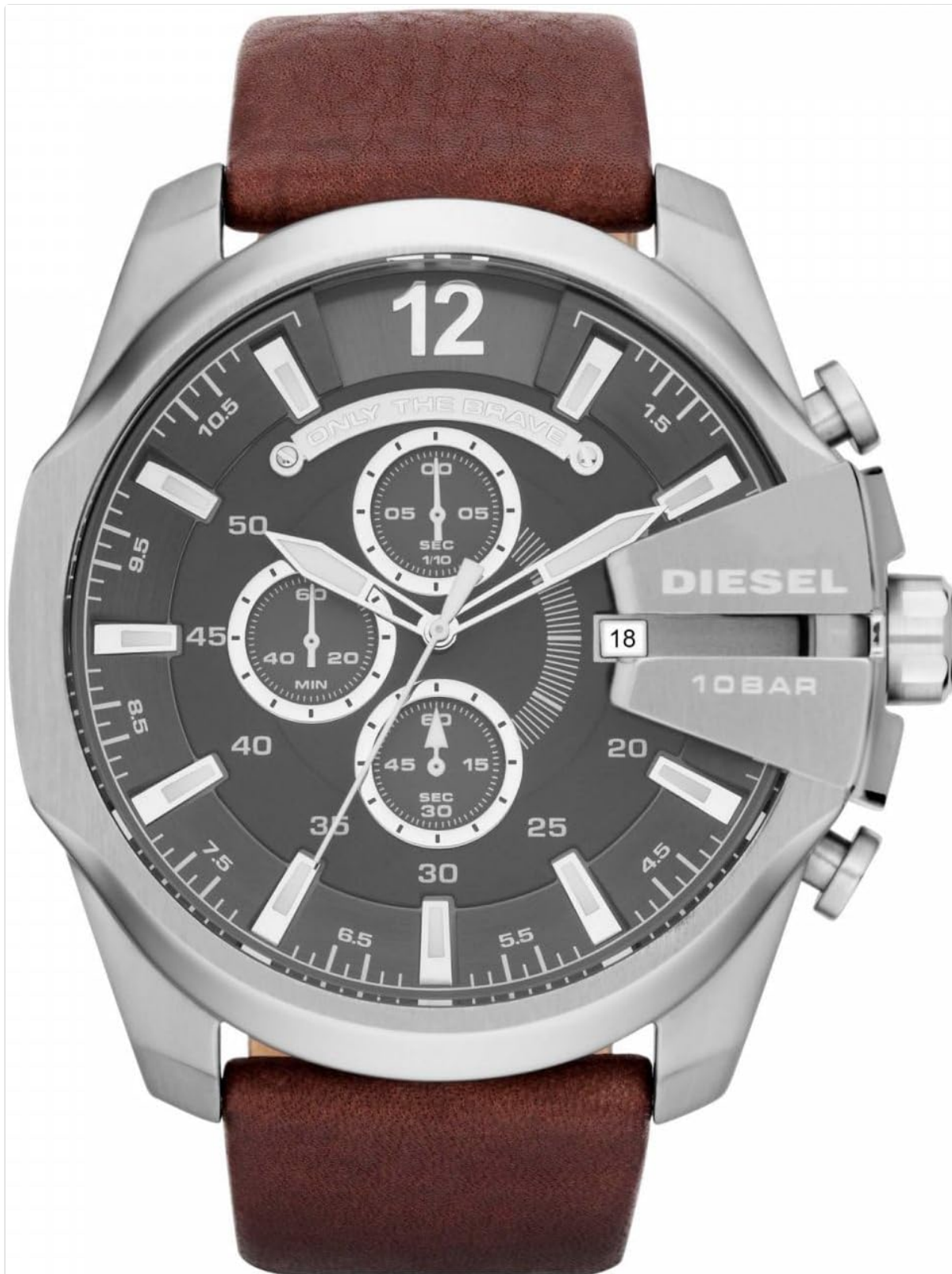
Image: Front view of the Diesel Mega Chief Chronograph Watch, featuring a dark grey dial with three sub-dials, silver-tone case, and a brown leather strap.