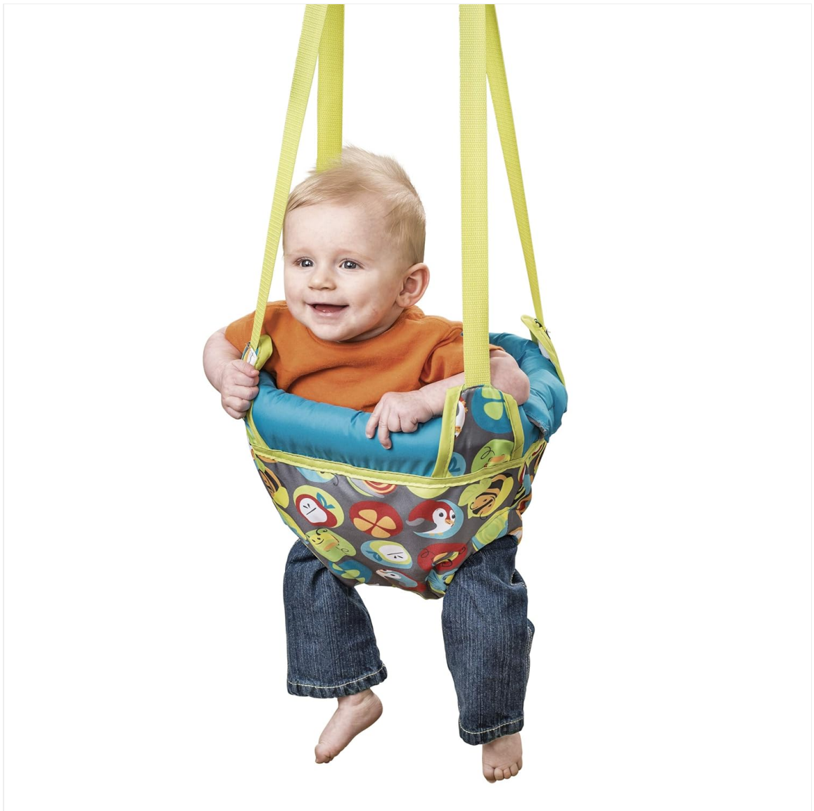
Image: A baby enjoying the Evenflo Exersaucer Johnny Jumper.