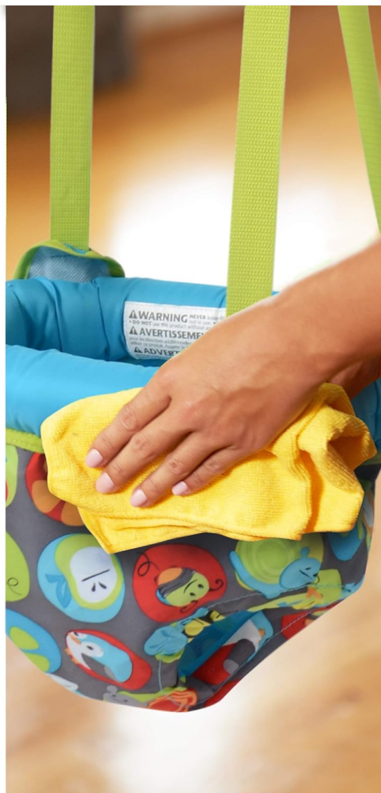
Image: The fabric seat is machine-washable, and other components can be wiped clean.