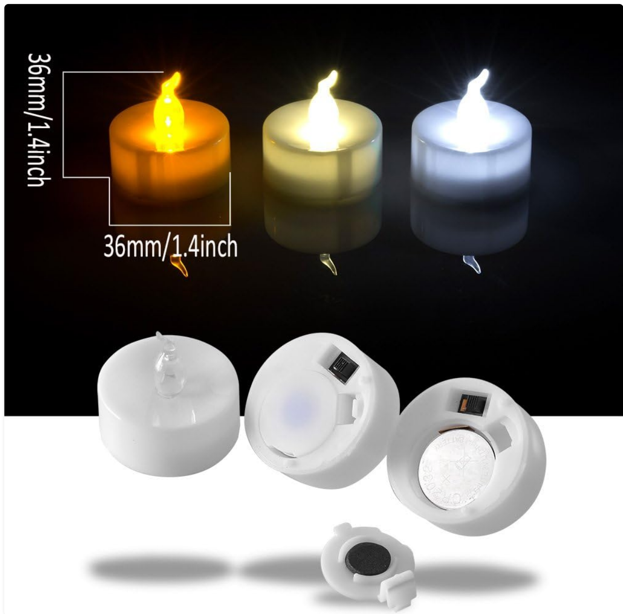
Detailed view of the AGPTEK LED tea light, illustrating its dimensions (36mm/1.4inch diameter and height) and the battery compartment with a CR2032 button cell for easy replacement.