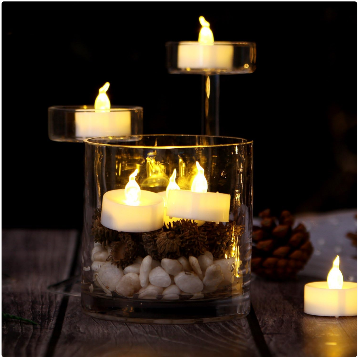
AGPTEK Flameless LED Tea Lights displayed in a glass holder with decorative elements, showcasing their warm glow.