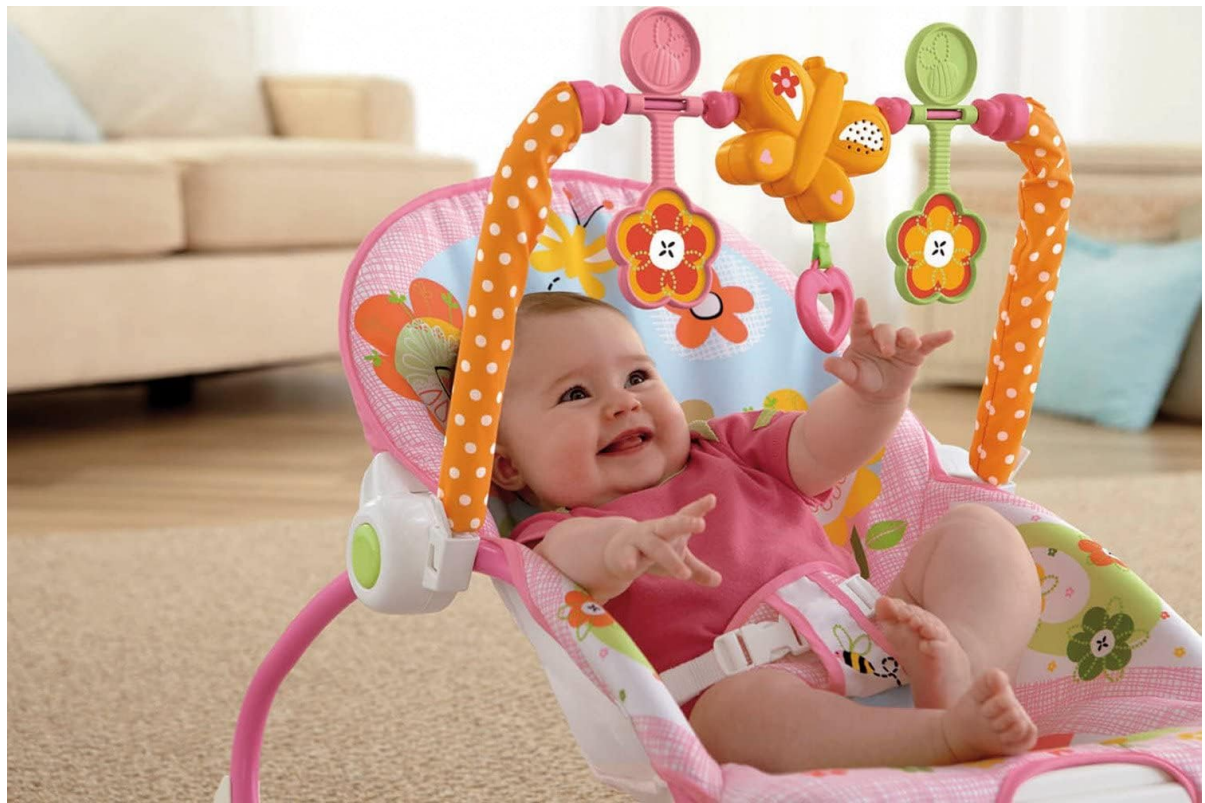
Figure 4: An infant engaging with the colorful hanging toys on the removable toy bar.