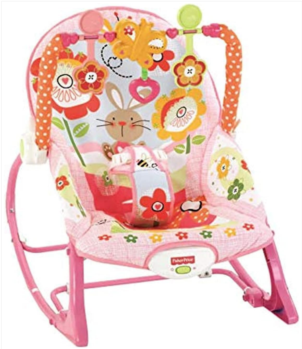
Figure 1: Main view of the Fisher-Price Toddler's Rocker, showing the frame, seat pad, and toy bar.