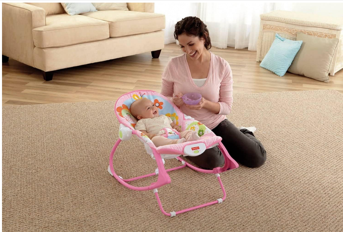
Figure 5: A parent feeding an infant in the rocker, demonstrating its utility during meal times.