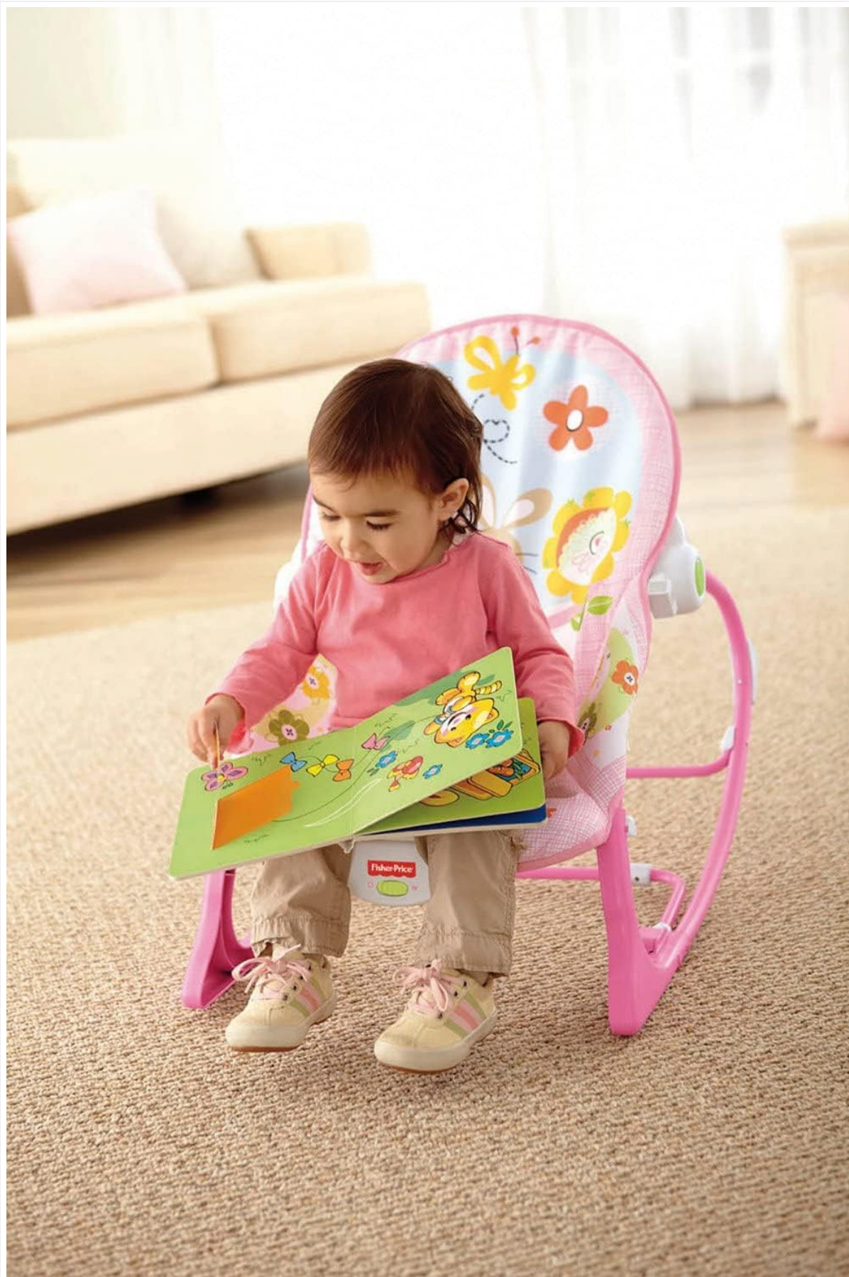
Figure 3: A toddler comfortably seated in the rocker, demonstrating its use as a stationary chair.