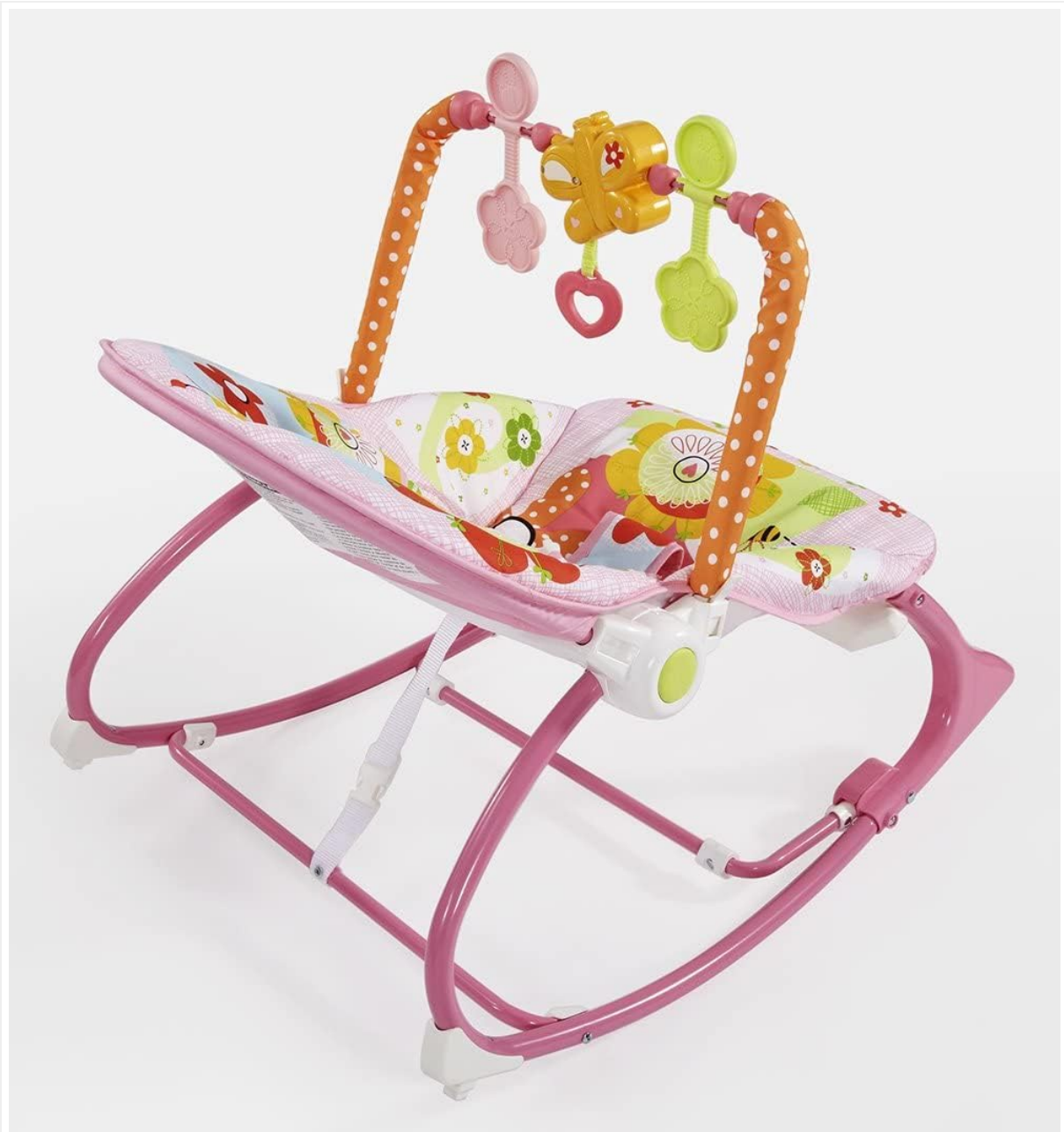
Figure 2: Side view illustrating the rocker frame and the adjustable kickstand for stationary or rocking modes.