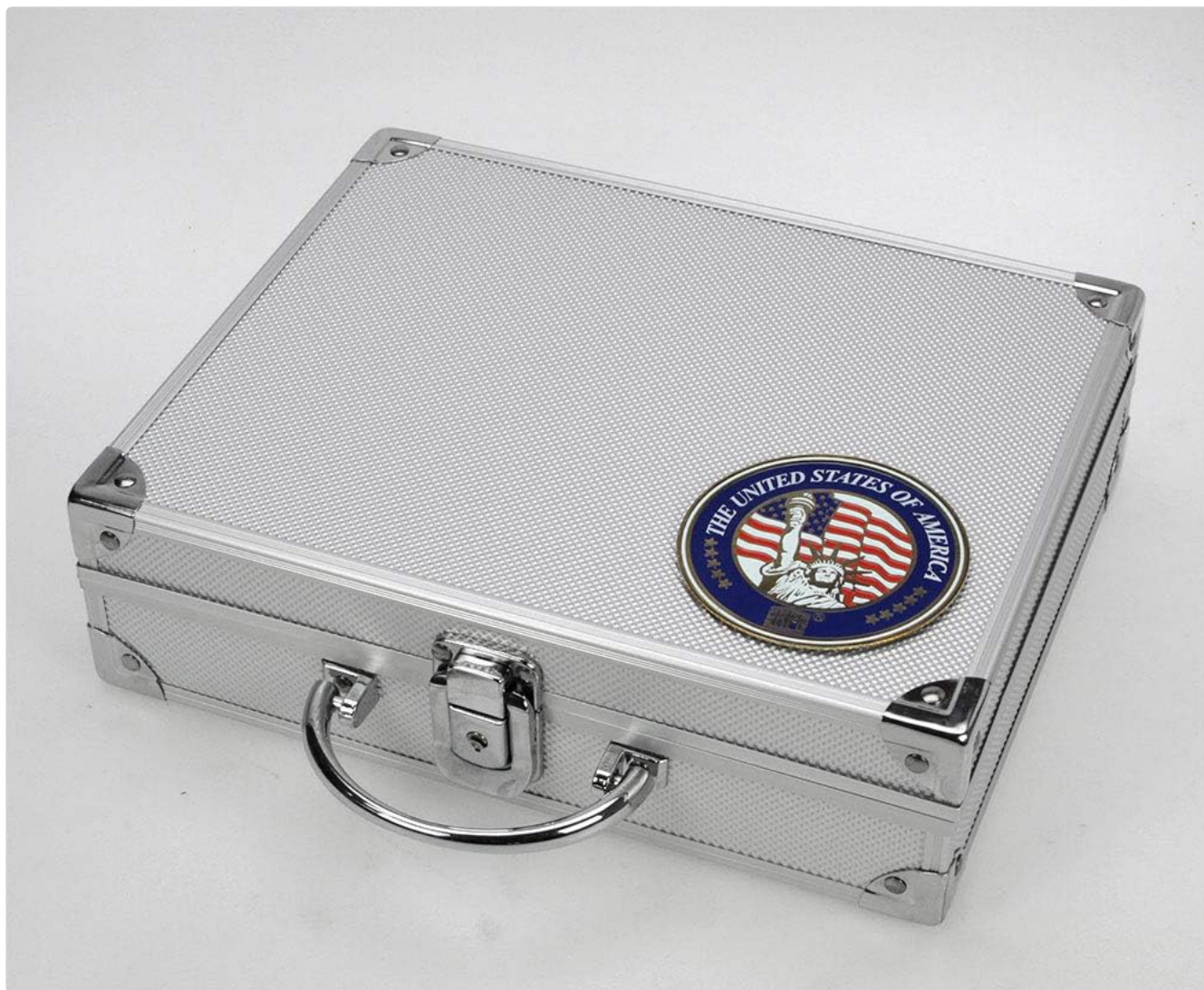
Figure 1: The SAFE 230 EC Coin Case. This image shows the compact aluminum case with its handle, latches, and a decorative USA 3D logo on the lid. The case is designed for secure and organized coin storage.