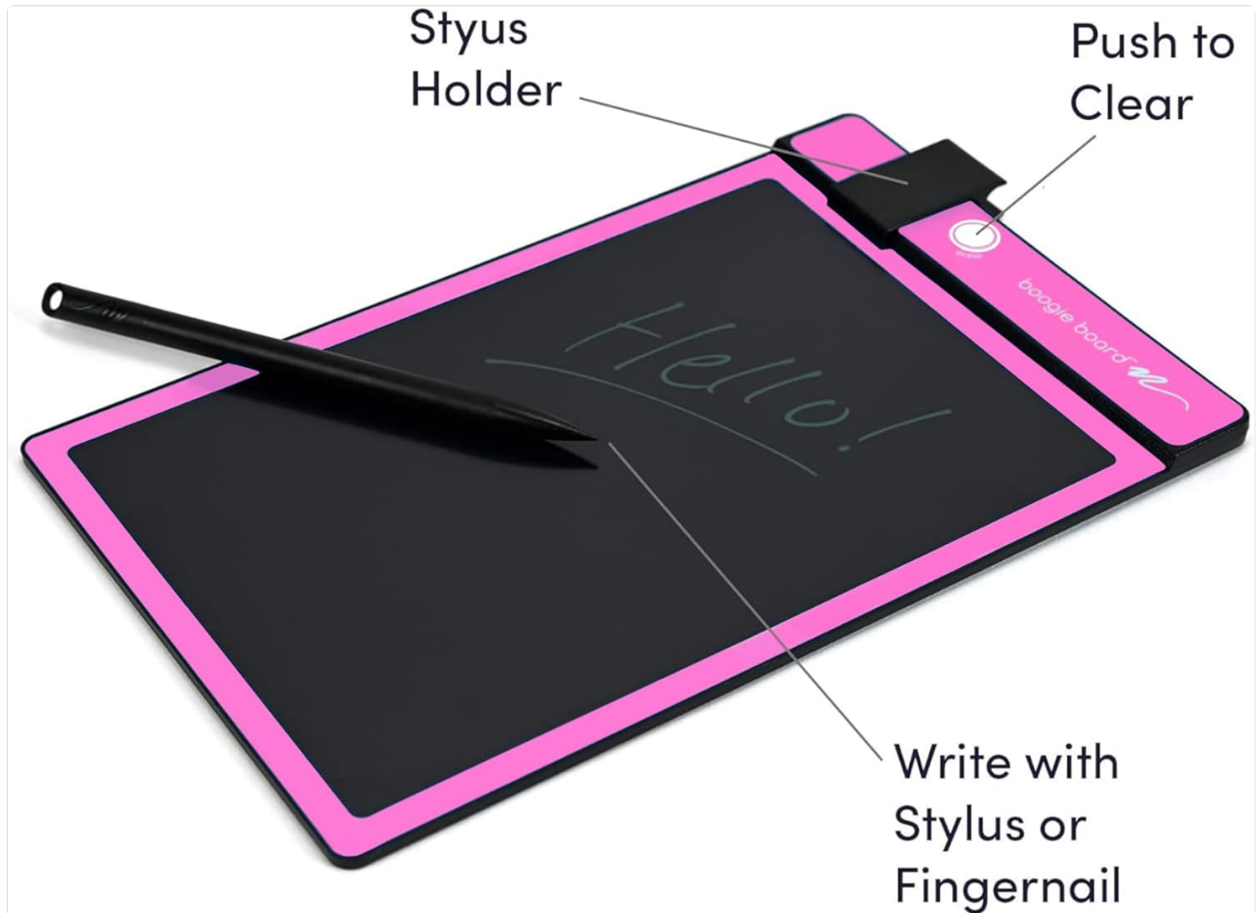
Image: An angled view of the pink Boogie Board, highlighting the stylus holder at the top, the "Push to Clear" button, and the main writing surface where text can be created with the stylus or a fingernail.