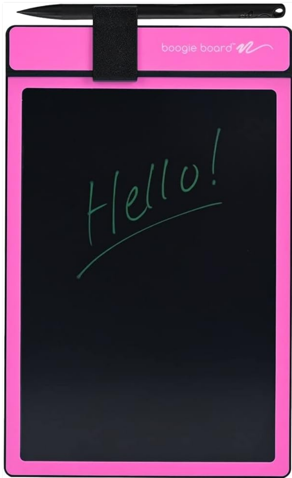
Image: Front view of the Boogie Board Basics in pink, displaying the word "Hello!" written on its black LCD screen. A black stylus is secured at the top.