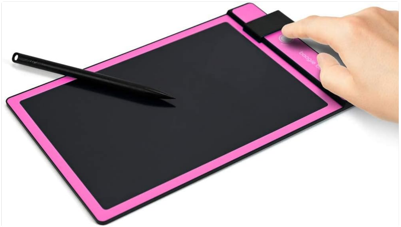
Image: A hand's index finger pressing the circular clear button located at the top of the pink Boogie Board, indicating the erase function.