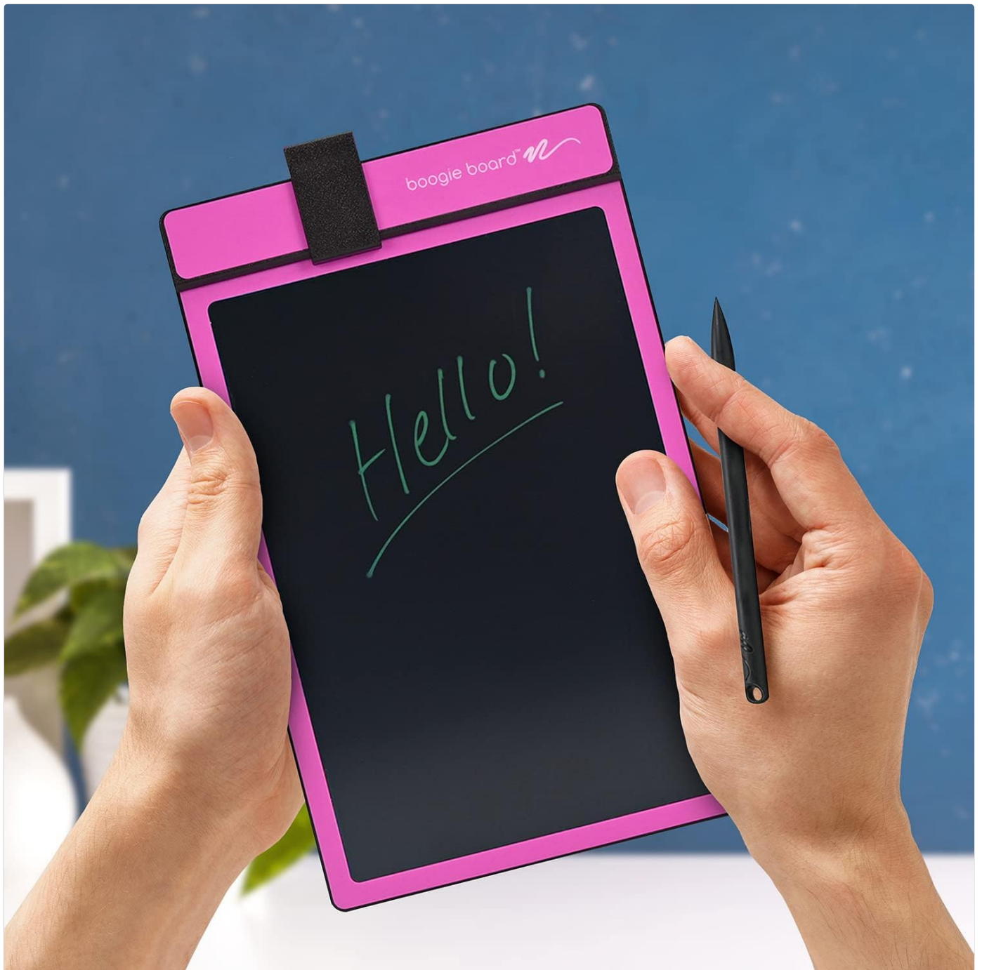
Image: A pair of hands holding the pink Boogie Board, with one hand using the black stylus to write the word "Hello!" on the screen.