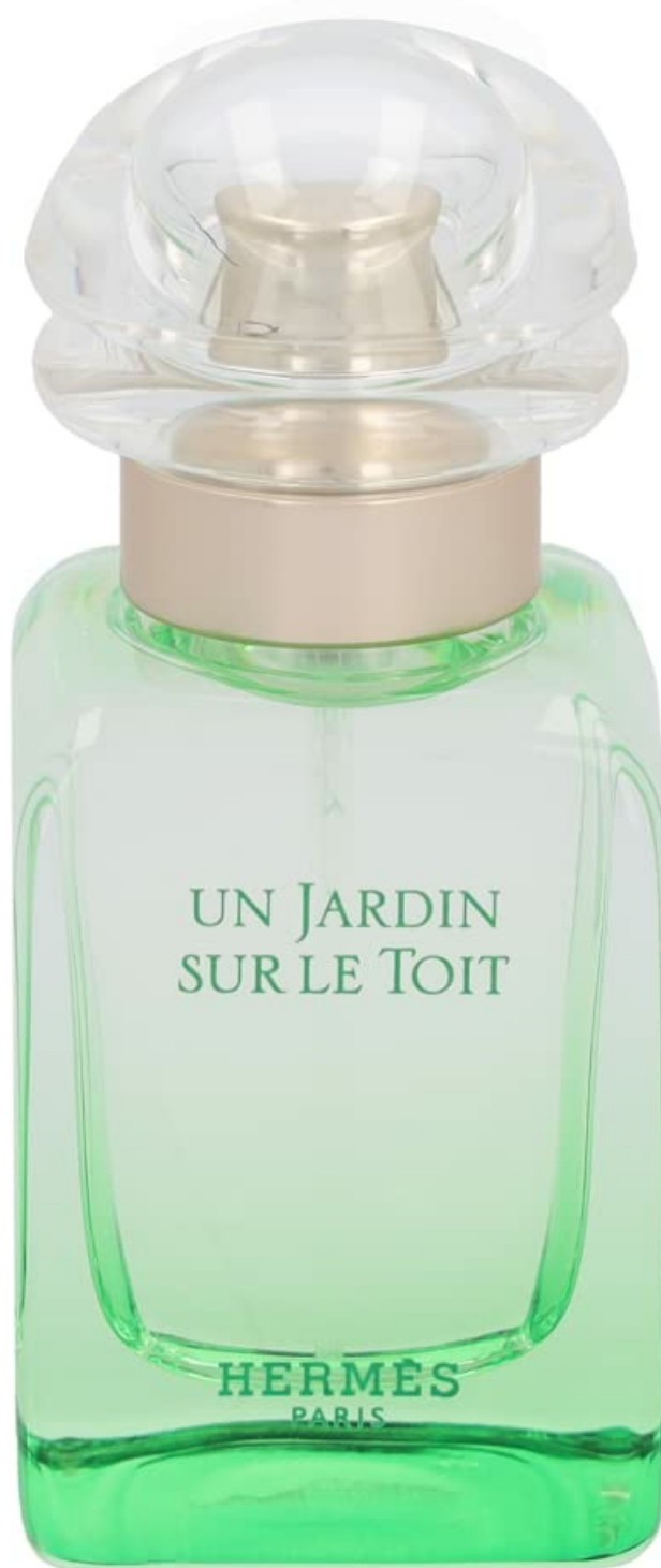
Figure 2: Close-up view of the Hermes Un Jardin Sur Le Toit Eau de Toilette spray bottle, showing its green-tinted glass and clear cap.