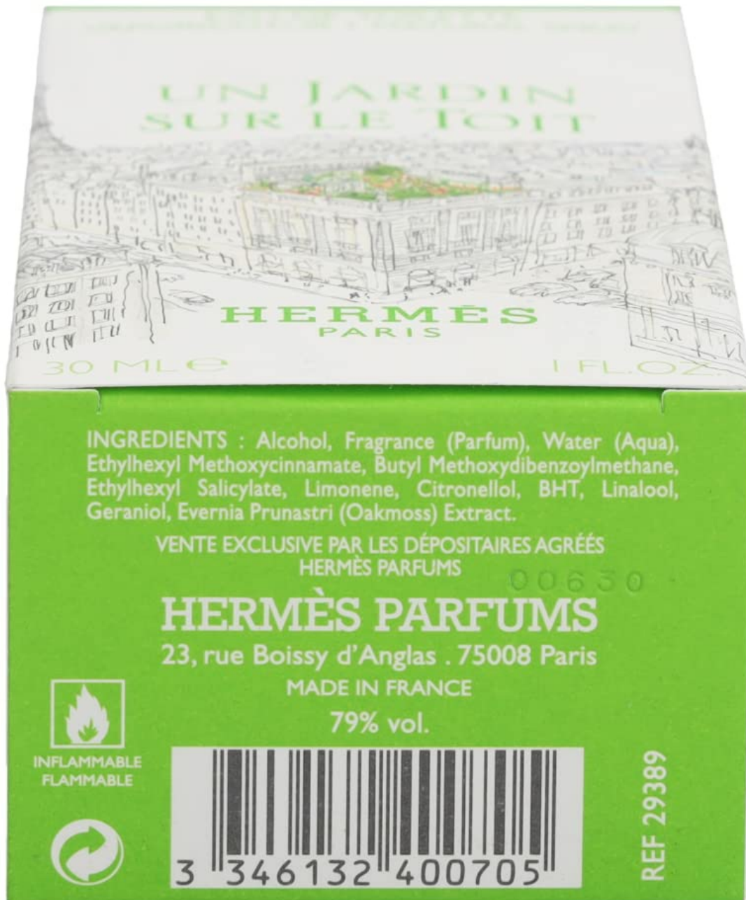
Figure 5: Bottom view of the Hermes Un Jardin Sur Le Toit Eau de Toilette packaging box, showing ingredients list and manufacturer details.