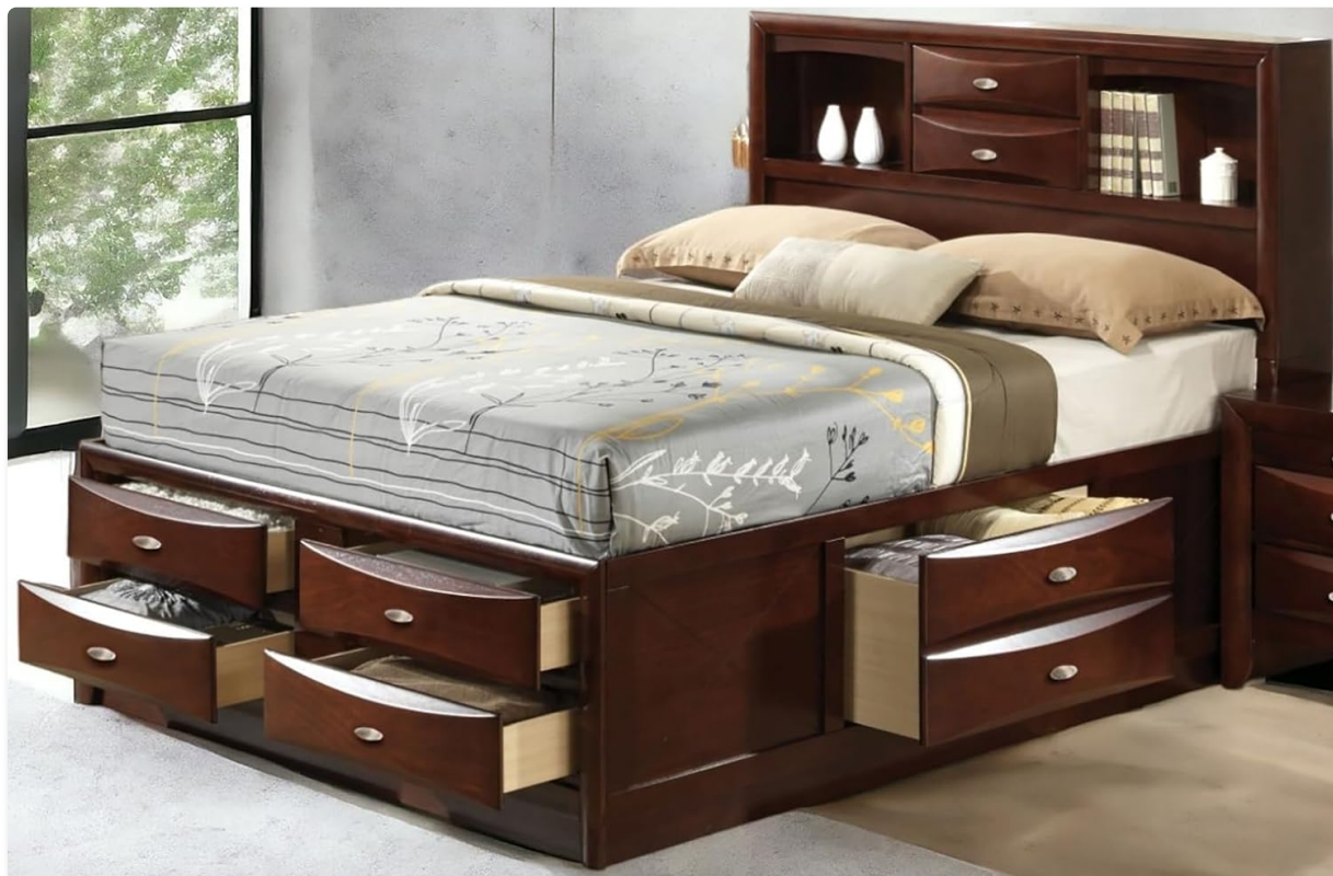
Image 1.1: The Acme Ireland Queen Storage Bed in Espresso, showcasing its design and integrated storage.

The Acme Ireland Queen Storage Bed is designed to offer both comfort and practical storage solutions, featuring a multi-drawer platform bed with a headboard and integrated storage drawers.