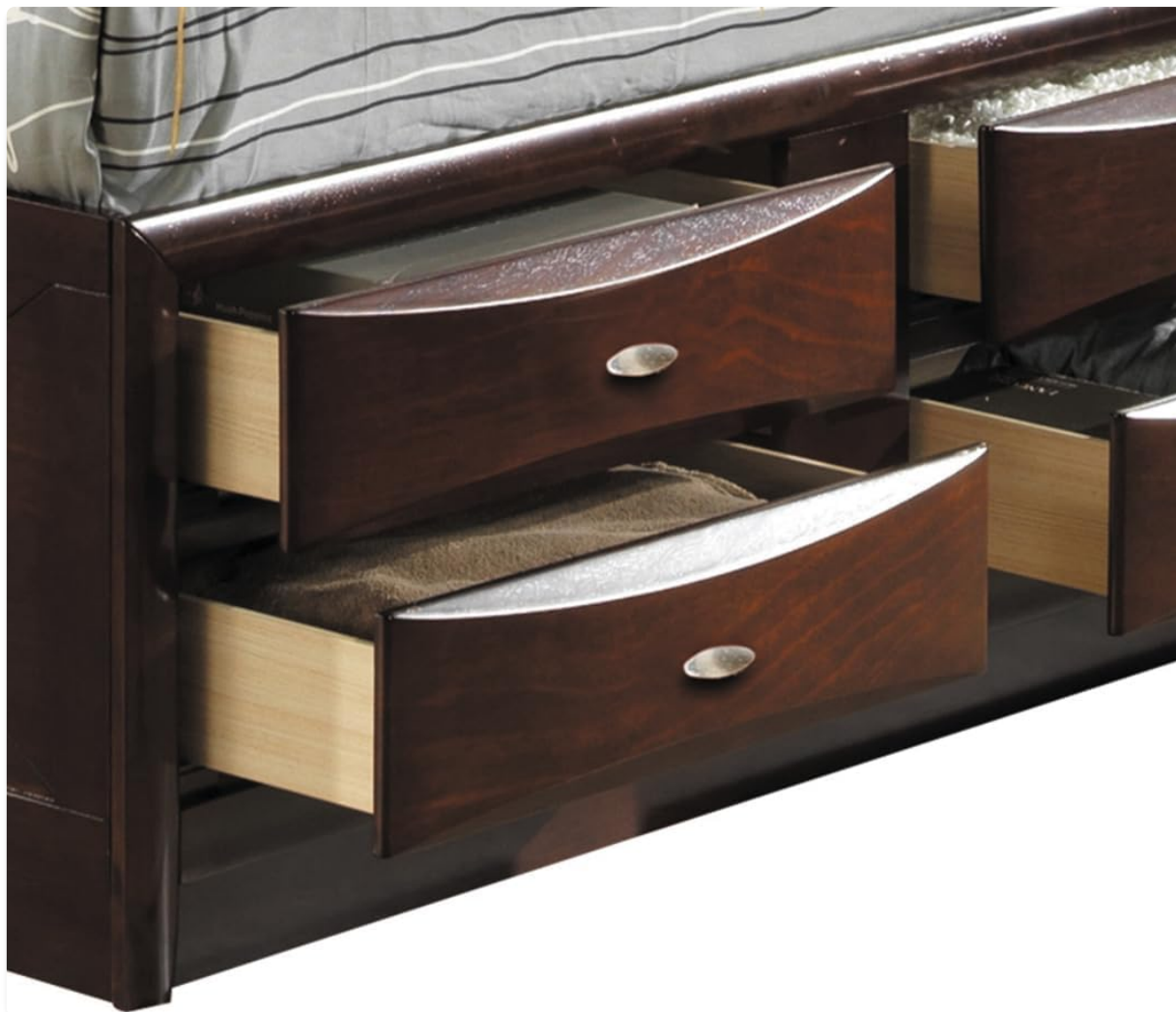
Image 4.3: Detail of the storage drawers located within the bed frame, designed for easy access.