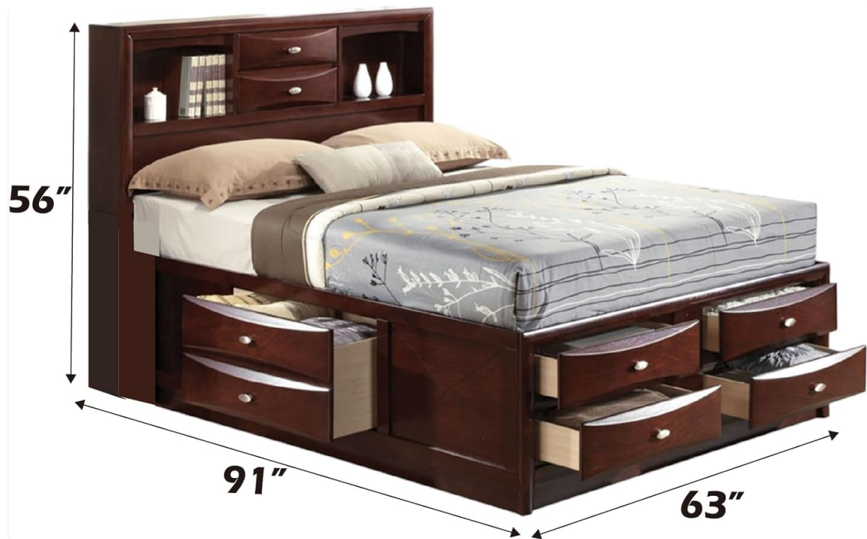
Image 8.1: Dimensional diagram of the Acme Ireland Queen Storage Bed.