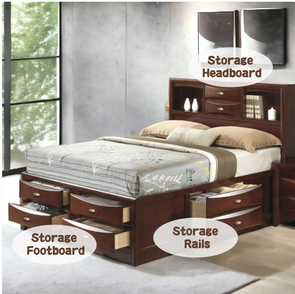
Image 4.1: Overview of the bed's storage components, including headboard, footboard, and side rail drawers.