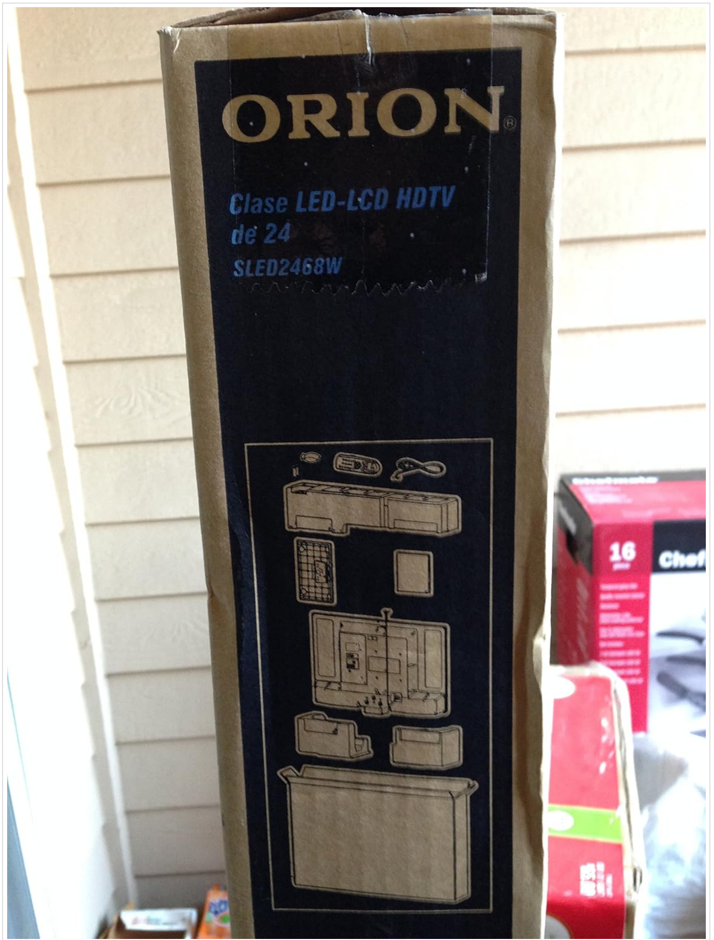
Image: The side of the Orion TV box illustrating the TV and stand components packed inside.