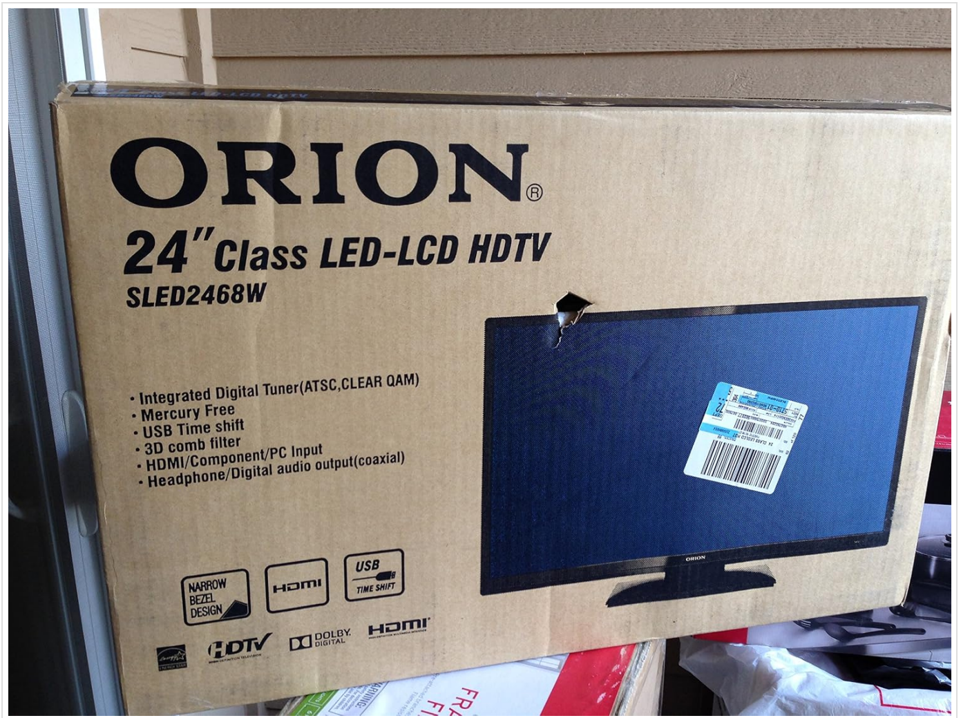
Image: The front of the Orion 24" LED-LCD HDTV box, displaying the model number SLED2468W and key features such as Integrated Digital Tuner, USB Time Shift, HDMI, and Headphone/Digital Audio Output.

Remove the TV and all accessories from the packaging. Retain the packaging for future transport or storage.