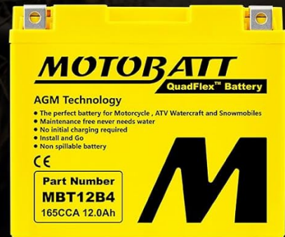
Image: This image shows the MotoBatt MBT12B4 battery alongside various powersports vehicles and illustrates its maximum capacity design compared to other batteries.