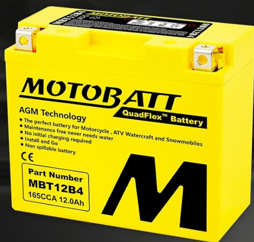
Image: A graphic indicating that the MotoBatt MBT12B4 QuadFlex AGM Battery is compatible with and replaces Yuasa battery types YT12BBS and YT12B4.