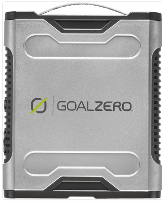
Front view of the Sherpa 50 Recharger, highlighting the USB, input, 12V, and laptop ports.