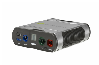
Top view of the Goal Zero Sherpa 50 Recharger, showcasing its compact design.