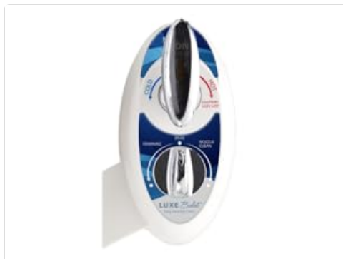
Image: LUXE Bidet customer support information, highlighting U.S. based support and online resources.

Visit the official LUXE Bidet website for additional resources, FAQs, and video guides: www.LuxeBidet.com