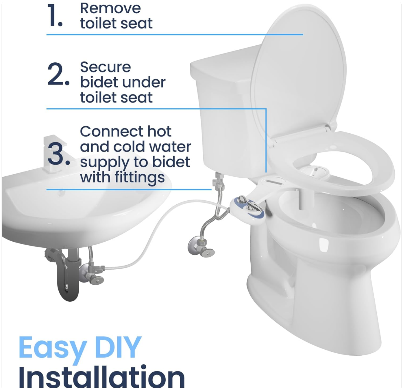
Image: Simplified diagram showing the three main steps for installing the bidet attachment.

7. Restore Water Supply: Slowly turn on both the cold and hot (if connected) water supply valves. Check for any leaks.