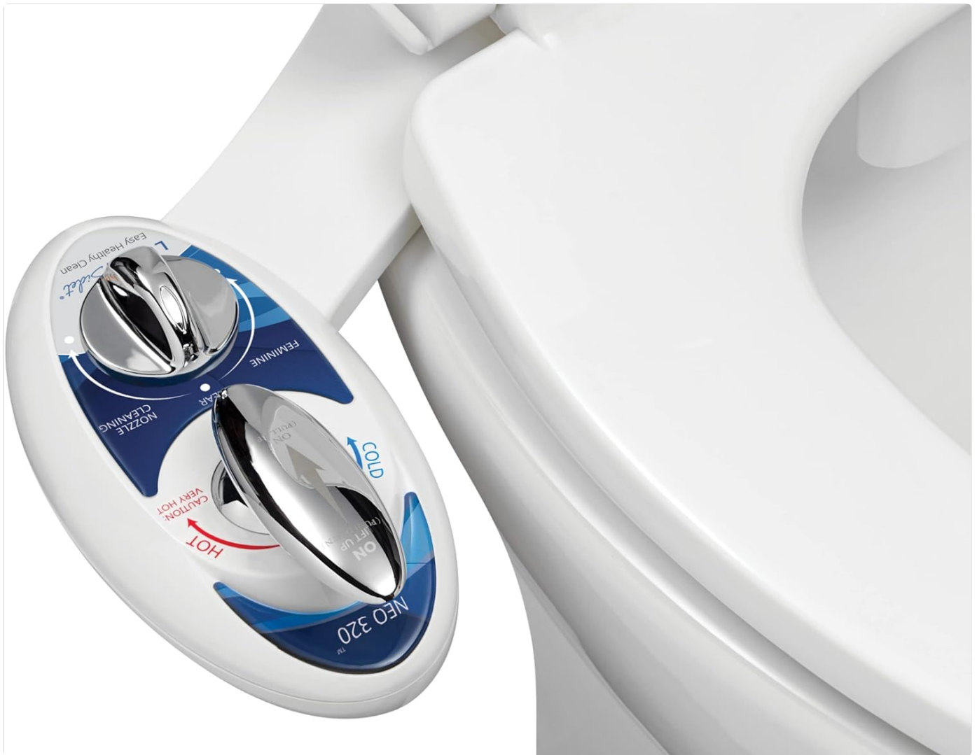
Image: The LUXE Bidet NEO 320 control panel and nozzle assembly attached to a standard toilet.