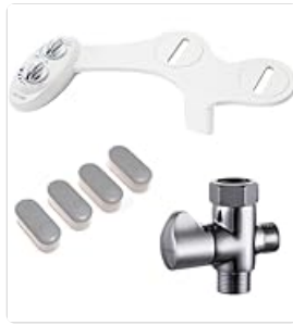
Image: Illustration highlighting the durable construction materials of the LUXE Bidet NEO 320, including polyurethane hoses and layered ABS plastic.