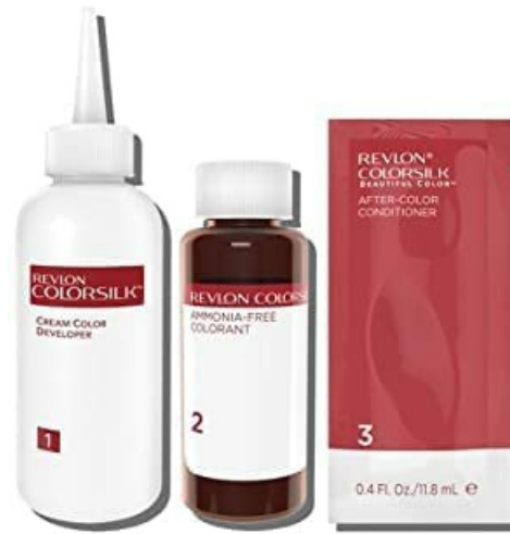
Image: The Revlon ColorSilk kit contents, showing the Cream Developer bottle, Ammonia-Free Colorant bottle, and After-Color Conditioner packet.