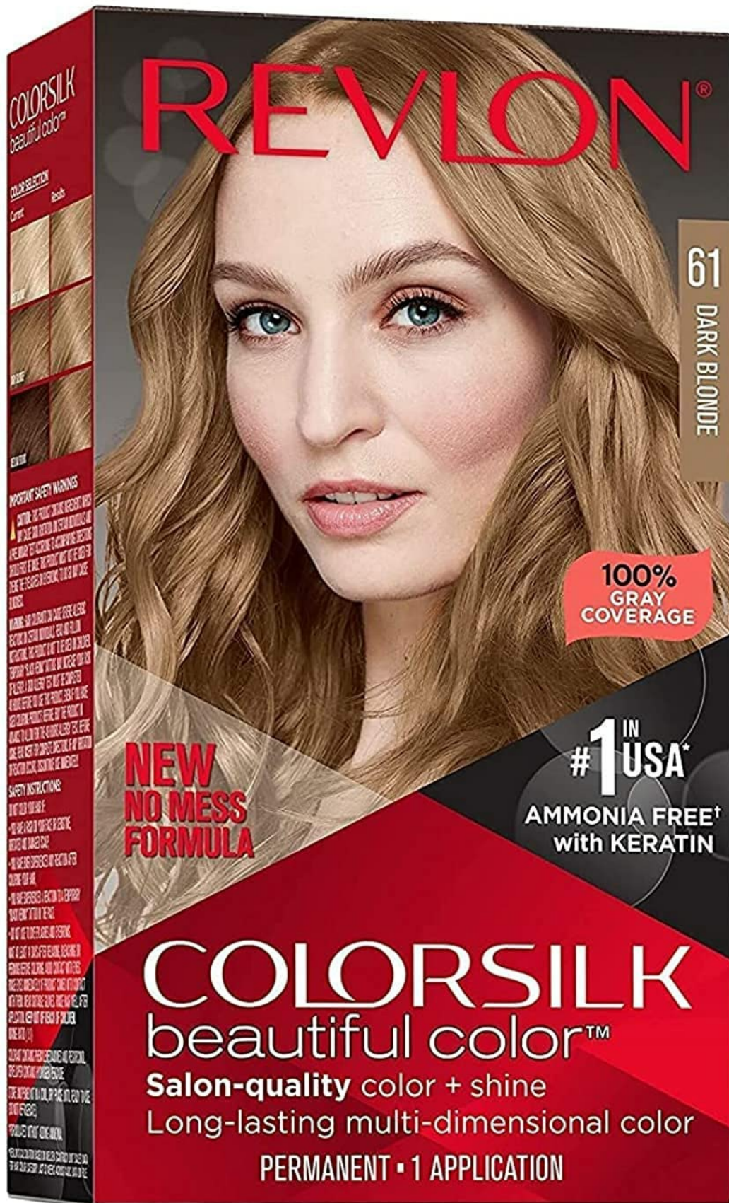
Image: Revlon ColorSilk Beautiful Color Dark Blonde (Shade 61) product box, highlighting 'New No Mess Formula', '100% Gray Coverage', and 'Ammonia Free with Keratin'.