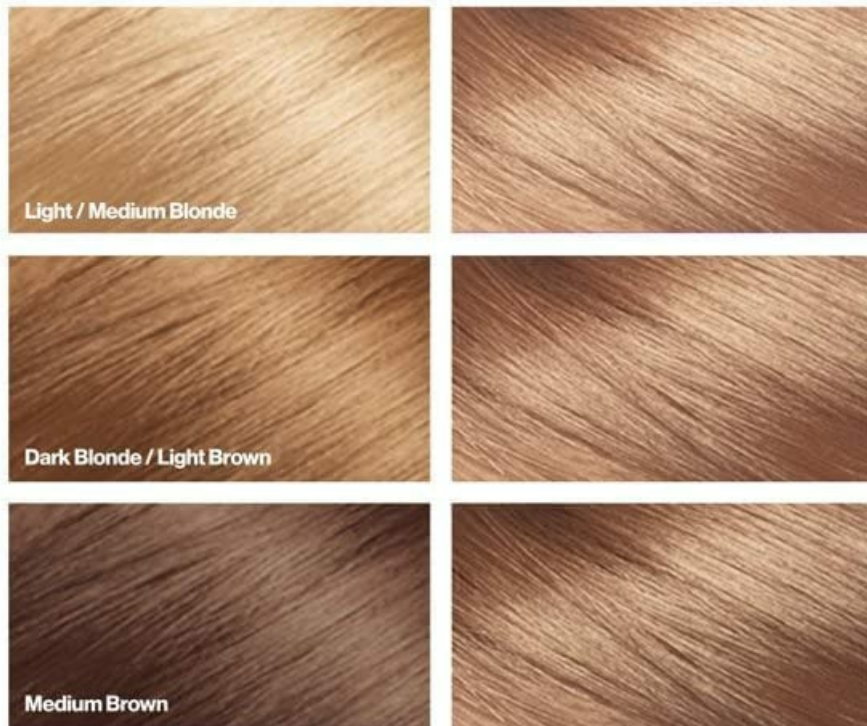
Image: Color chart for Revlon ColorSilk Dark Blonde (Shade 61), showing expected results on Light/Medium Blonde, Dark Blonde/Light Brown, and Medium Brown hair.

As shown in the chart, if your starting hair color is Light/Medium Blonde, the result will be a slightly deeper, richer Dark Blonde. If your hair is Dark Blonde/Light Brown, you will achieve a vibrant Dark Blonde. For Medium Brown hair, the result will be a lighter, warm Dark Blonde.