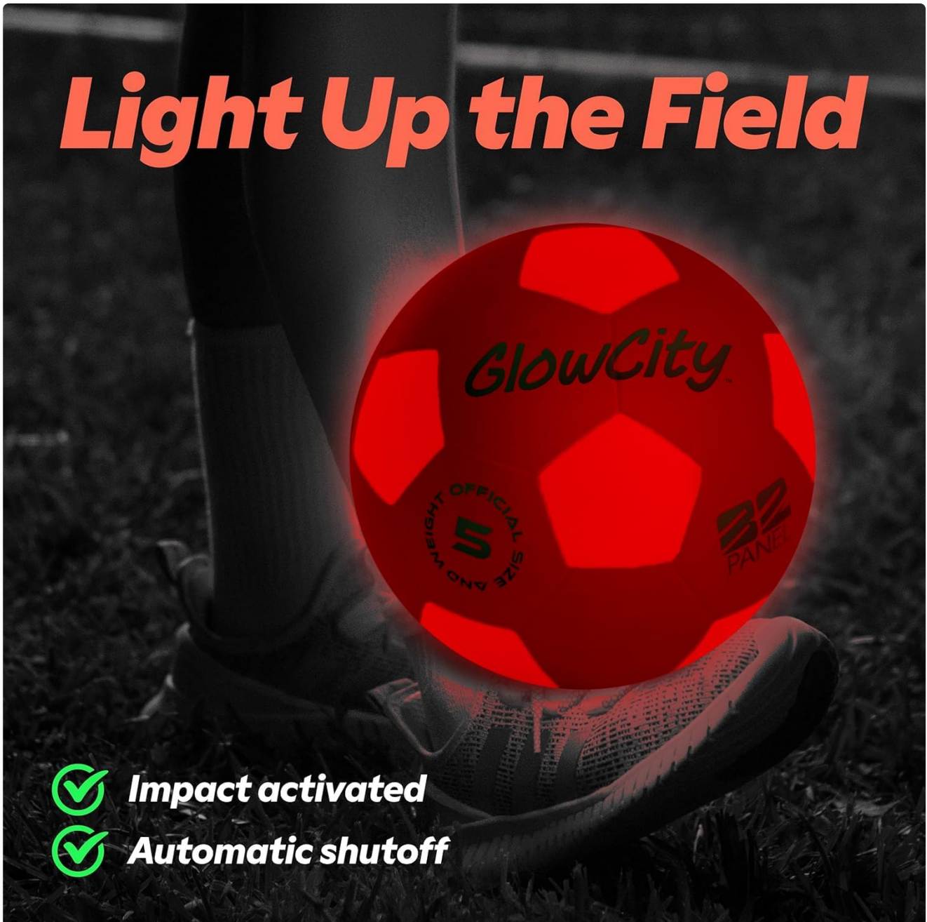
Figure 3.1: The ball lights up upon impact, perfect for evening play.