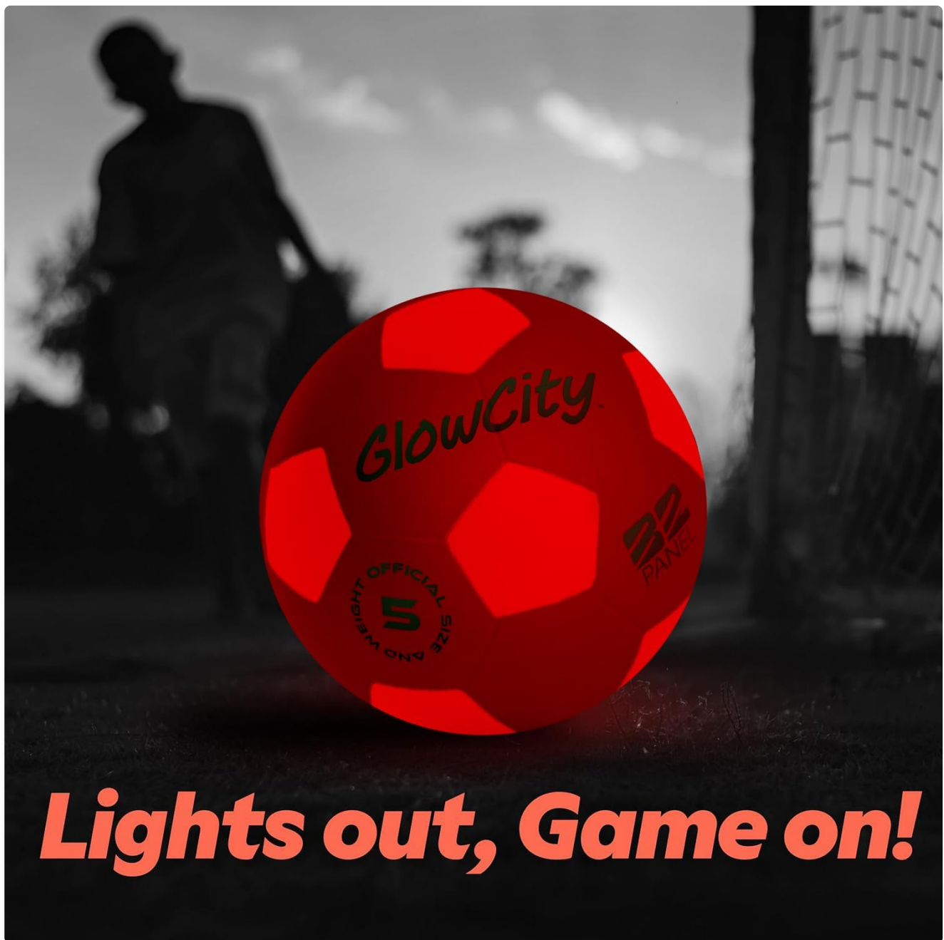
Figure 3.2: Enjoy soccer even after dark with the illuminated ball.