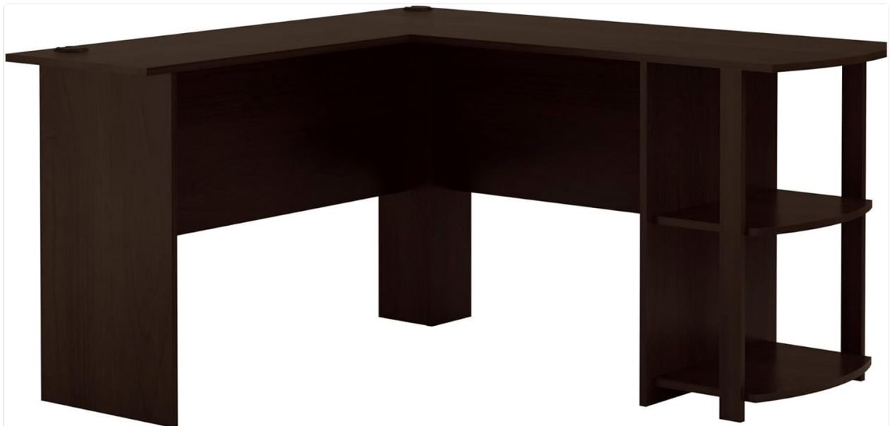
Figure 2: The L-shaped desk with integrated bookshelves, shown in espresso finish.