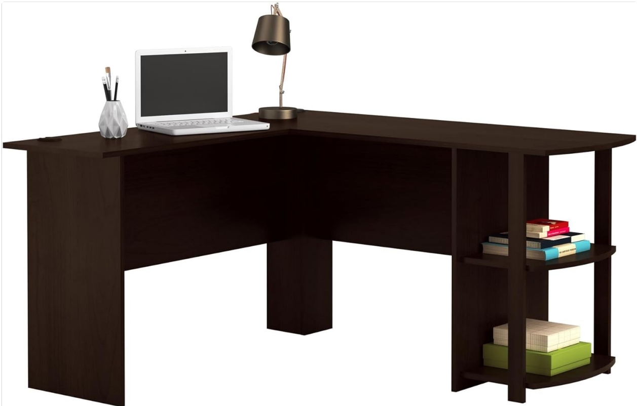
Figure 3: The Ameriwood Home Dakota L-Desk set up in a corner, demonstrating its space-saving design and ample work surface.