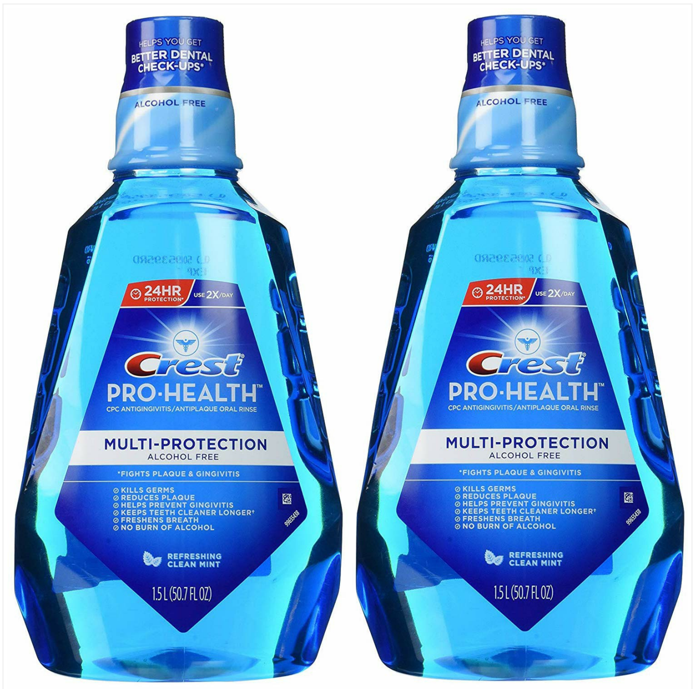
Image: Crest Pro-health Multi-protection Alcohol Free Rinse (Pack of 2)