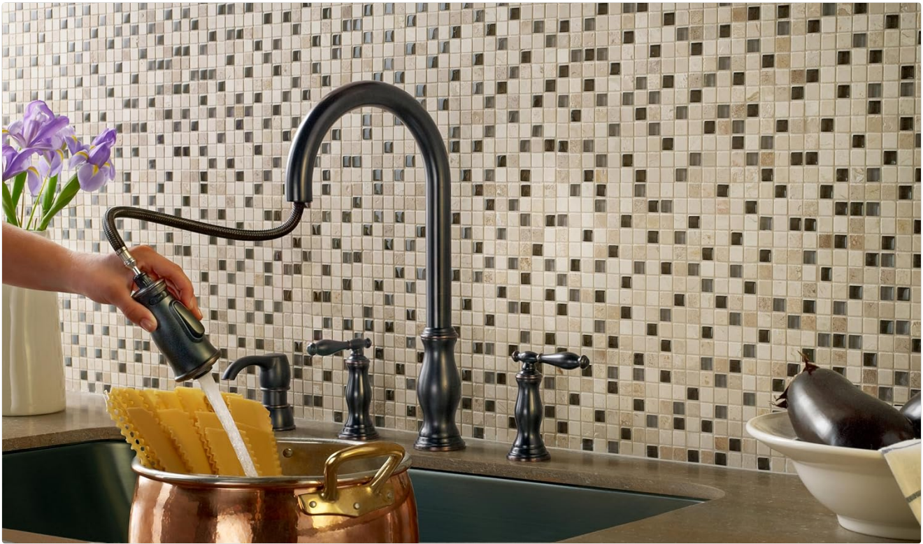
Figure 4.2: The pull-down sprayer in spray mode, effective for rinsing produce or cleaning.