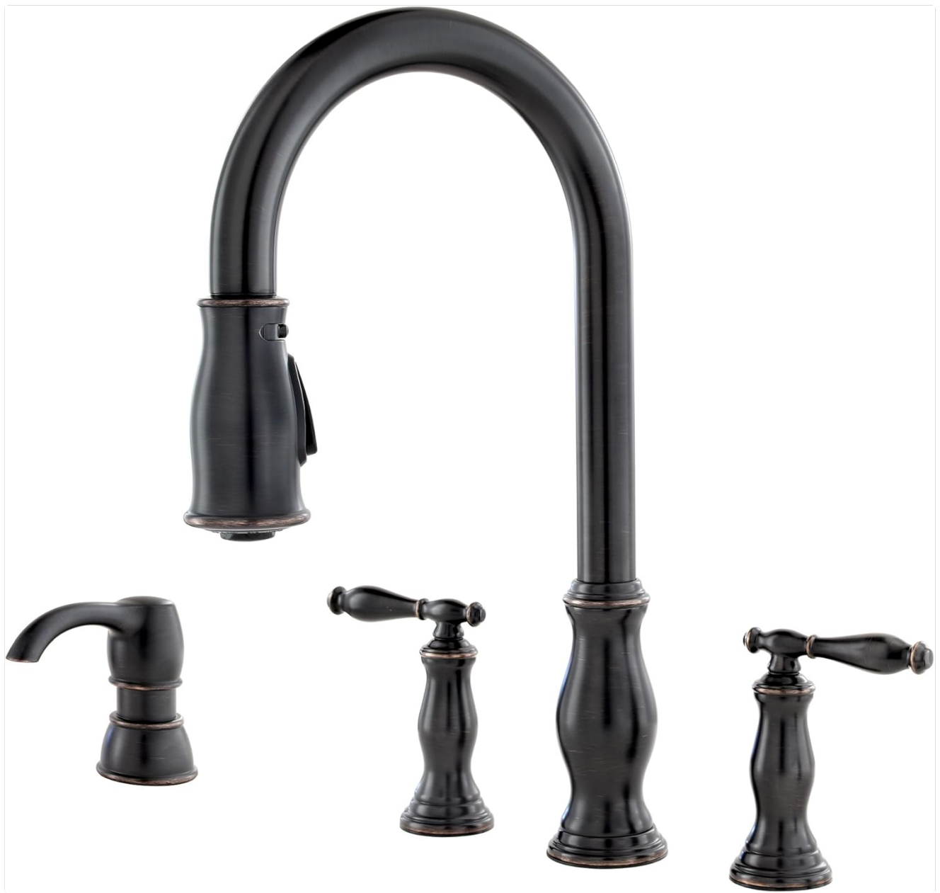
Figure 2.1: Overview of the Pfister Hanover F5314HNY Kitchen Faucet, highlighting AccuDock, 2 Spray Functions, Pforever Seal, and Pfast Connect features.