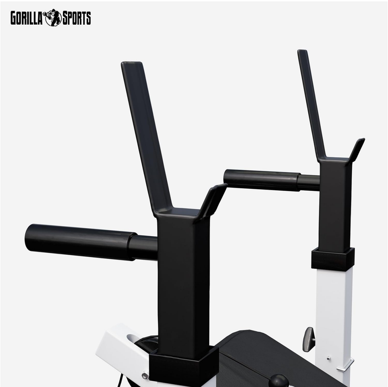
Image 5.2: Close-up view of the barbell rack, highlighting the secure resting points for barbells and the integrated dip handles.