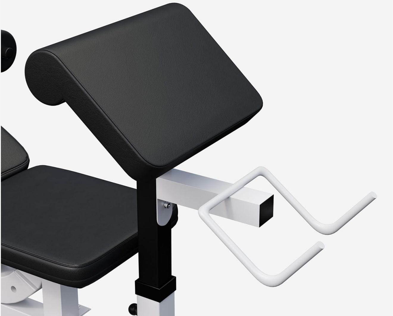
Image 5.4: A close-up of the preacher curl pad, designed for isolating bicep muscles during curls.