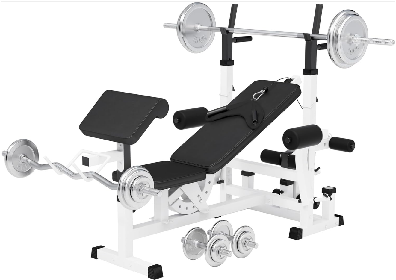
Image 1.1: The Gorilla Sports Universal Weight Bench with the included 108 kg barbell set, showcasing its various components for a complete home workout.