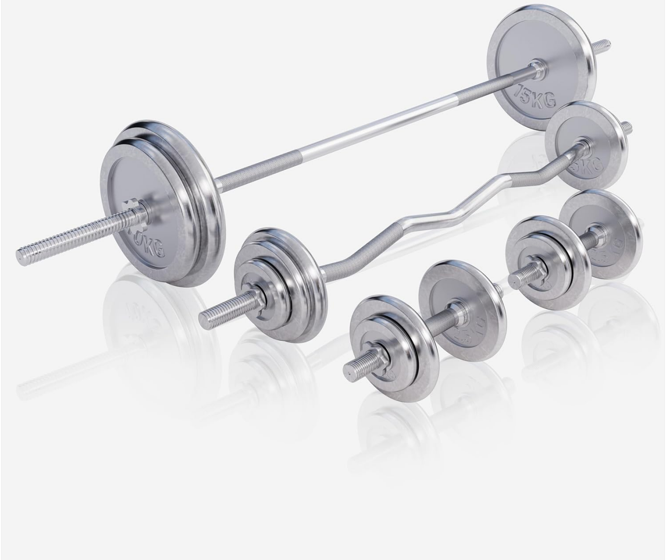
Image 3.2: The assembled 108 kg barbell set, featuring a straight barbell, an EZ curl bar, and two dumbbell bars with weight plates.