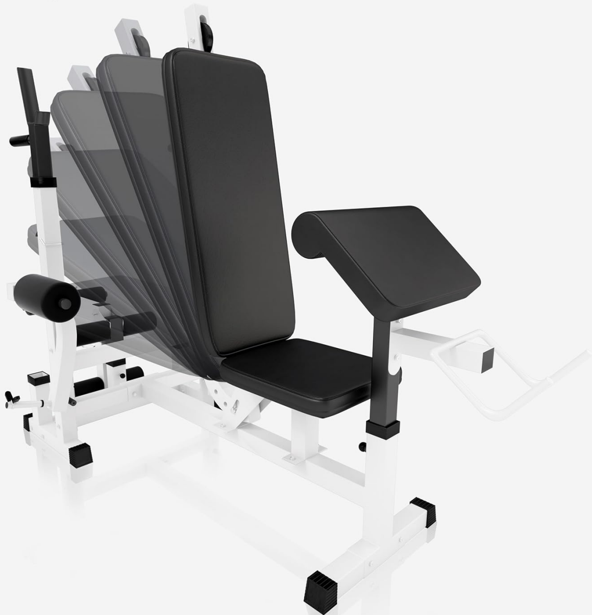
Image 5.1: Illustration of the adjustable backrest, showing how it can be moved through different positions.