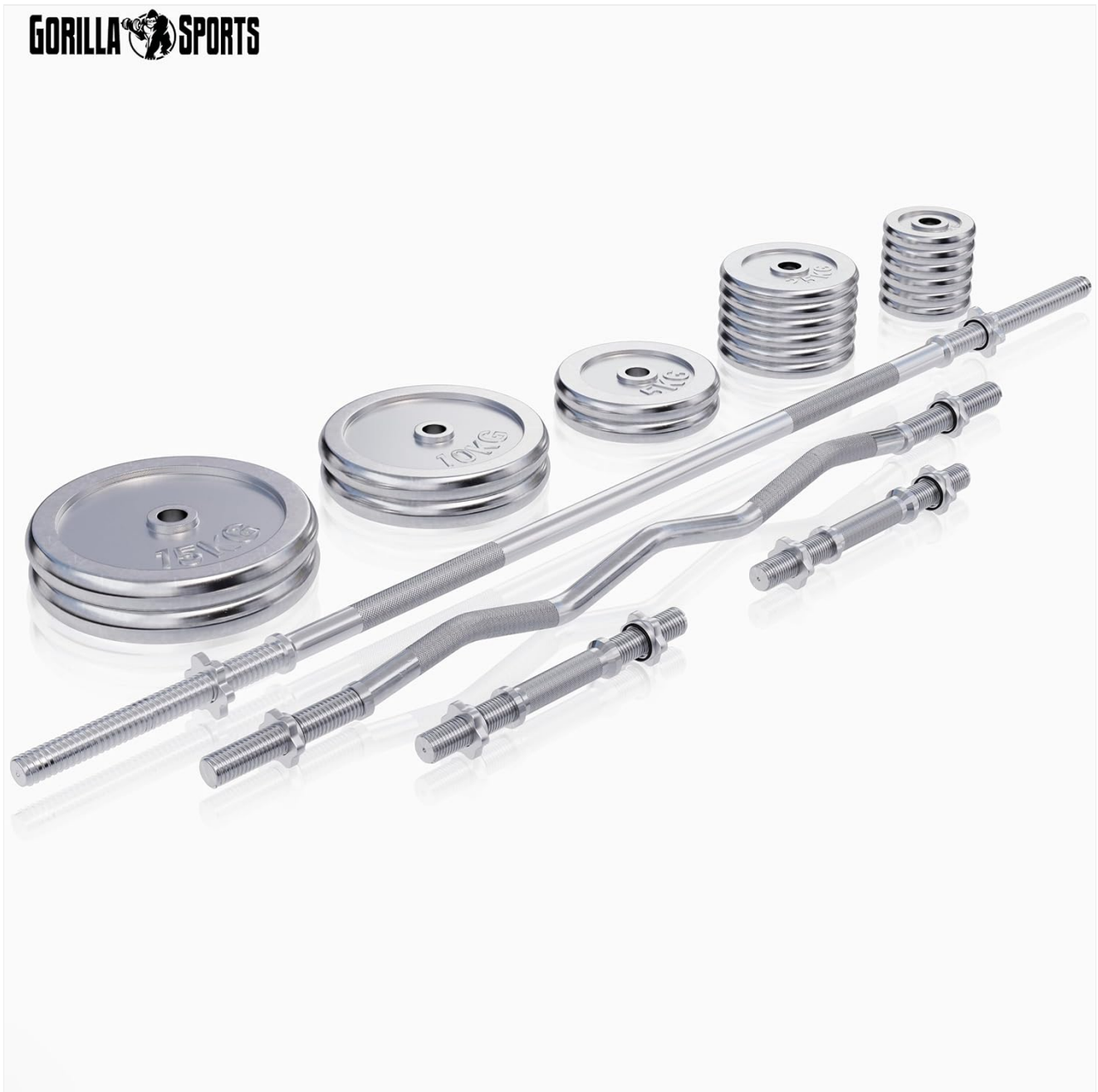
Image 3.1: Individual components of the 108 kg barbell set, including various weight plates and bars.