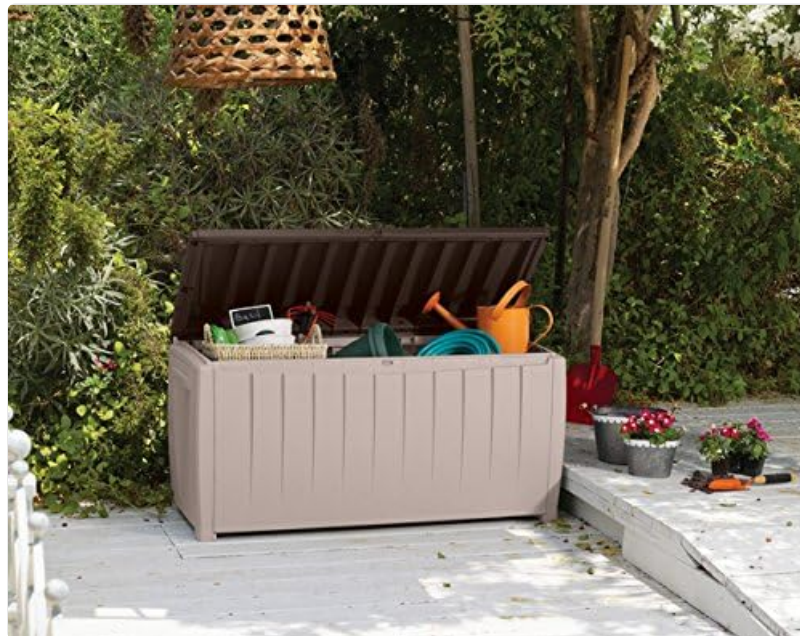
Image: Keter Novel Cushion Box with lid open, showing stored items.

To store items, simply lift the lid using the integrated handle. The lid support mechanism will hold the lid open for convenient access, preventing it from slamming shut. Place items inside, ensuring they do not exceed the internal dimensions of 115 x 48.2 x 56.6 cm (L x W x H). Close the lid firmly to protect contents from dust, moisture, and other outdoor elements. The box features a lockable option for added security (lock not included).