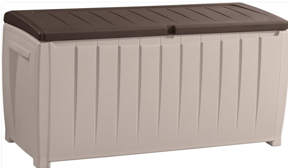
Image: Keter Novel Cushion Box in its closed state.

The Keter Novel Cushion Box is a versatile outdoor storage solution designed to keep your garden tools, equipment, furniture cushions, and other outdoor accessories protected and organized. Its durable, weather-resistant plastic construction ensures longevity and protection from the elements, while its robust design also allows it to function as a convenient outdoor bench.