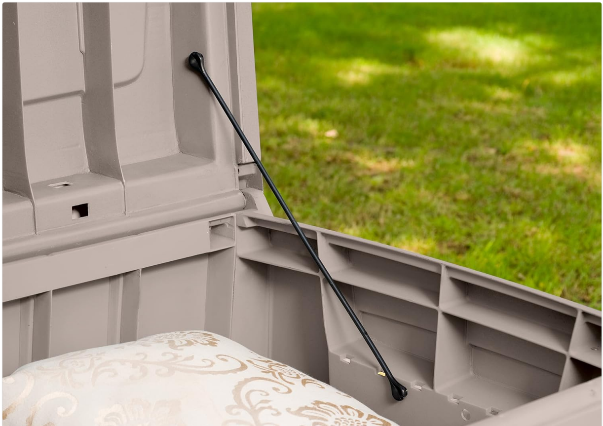
Image: Keter Novel Cushion Box being used as a bench.

The Keter Novel Cushion Box is designed with a sturdy top surface, allowing it to be used as an outdoor bench. Ensure the lid is fully closed and latched before sitting on it. It is suitable for seating one adult. Do not exceed the recommended weight capacity for seating.