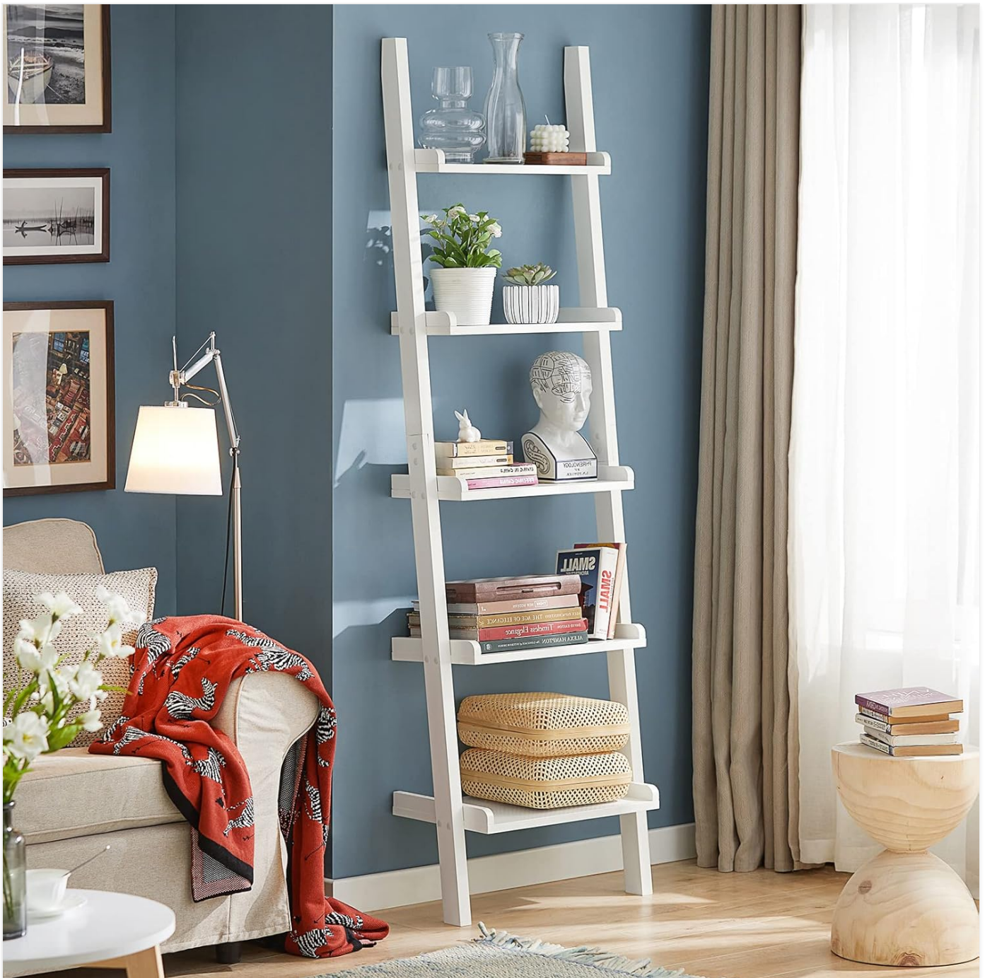
Figure 5.1: Example of items displayed on the shelf.