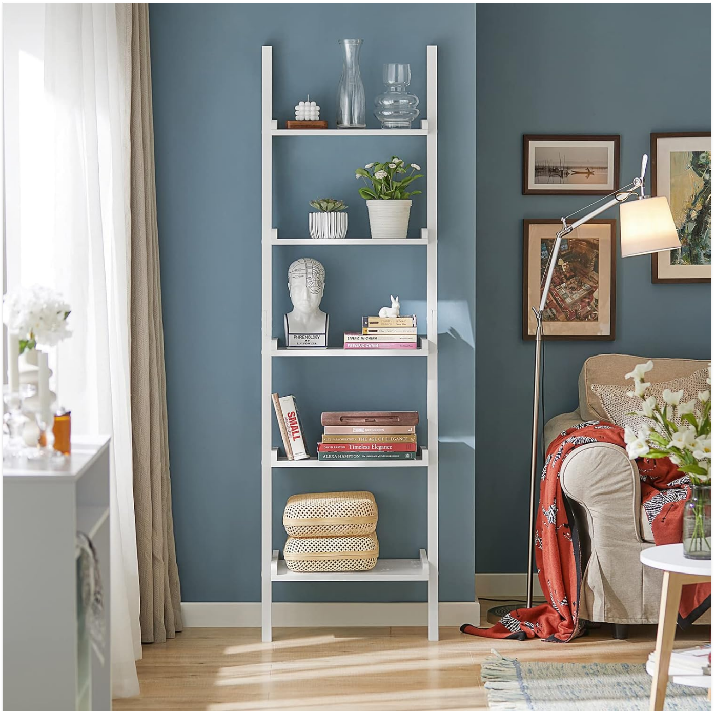
Figure 1.1: Assembled SoBuy FRG17-W Ladder Shelf.