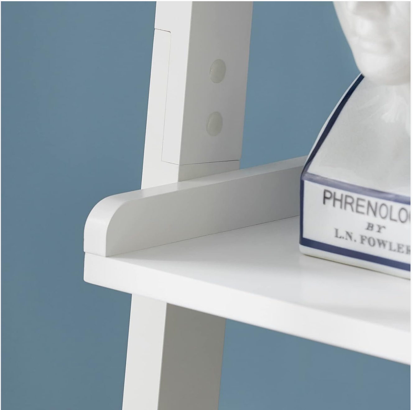
Figure 4.1: Detail of shelf attachment.