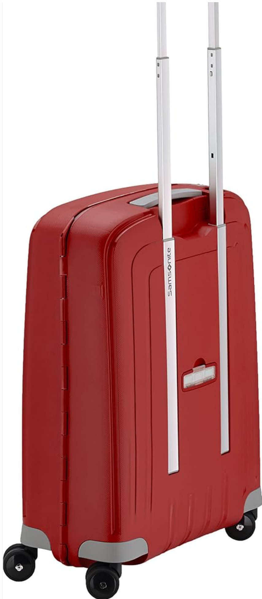
Image: Side profile of the Samsonite S'Cure Spinner S, highlighting its compact design and integrated components.