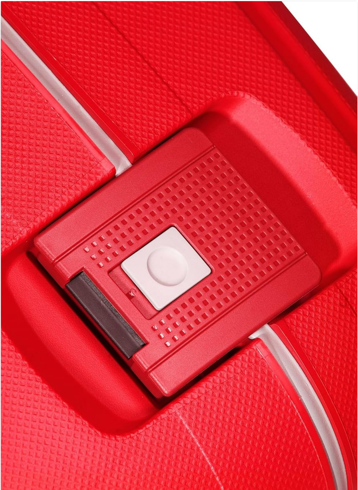
Image: A side latch, part of the three-point locking system, ensuring secure closure of the suitcase.