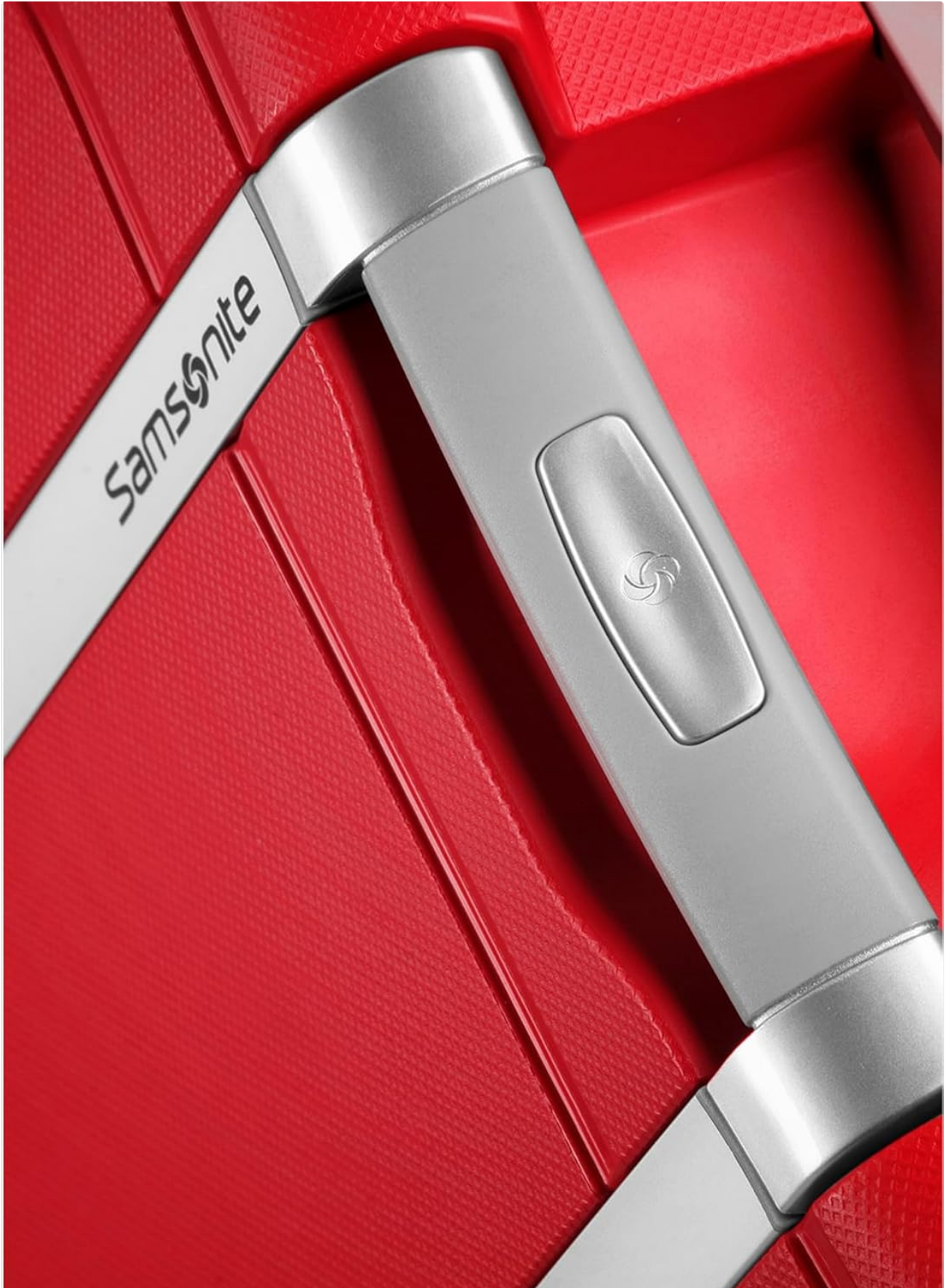
Image: Detail of the top carry handle with the Samsonite branding.