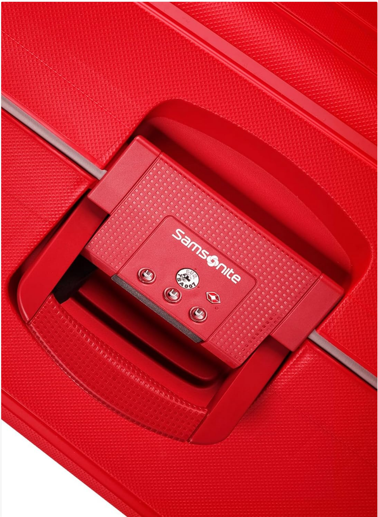
Image: Detail of the integrated TSA combination lock. The lock allows you to secure your belongings while permitting security authorities to inspect your luggage without damage.