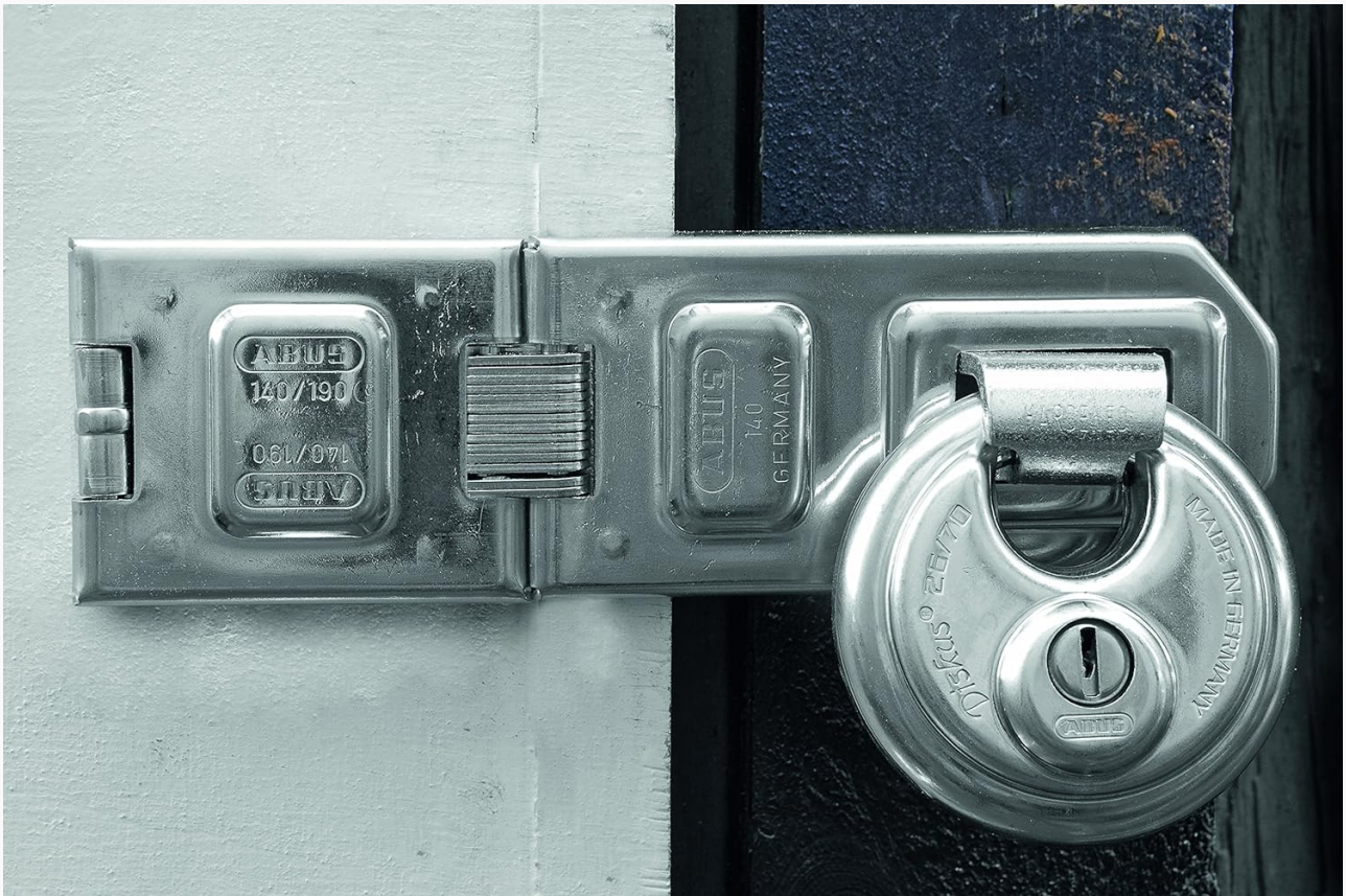
A wider perspective of the ABUS 26/70 Diskus Padlock attached to a hasp, highlighting its robust fit.