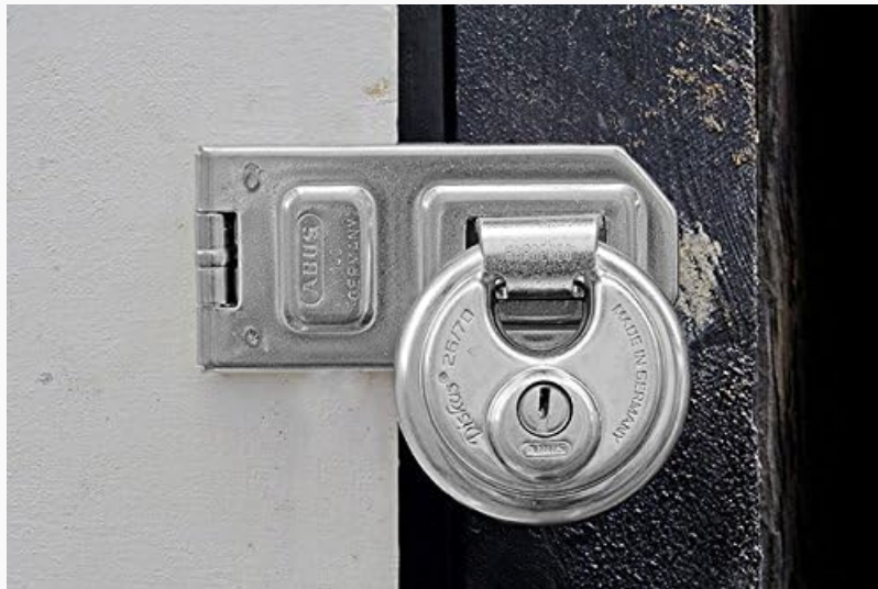
The ABUS 26/70 Diskus Padlock securely installed on a hasp, demonstrating its low-profile design.