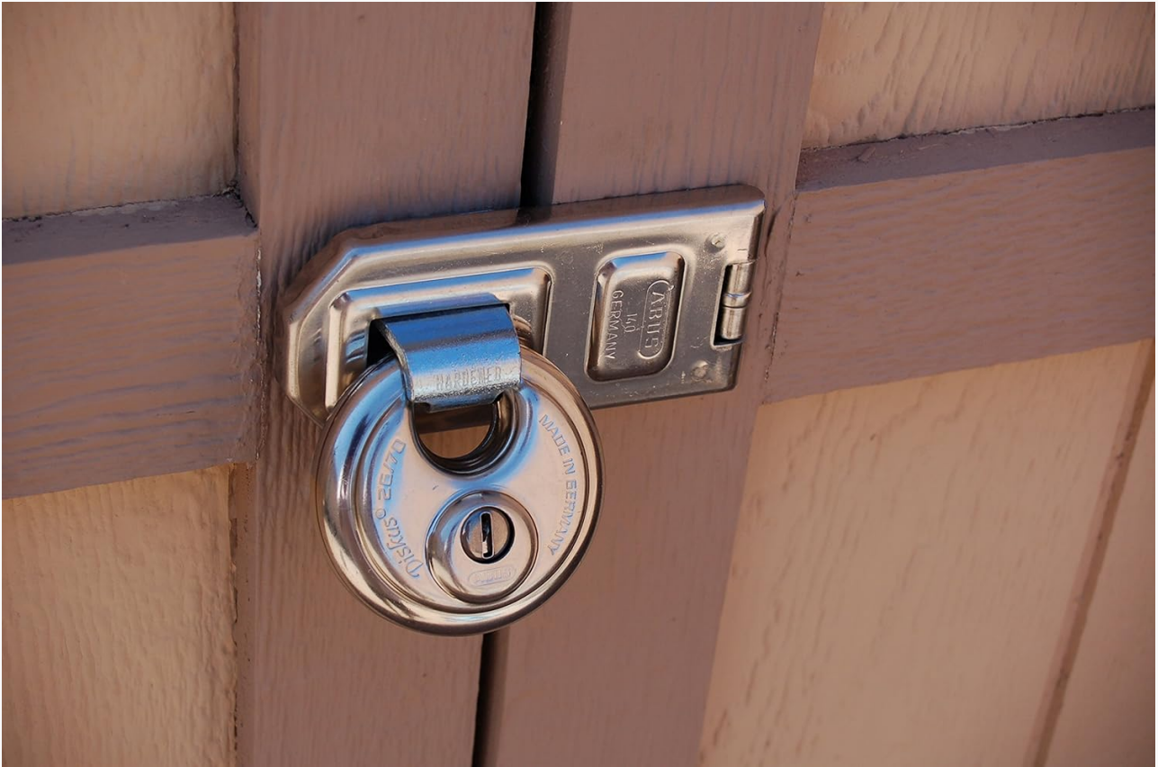
Front view of the ABUS 26/70 Diskus Padlock, showcasing its solid body and keyhole.