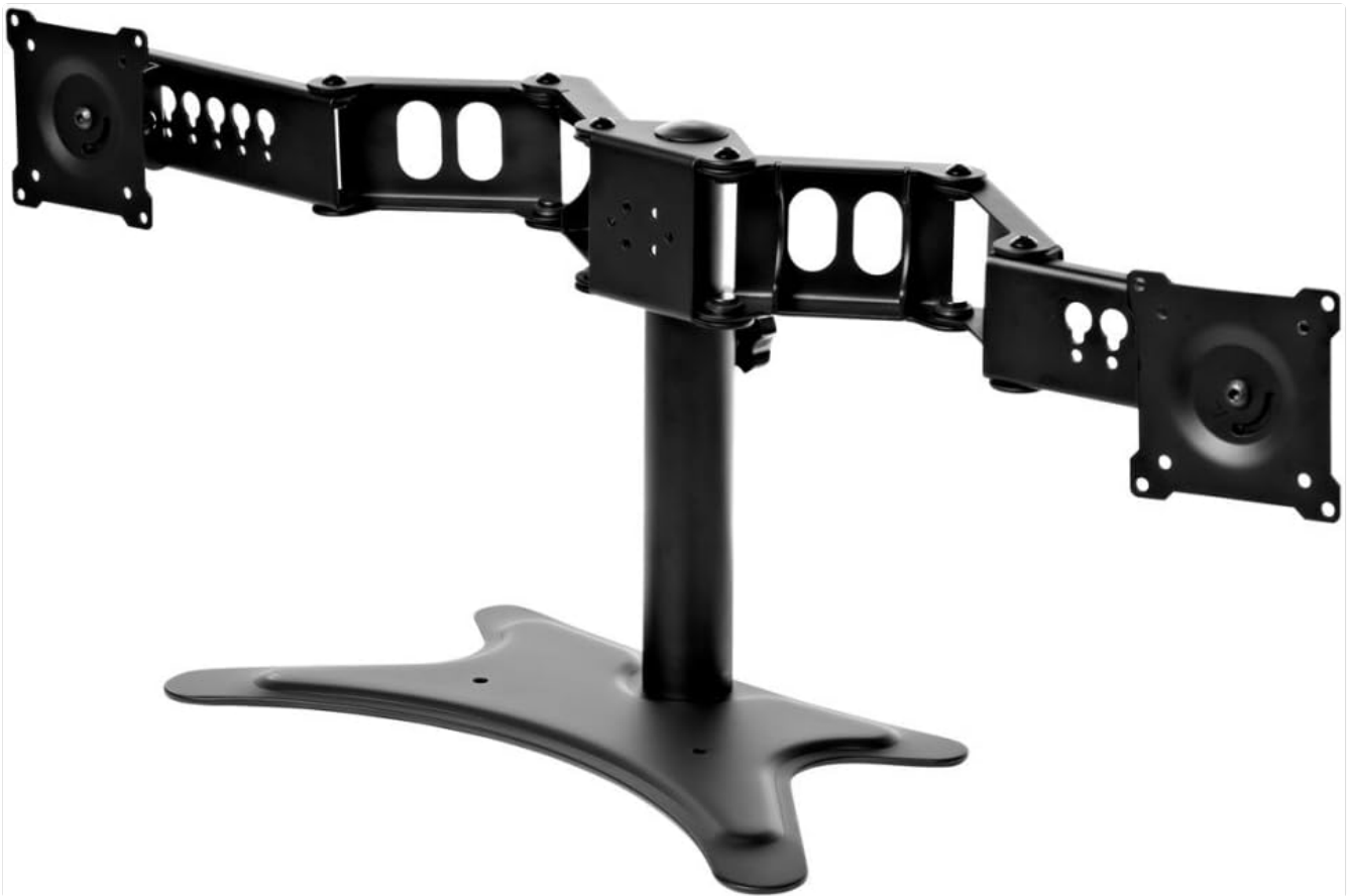
Image: The DoubleSight Dual Monitor Flex Stand, showcasing its robust design and dual arm configuration.