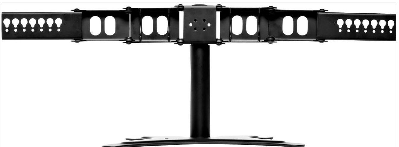
Image: A VESA mounting bracket, illustrating its 90-degree pivot capability for portrait viewing and 45-degree forward/back tilt for customized viewing angles. Compatible with 75mm x 75mm and 100mm x 100mm hole patterns.

Each monitor requires a VESA bracket to be attached to its rear mounting points. The stand supports VESA 75mm x 75mm and 100mm x 100mm hole patterns. Use the screws provided with your monitor or the stand to secure the brackets firmly.