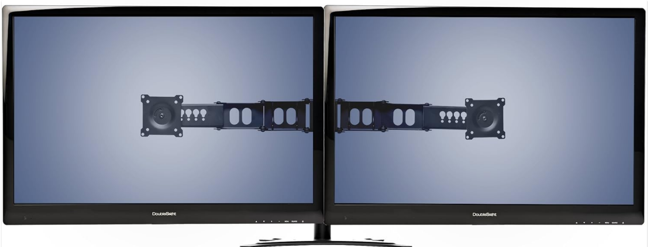
Image: The DoubleSight Dual Monitor Flex Stand with two monitors attached, demonstrating the potential for flexible positioning.

Each monitor can be independently adjusted for tilt, swivel, and pivot. The VESA brackets allow for 90-degree pivot for portrait viewing and 45-degree forward/back tilt. Utilize the hinged points on the arms to swivel monitors to your preferred angle.