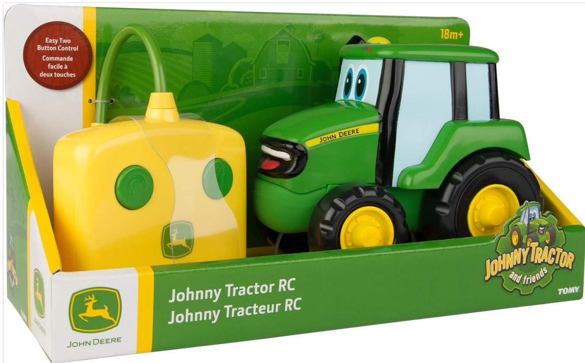
Image: The John Deere Johnny Tractor Remote Control toy displayed in its original retail packaging, showing the tractor and the yellow remote control.