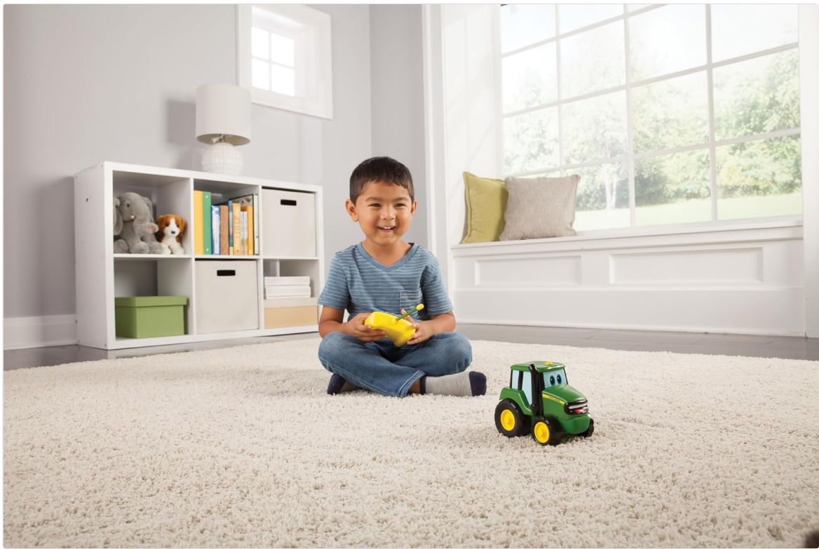
Image: A young child sitting on a light-colored rug, smiling and holding the yellow remote control, with the green and yellow John Deere Johnny Tractor positioned in front of them, ready for play.