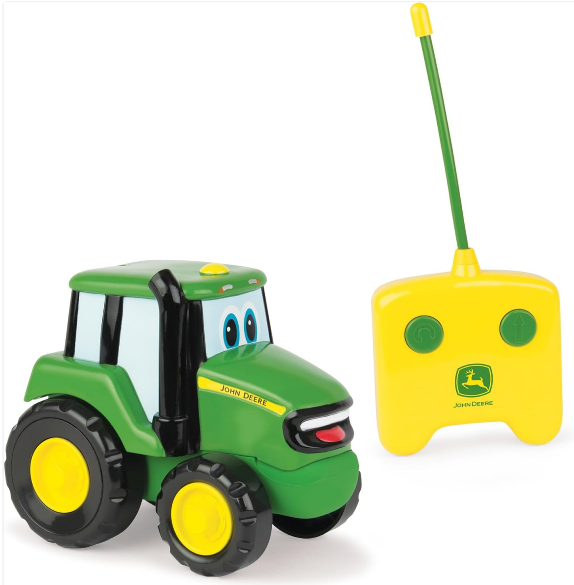
Image: The John Deere Johnny Tractor, green and yellow, positioned next to its yellow two-button remote control with a flexible antenna. This illustrates the primary components of the toy.