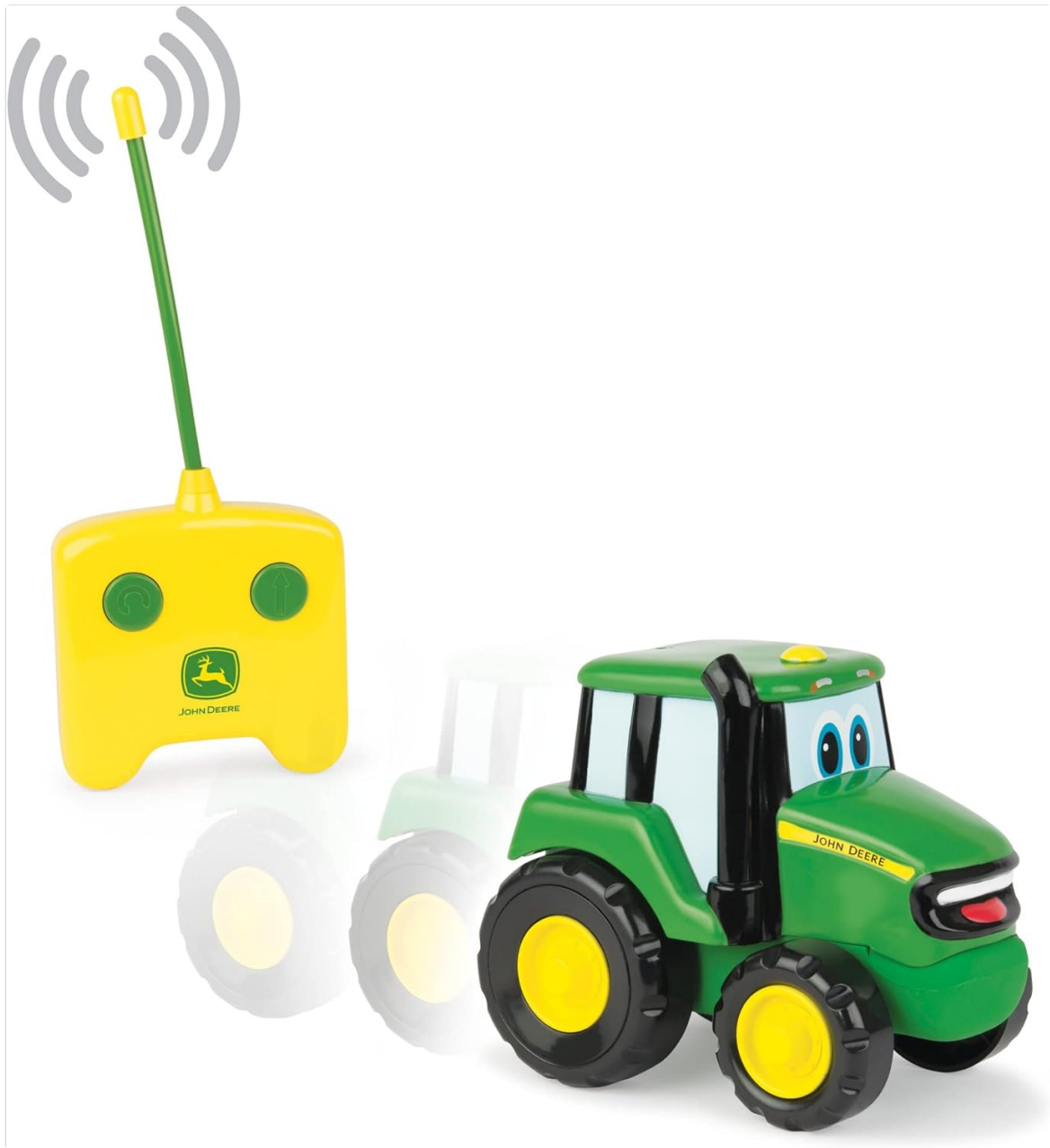
Image: The John Deere Johnny Tractor in motion, with an illustration of radio waves emanating from the remote control, demonstrating its remote operation.