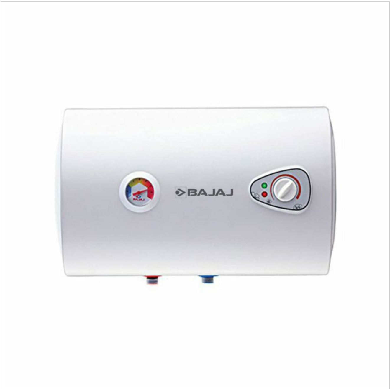
Image 1: Front view of the Bajaj Majesty 15GMH 15-Litre Storage Water Heater, showing the temperature gauge and control knob.