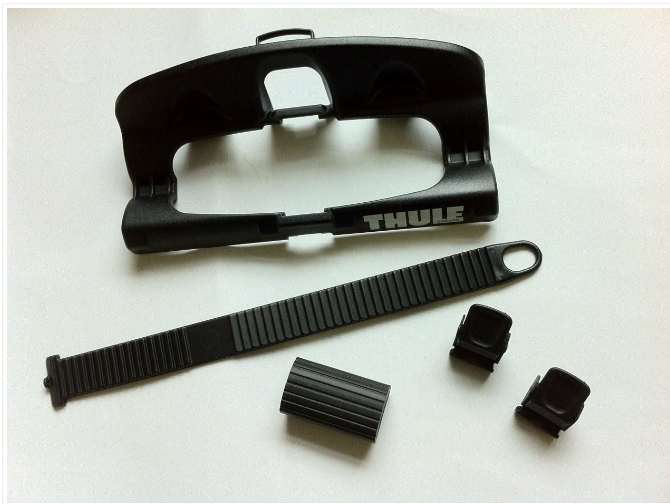
Figure 1: Components of the Thule Wheel Holder, Strap & Rim Protector kit. This image displays the main wheel holder frame, a long black strap with ridges, a smaller ribbed rim protector, and two small black clips, all designed to secure a bicycle wheel to a Thule roof rack.

The Thule ProRide 591 OutRide 561 Wheel Holder, Strap & Rim Protector is an essential accessory designed to enhance the stability and protection of your bicycle's wheels when transported on compatible Thule roof-mounted cycle carriers. This kit ensures that the bicycle wheel is securely fastened and protected from potential damage during transit.