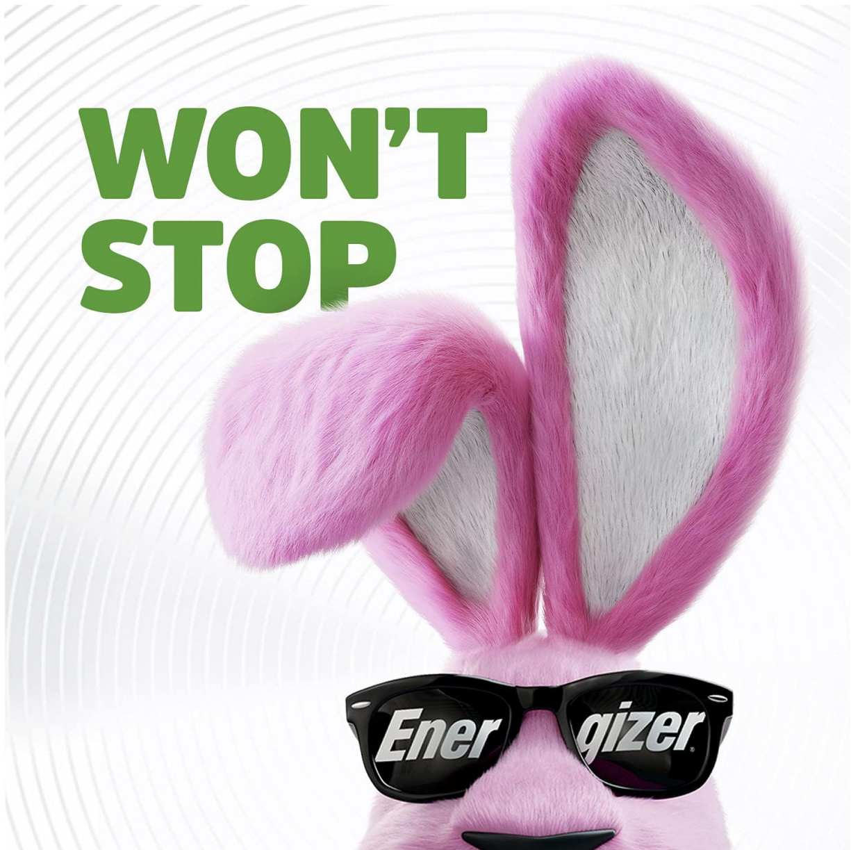
Image: Graphic stating that Energizer Recharge batteries come charged and ready for use.