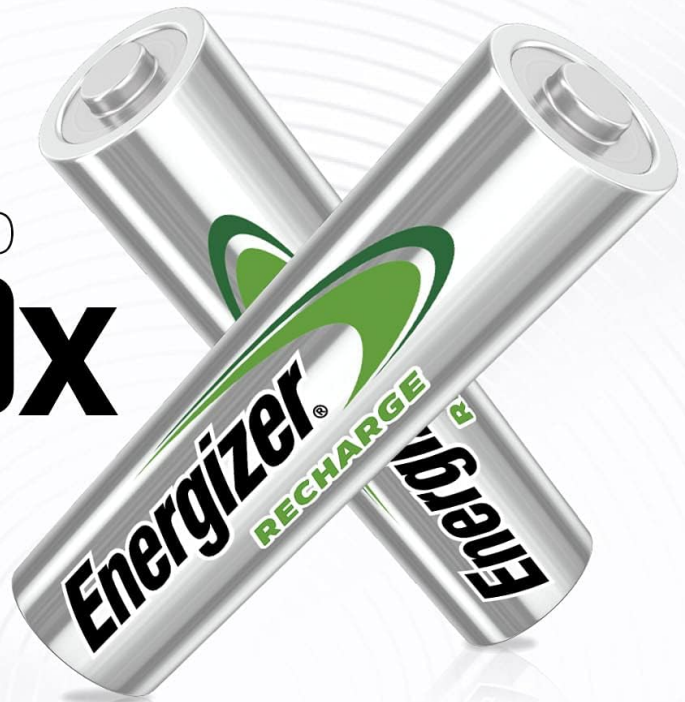
Image: Graphic illustrating the ability to recharge batteries up to 1,000 times.