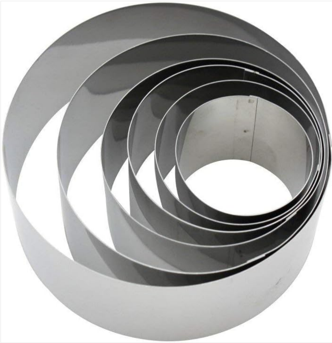
Image 1: The six professional steel cake rings nested for storage, showcasing their varying diameters.