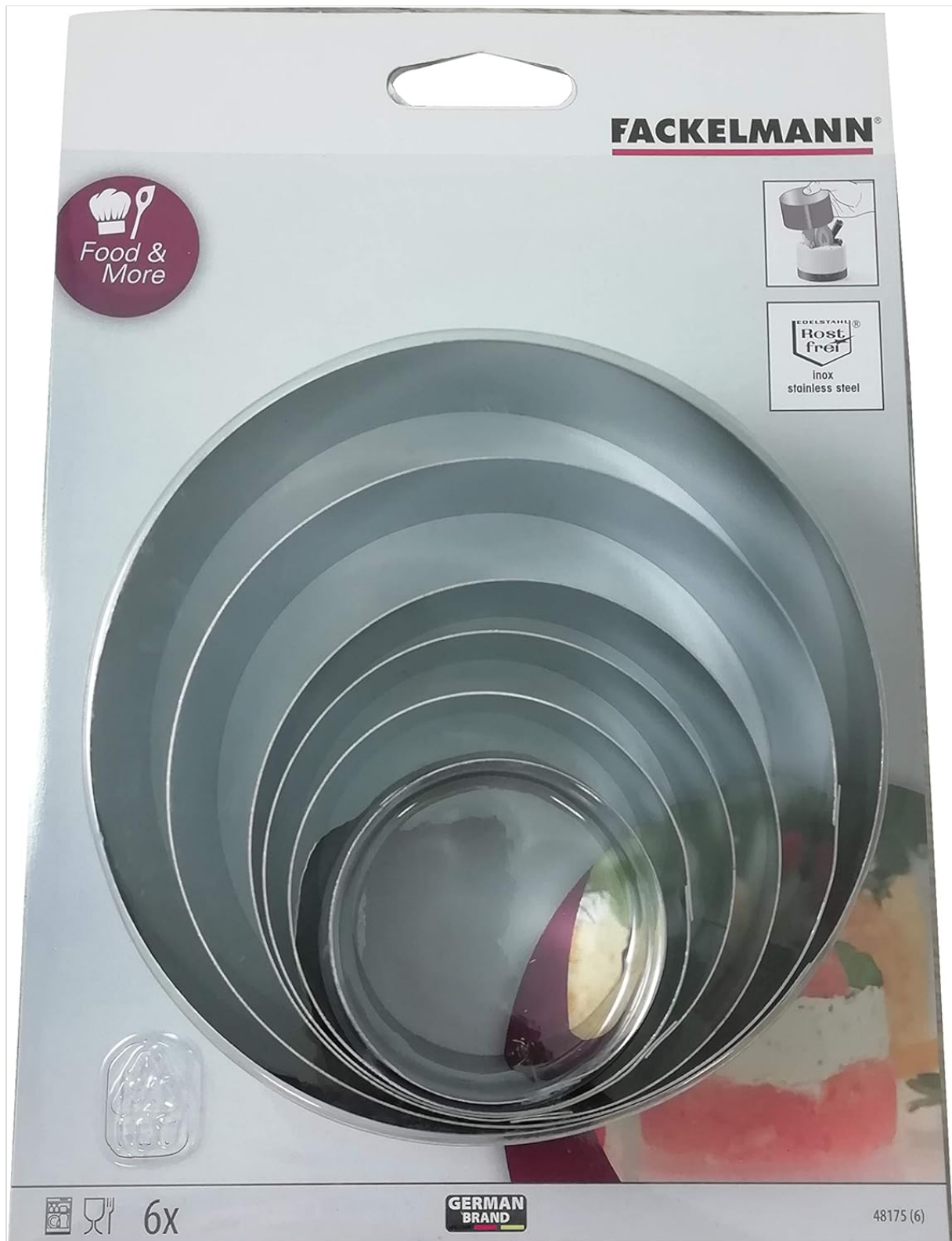
Image 2: The Fackelmann cake rings displayed in their original retail packaging, showing the brand and product details.